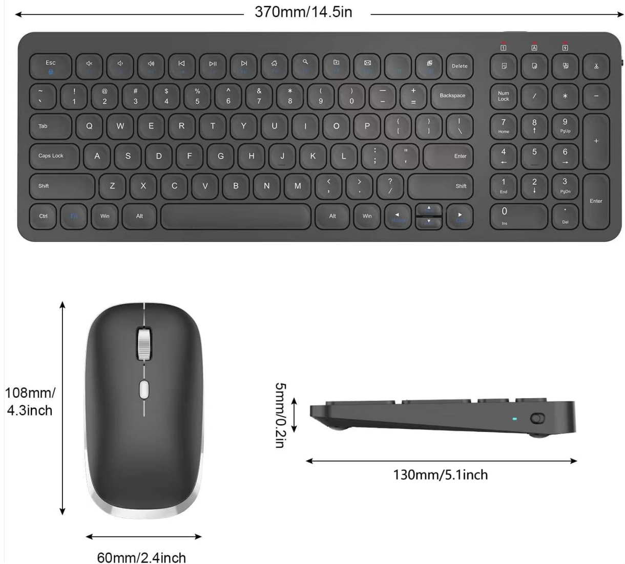
Image: Diagram illustrating the dimensions of the cimeteck Wireless Keyboard and Mouse, highlighting their compact and ultra-thin profiles.