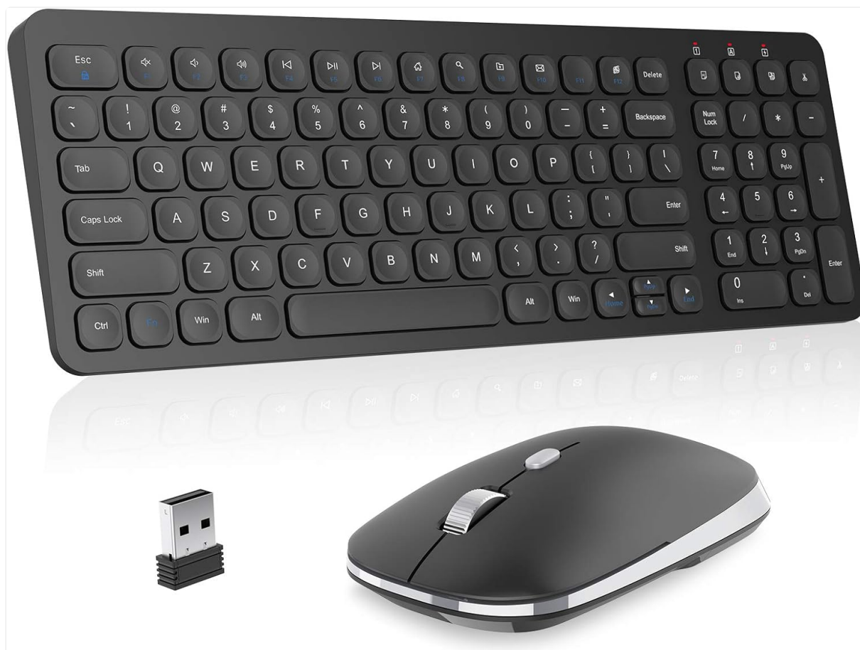
Image: The cimetech Wireless Keyboard and Mouse Combo, featuring the full-size keyboard, ergonomic mouse, and the compact USB receiver.

This manual provides detailed instructions for the setup, operation, maintenance, and troubleshooting of your cimetech 2.4G Wireless Keyboard and Mouse Combo. Please read this manual thoroughly before using the product to ensure optimal performance and longevity.