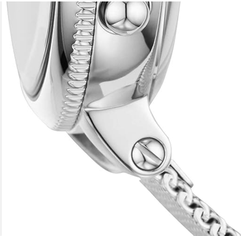
Image Description: This image provides a close-up side view of the Fossil Monroe Hybrid Smartwatch HR. The silver watch case is visible, featuring a textured edge. On the right side of the case, three distinct push buttons are clearly shown, which are used for navigating the watch's functions and accessing various features.