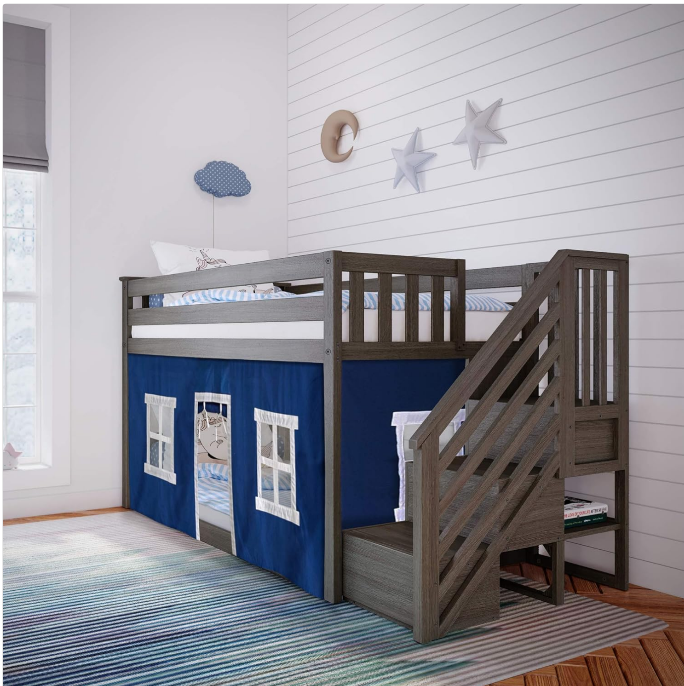
Image: Max & Lily Low Bunk Bed, Twin-Over-Twin, in Clay color with blue curtains and integrated staircase.