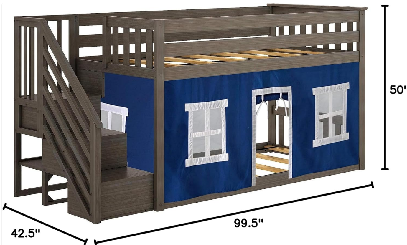
Image: Dimensional diagram of the Max & Lily Low Bunk Bed.