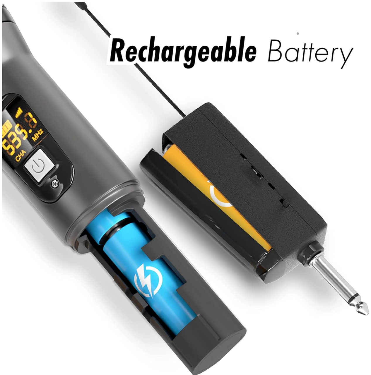
Image: Illustration of the rechargeable battery being inserted into the microphone's receiver.

Video: Official setup and feature overview for the Dolphin MCX10 Wireless UHF Microphone System. This video demonstrates the unboxing, battery installation, and connection process to a speaker.