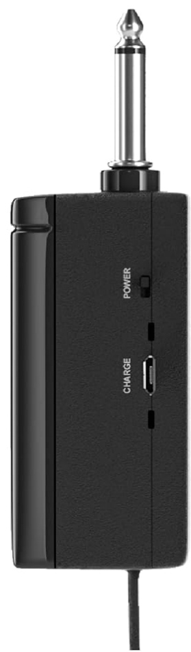
Image: The Dolphin MCX10 Wireless Microphone highlighting its extra long distance capability with a 200ft range.