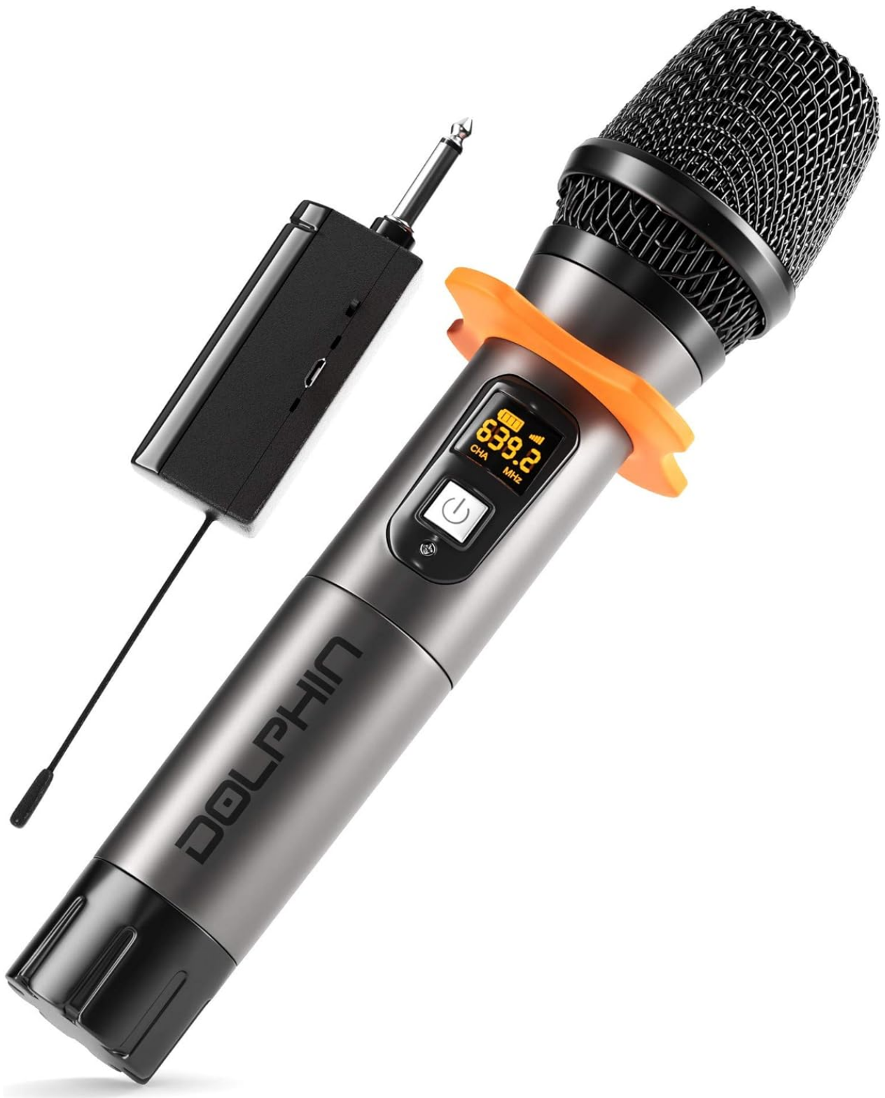
Image: The Dolphin MCX10 Wireless Microphone and its accompanying 1/4" wireless receiver.