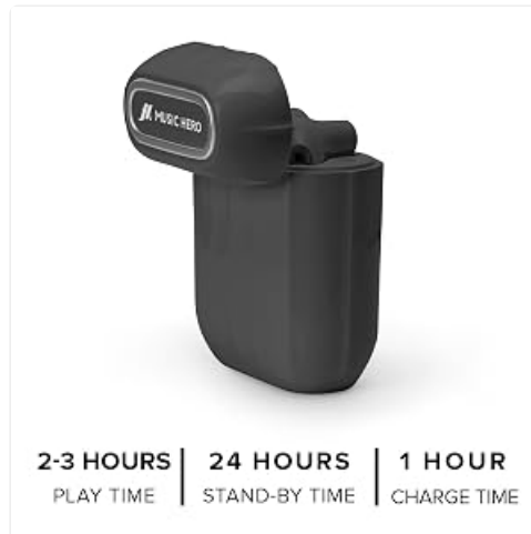
Image 2.1: The charging case with earphones inside, ready for charging.