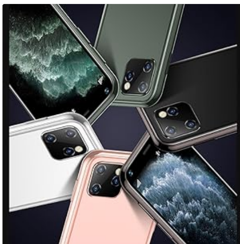
Image: The Tuanzi XS11 Mini Smartphone with a screen protector, illustrating its compact design and display.