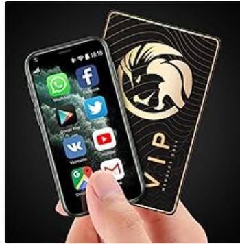
Image: The Tuanzi XS11 Mini Smartphone displaying its home screen with various pre-installed and downloadable applications.

The Tuanzi XS11 runs on Android 6.0 and supports Google Play. You can download and install various applications from the Google Play Store. Ensure you have a stable internet connection for downloads.