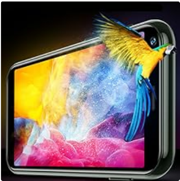
Image: Representation of the quad-core processor powering the Tuanzi XS11 Mini Smartphone.