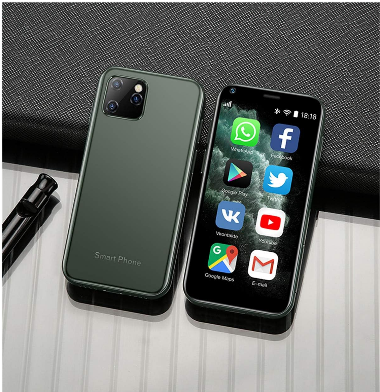
Image: The Tuanzi XS11 Mini Smartphone showing the location of the SIM card tray for installation.