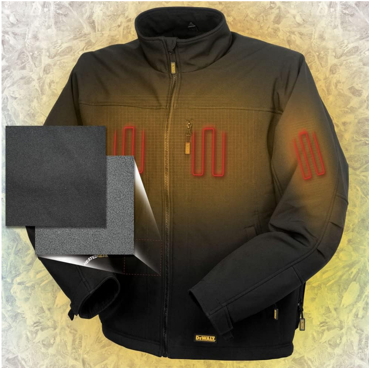
Figure 2: Heating zones within the jacket.