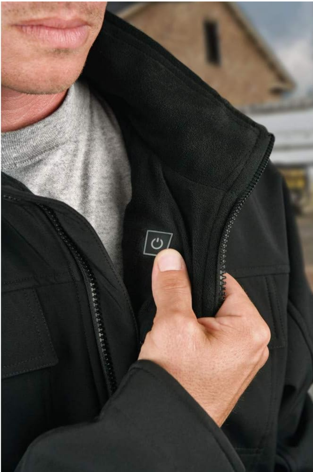
Figure 5: Power button and heat control on the jacket.