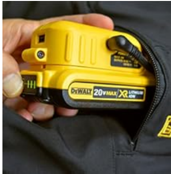
Figure 4: DEWALT battery adapter with USB charging port.

The battery adapter also features a USB charging port, allowing you to charge portable electronic devices while the jacket is in use or when the battery is not powering the jacket.