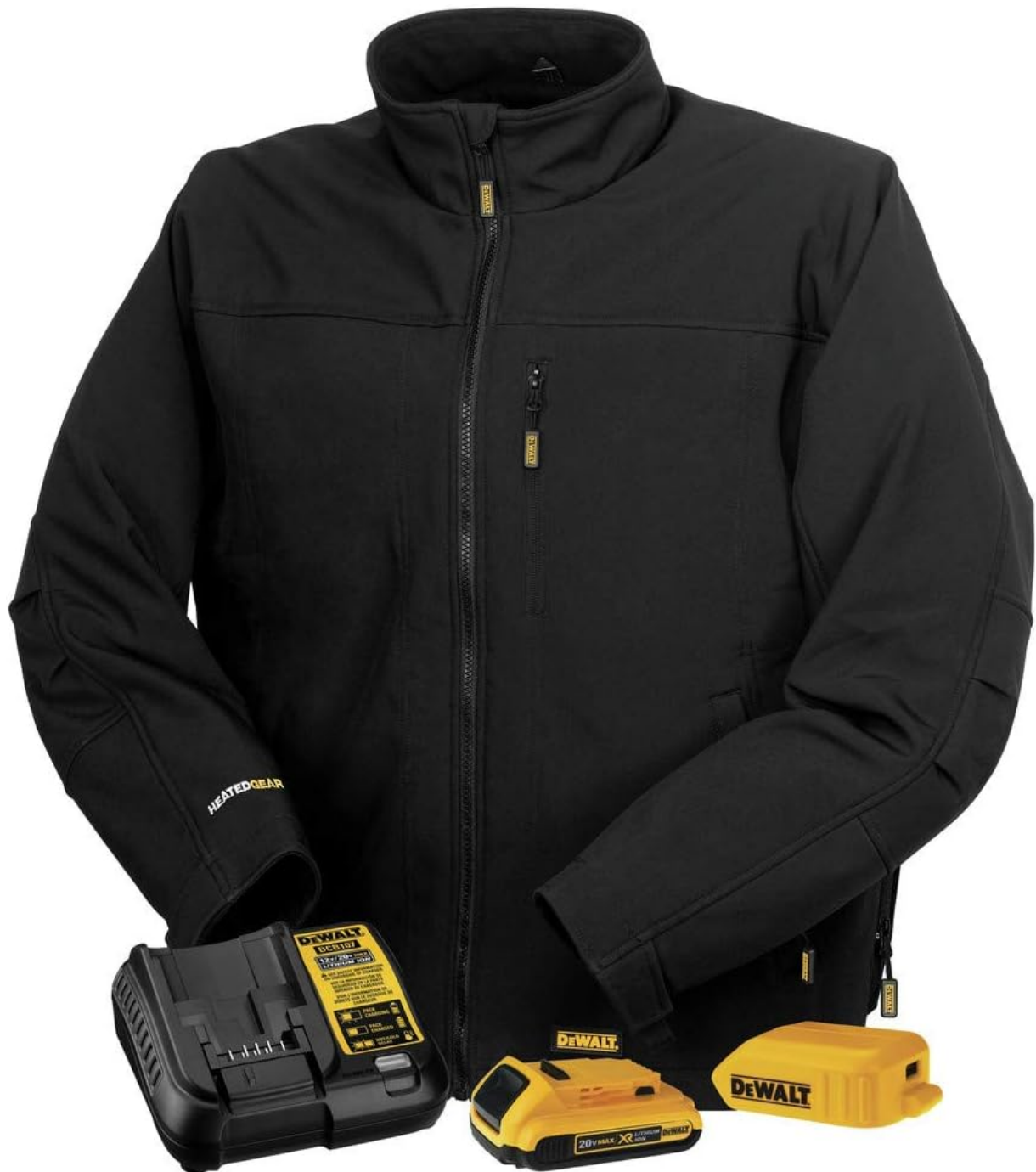
Figure 1: DEWALT Heated Soft Shell Jacket Kit, including jacket, 20V MAX battery, and charger.