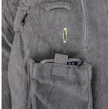
Figure 3: Inserting the battery and adapter into the jacket's internal pocket.

The battery adapter also features a USB charging port, allowing you to charge portable electronic devices while the jacket is in use or when the battery is not powering the jacket.