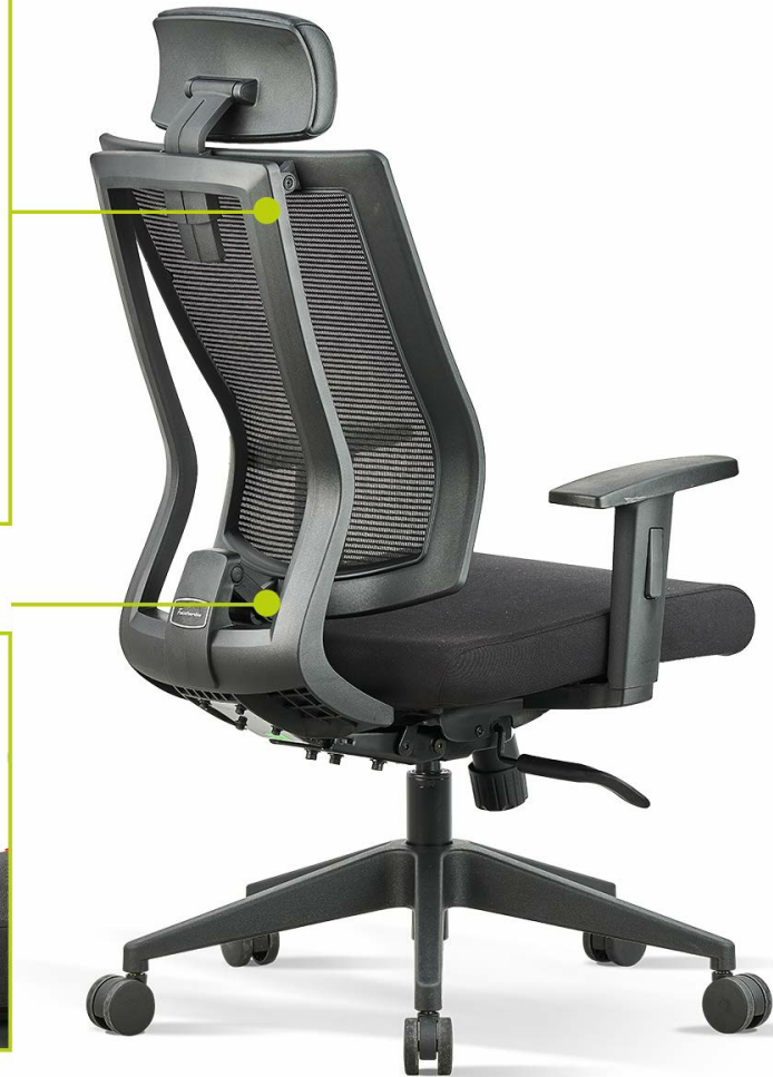
Image: This image highlights the adjustable arms with soft PU padding and the lever for seat height adjustment on the Featherlite Liberate chair.