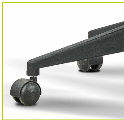
Nylon Base & Castors