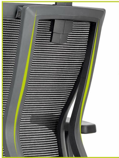
Dual frame flexible lumbar support