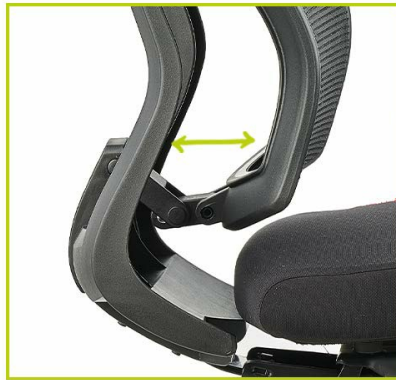
Dynaflex mechanism for ultimate comfort