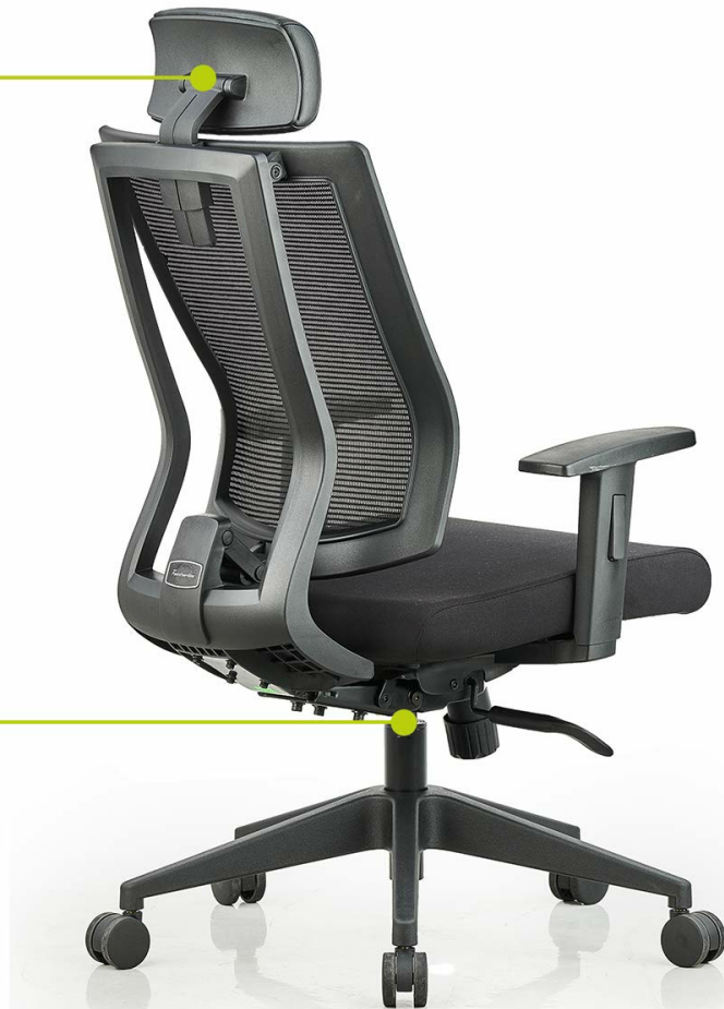
Image: This image details the IS 20D mesh backrest, providing breathability, and the comfortable fabric upholstered cushion seat of the Featherlite Liberate chair.