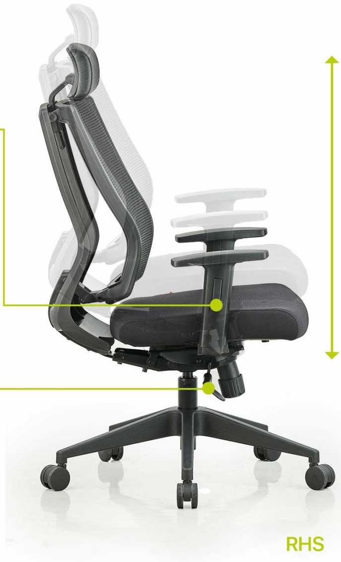
Image: This image displays the overall dimensions of the Featherlite Liberate chair, showing a height of 101 cm, a width of 48 cm, and a depth of 43 cm.

Seat height adjust Flip lever Up/Down to adjust