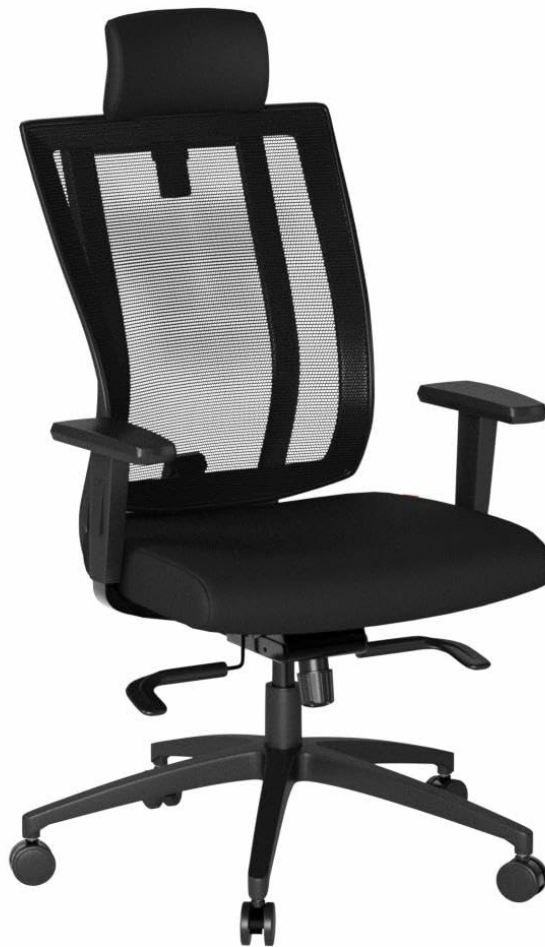
Image: This image illustrates the dual frame flexible lumbar support and the Dynaflex mechanism, designed for enhanced comfort, on the Featherlite Liberate chair.