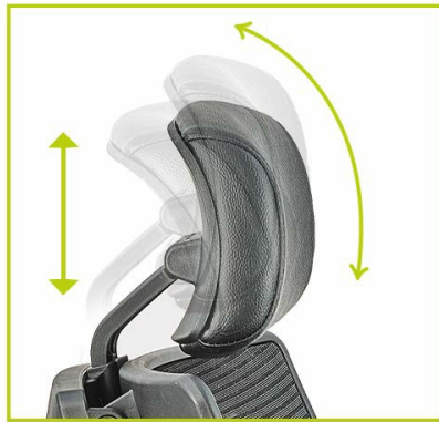
Adjustable & Flexible Headrest