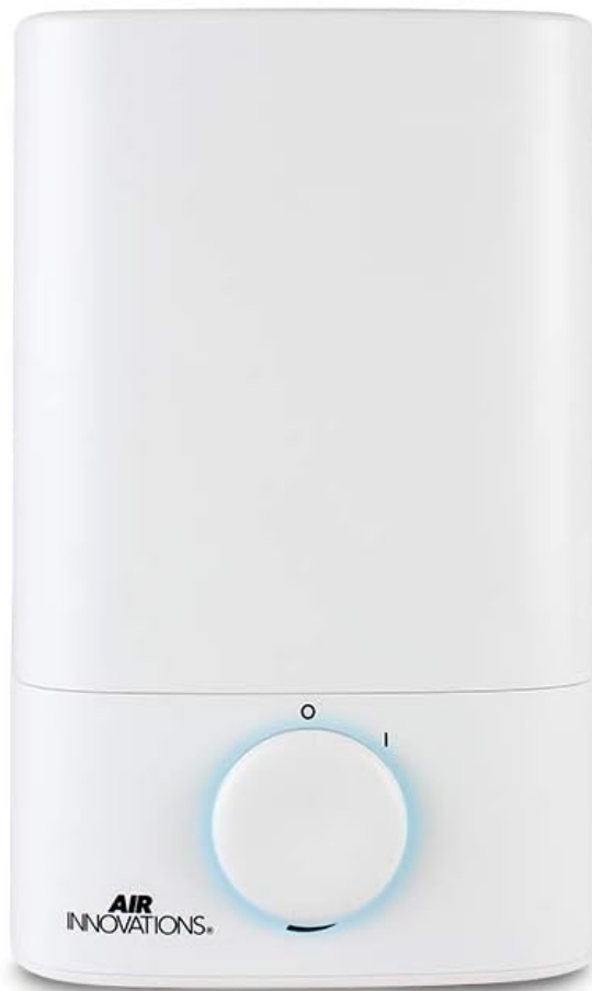
Image: Overview of key features including 70-hour run time, 4.5L tank, silent operation, and variable mist control dial.