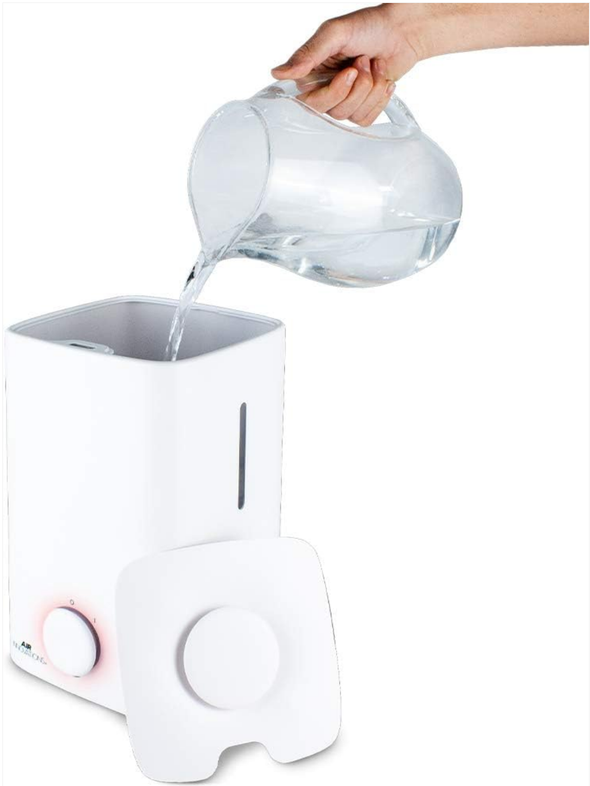
Image: A hand pouring water from a pitcher into the top opening of the humidifier, demonstrating the top-fill feature.