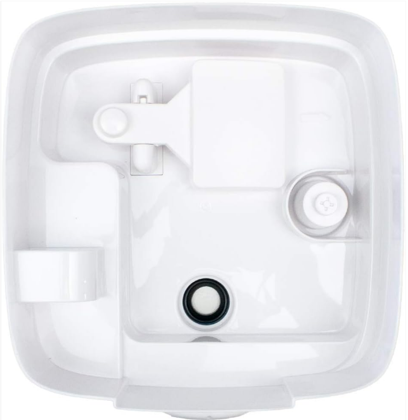
Image: Top-down view of the humidifier's base unit, showing the internal components including the ultrasonic transducer.