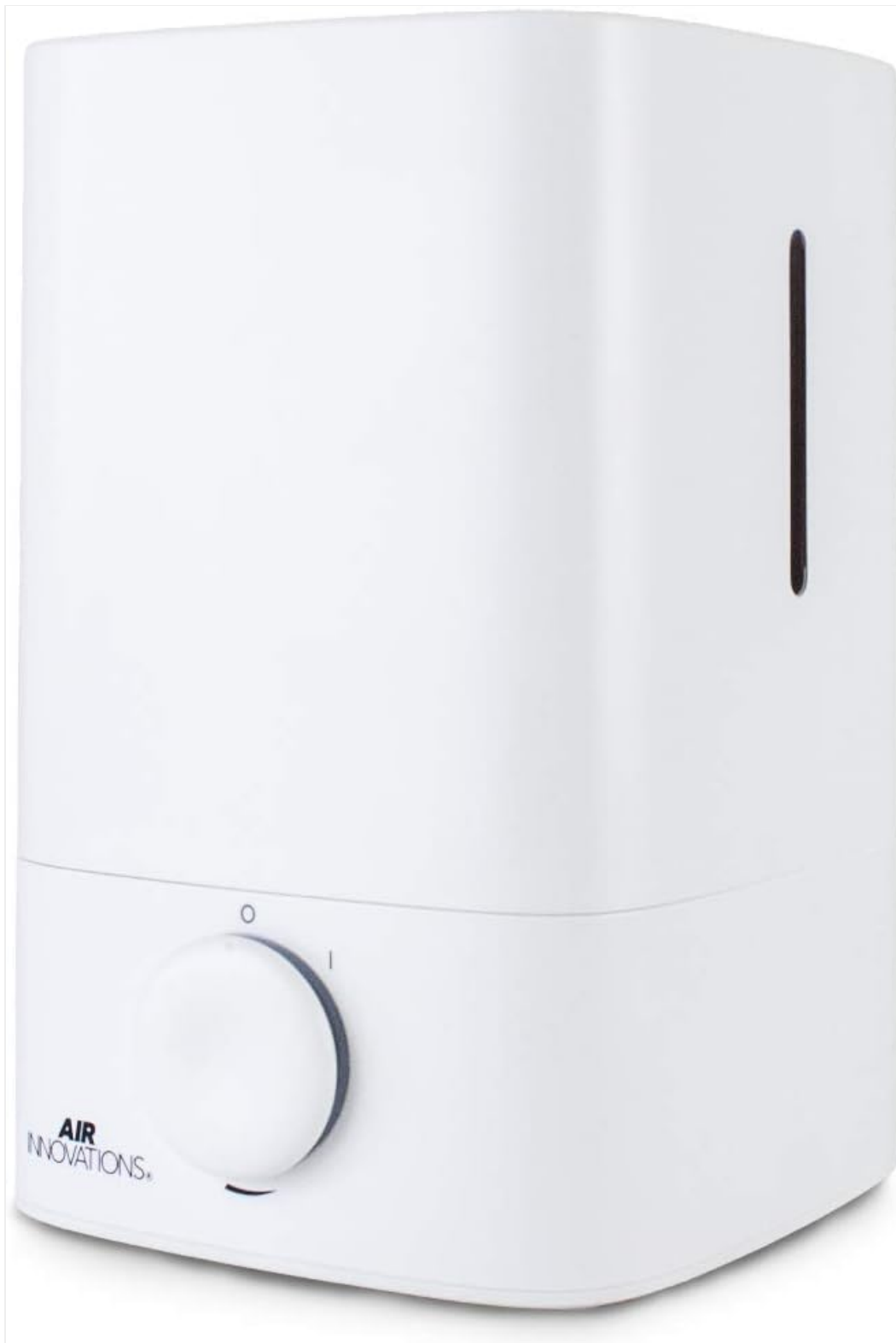
Image: Front view of the Air Innovations MH-419 Cool Mist Humidifier, showing the white casing, control dial, and water level window.