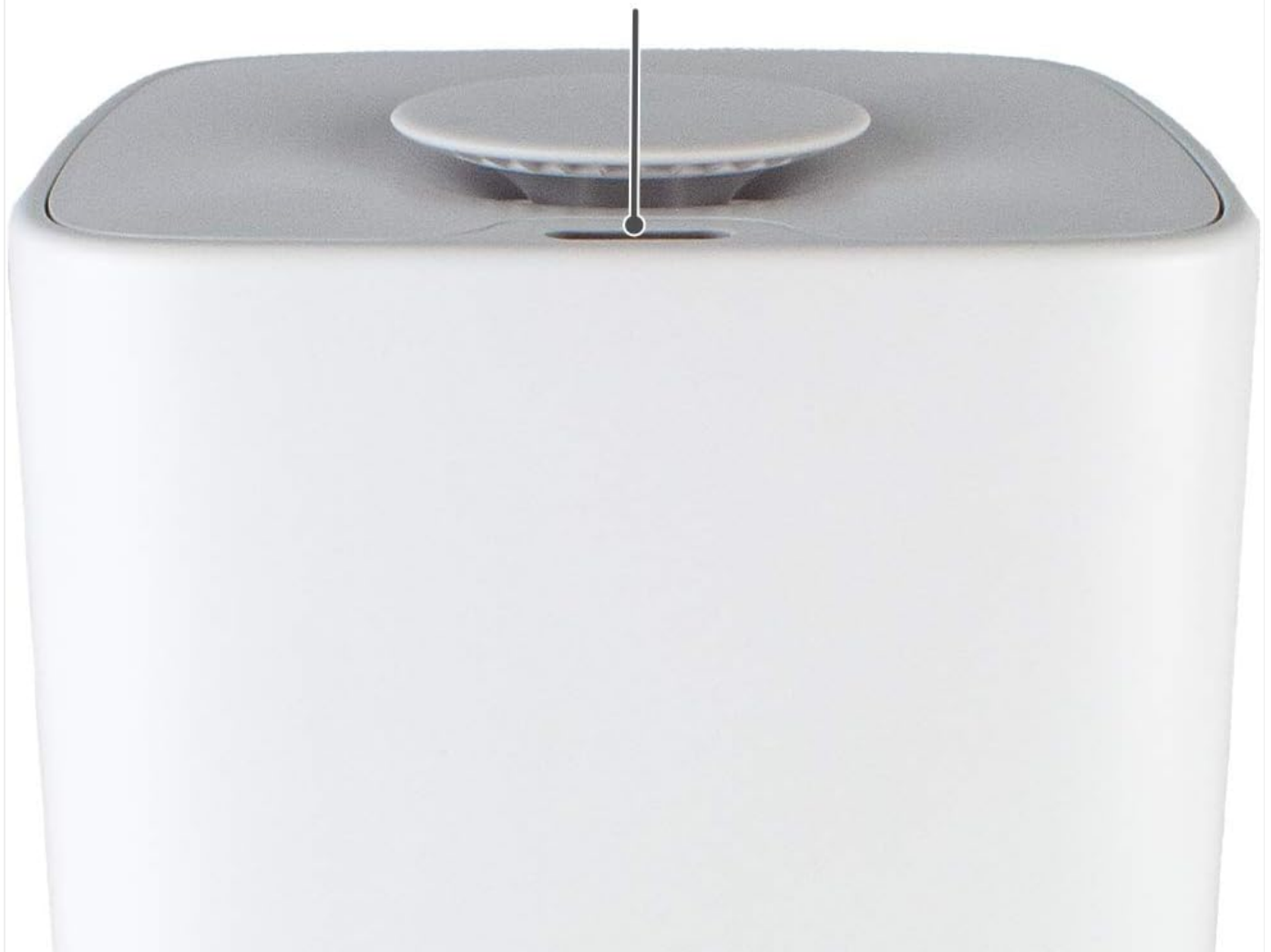
Image: Close-up view of the mist nozzle located on the top of the humidifier.