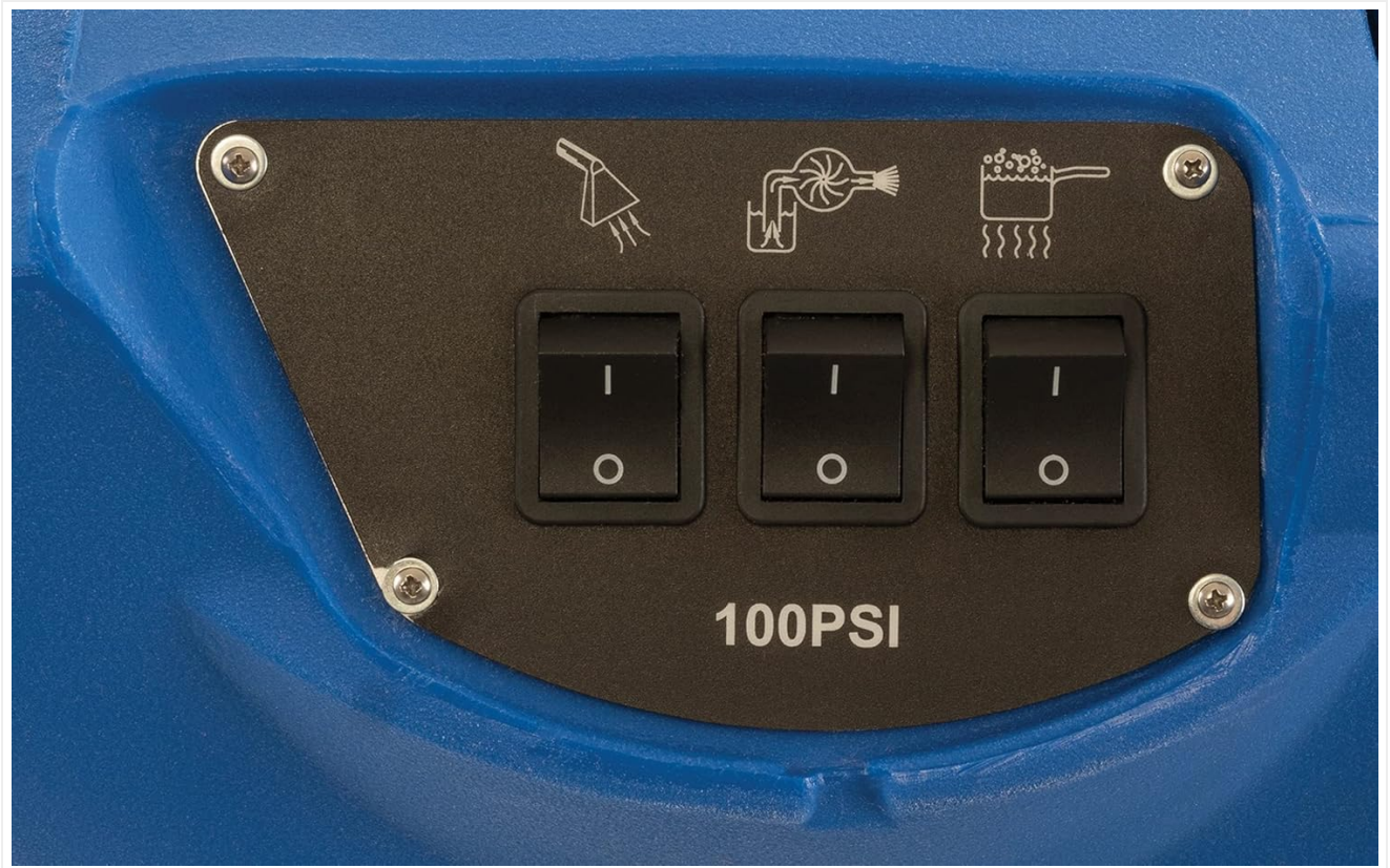
Figure 3: The control panel features clearly labeled switches for activating the spray, vacuum, and heating functions.