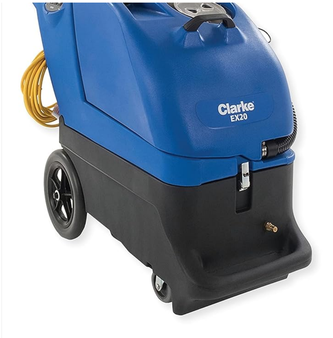
Figure 1: The Clarke EX20 100H Carpet Extractor, a powerful machine designed for deep carpet cleaning.