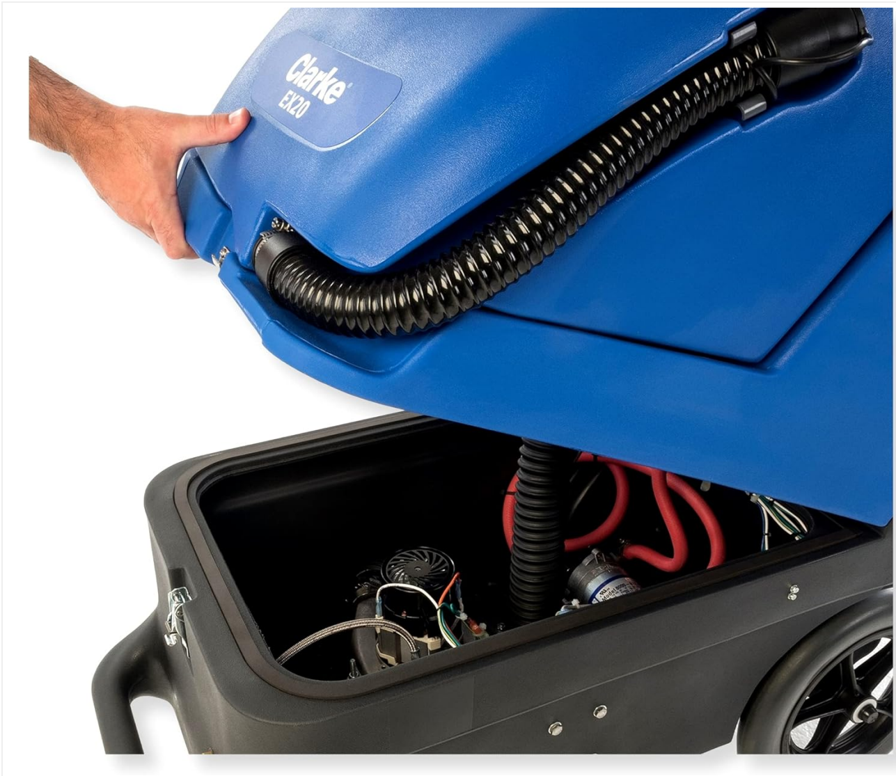
Figure 2: Accessing the internal components and tanks of the Clarke EX20 100H by lifting the top cover.