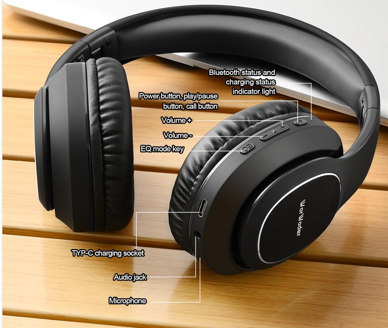
Image: Detailed diagram showing the location and function of buttons and ports on the WorWoder W-915 headphones.