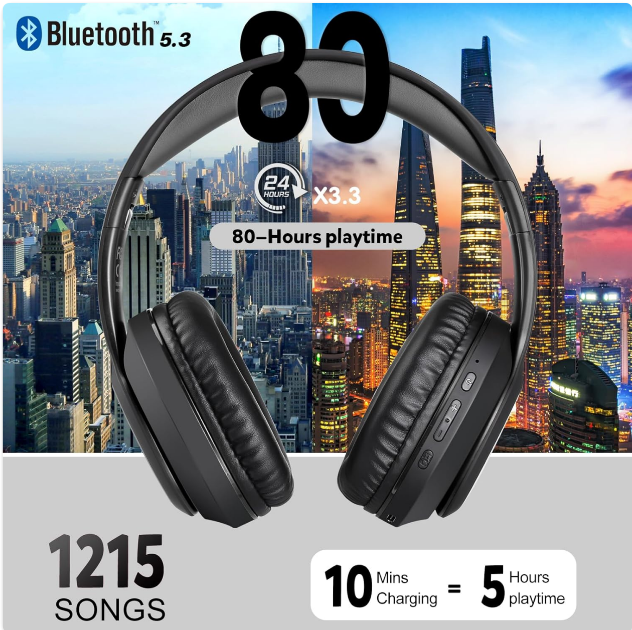
Image: Illustration highlighting the 80-hour battery life and the quick charge feature of the WorWoder W-915 headphones.