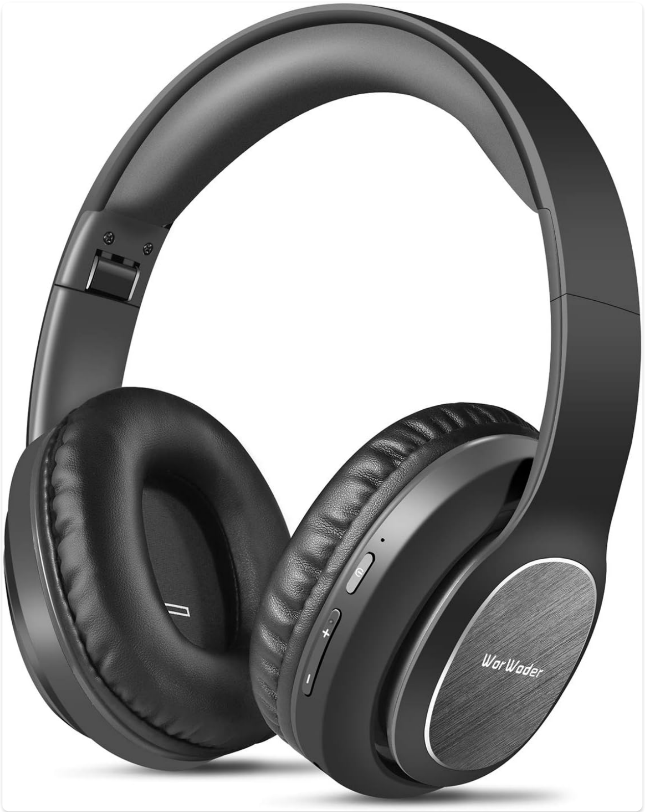
Image: The WorWoder W-915 headphones, the main product.