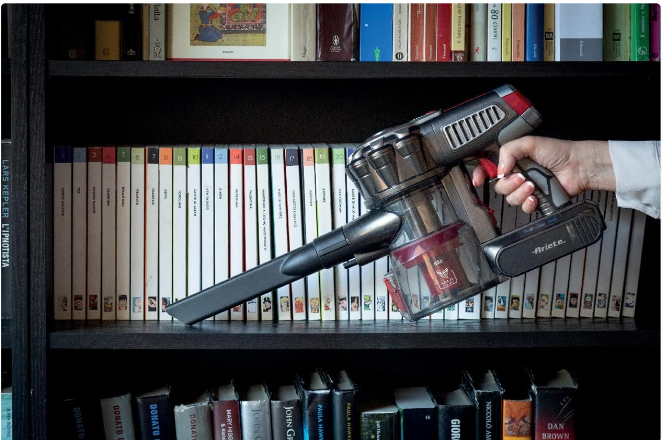
Image 5.5: The handheld unit can easily clean dust from shelves and tight spaces.