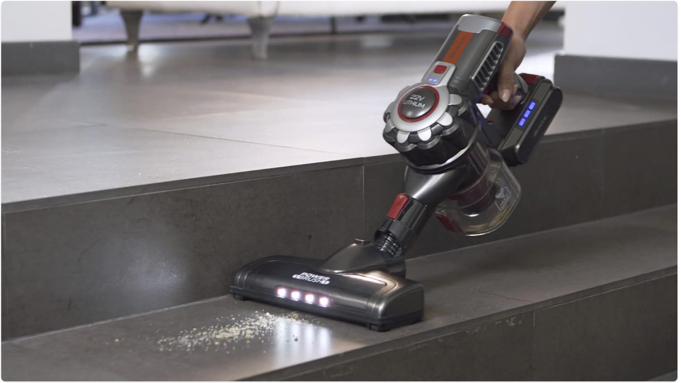
Image 5.6: The LED lights on the brush head illuminate dirt for thorough cleaning.