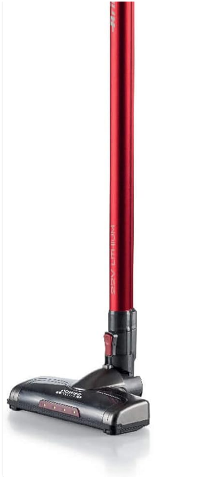
Image 1.1: The Ariete 2757 22V Lithium Cordless Electric Broom in its full stick vacuum configuration.