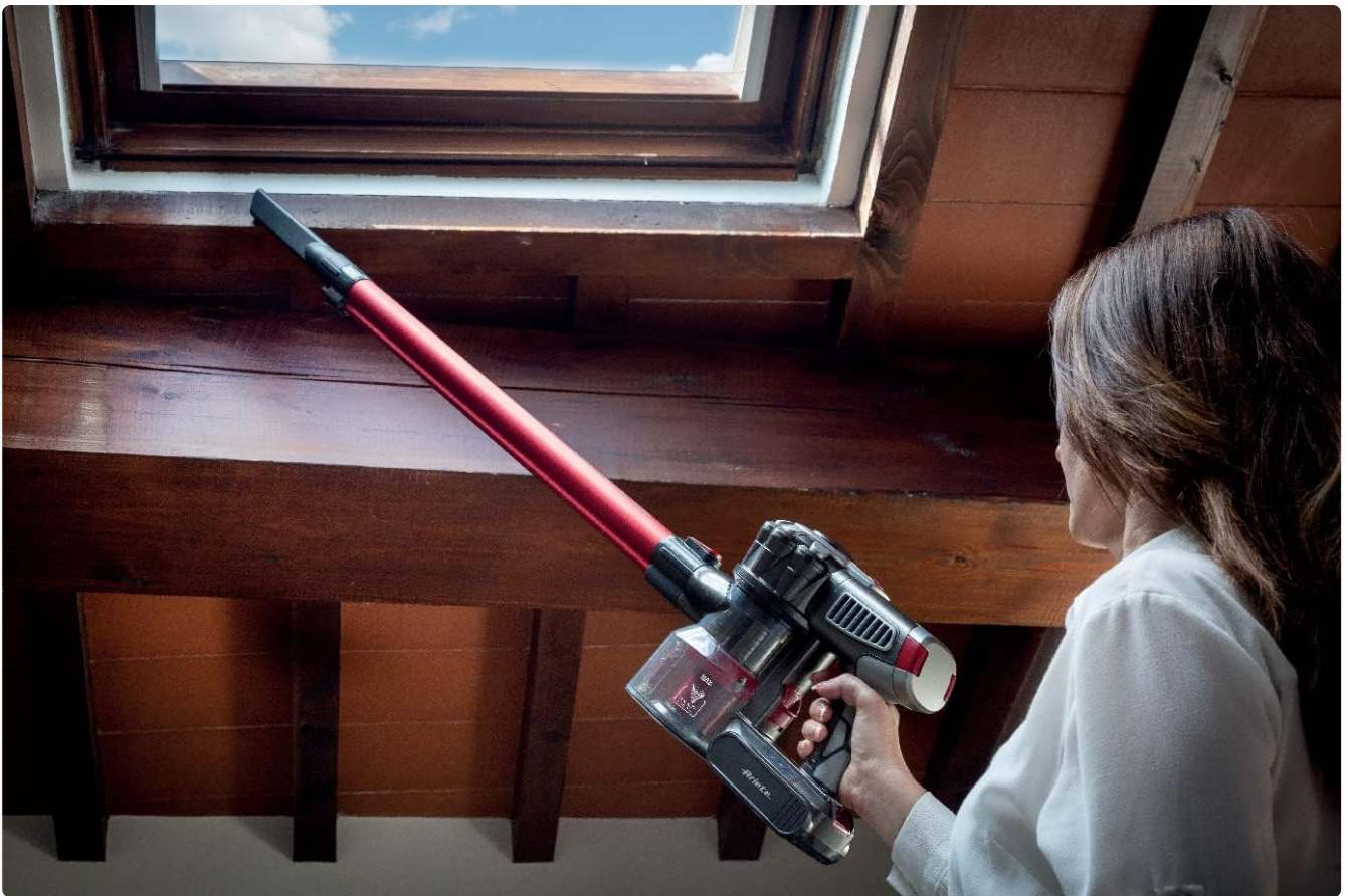
Image 5.2: The lightweight design allows for easy cleaning of high-up areas.