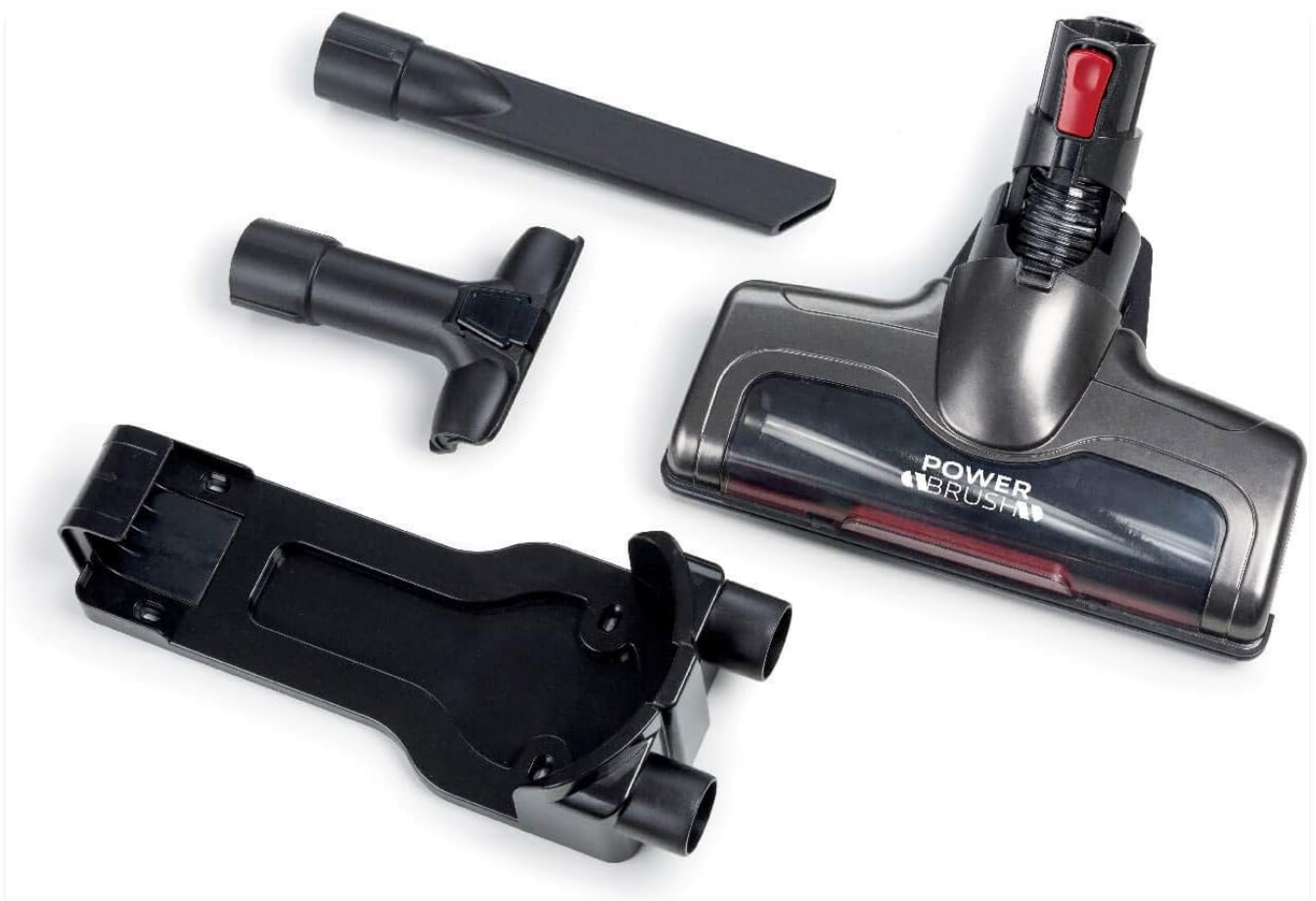
Image 3.1: All included accessories for the Ariete 2757 vacuum cleaner.