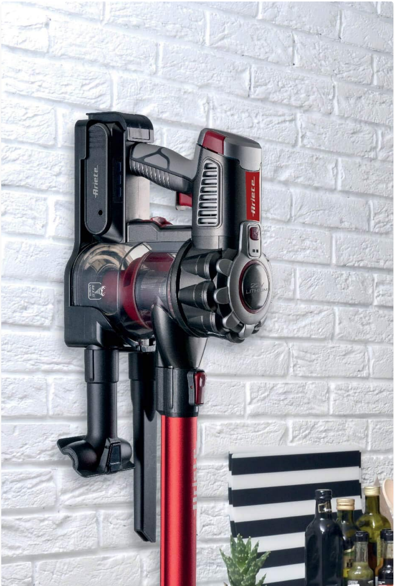
Image 4.1: The Ariete 2757 vacuum mounted on its wall support, ready for charging or storage.