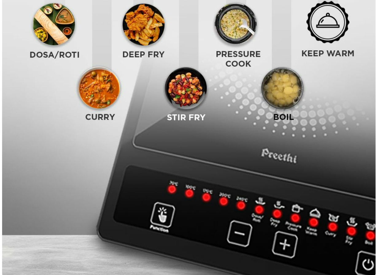
Figure 3: The 7 Preset Cooking Modes.