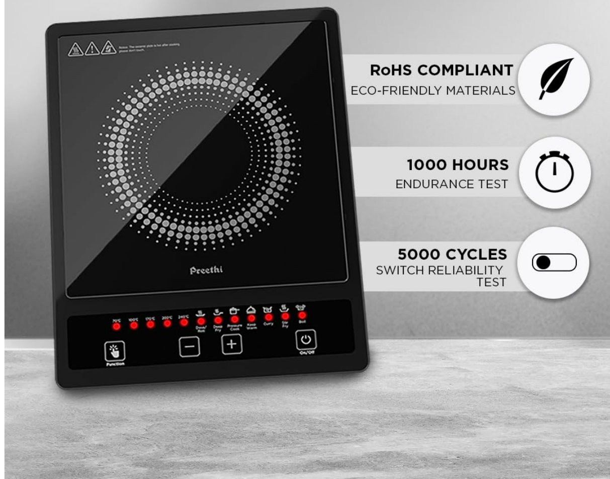
Figure 6: Quality Checks for the Induction Cooktop.