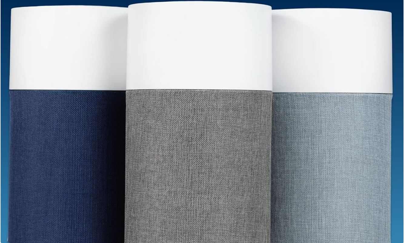
Figure 5: Customizable design with interchangeable pre-filter colors.

Three Scandinavian inspired washable pre-filter colors designed to seamlessly blend into your home