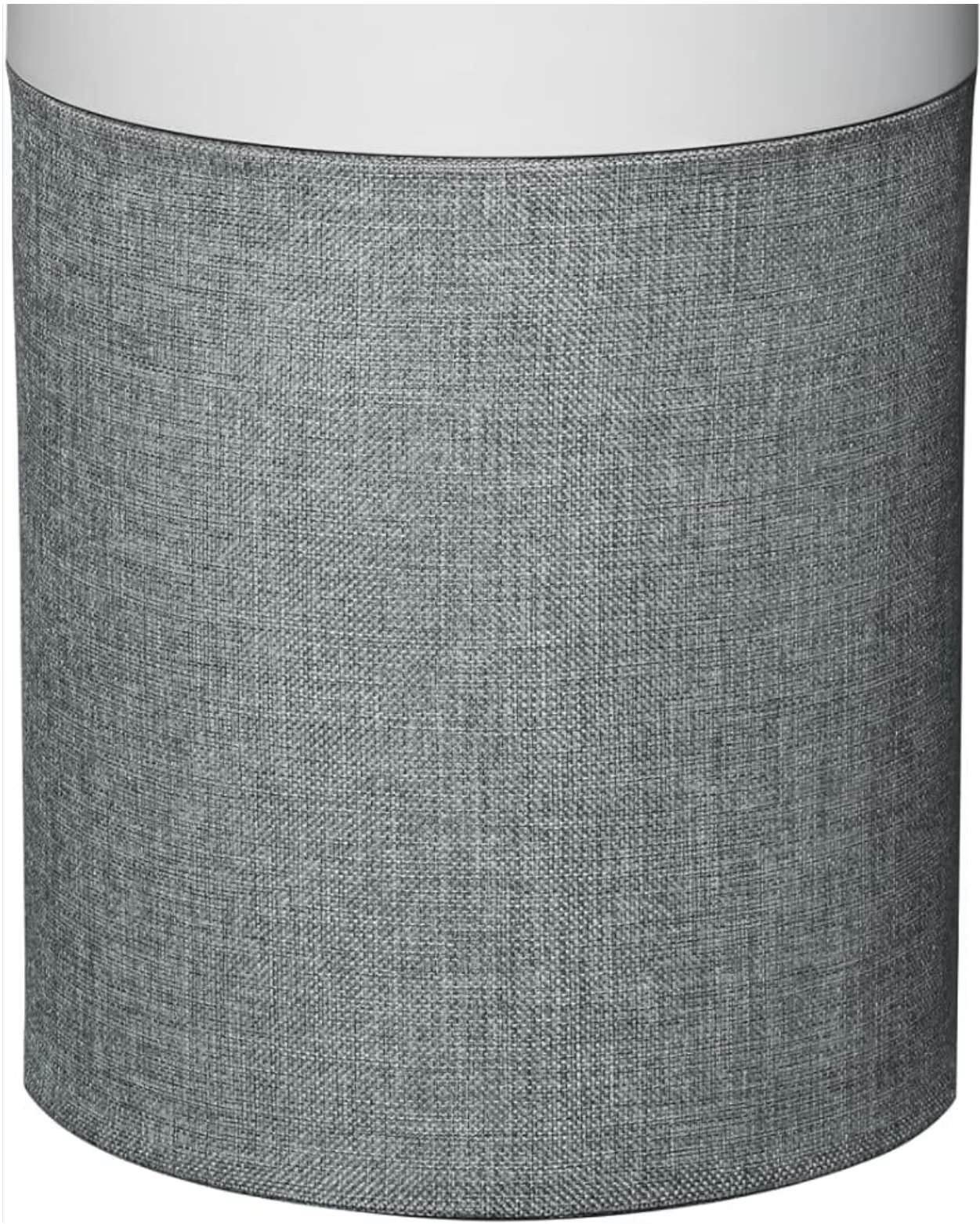
Figure 1: Front view of the Blueair Blue Pure 511 Air Purifier.