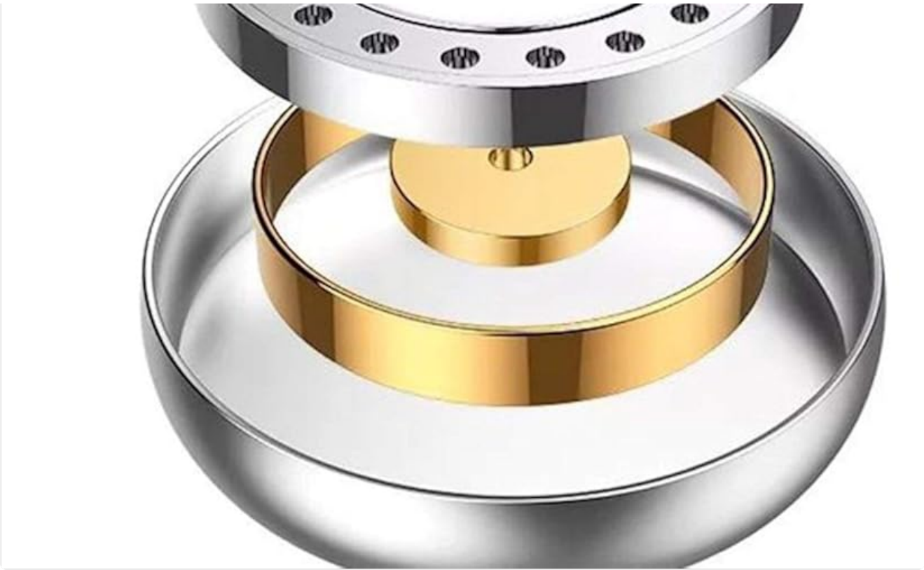
Image: A detailed diagram illustrating the internal components of the 13mm high fidelity speaker within the earphone.