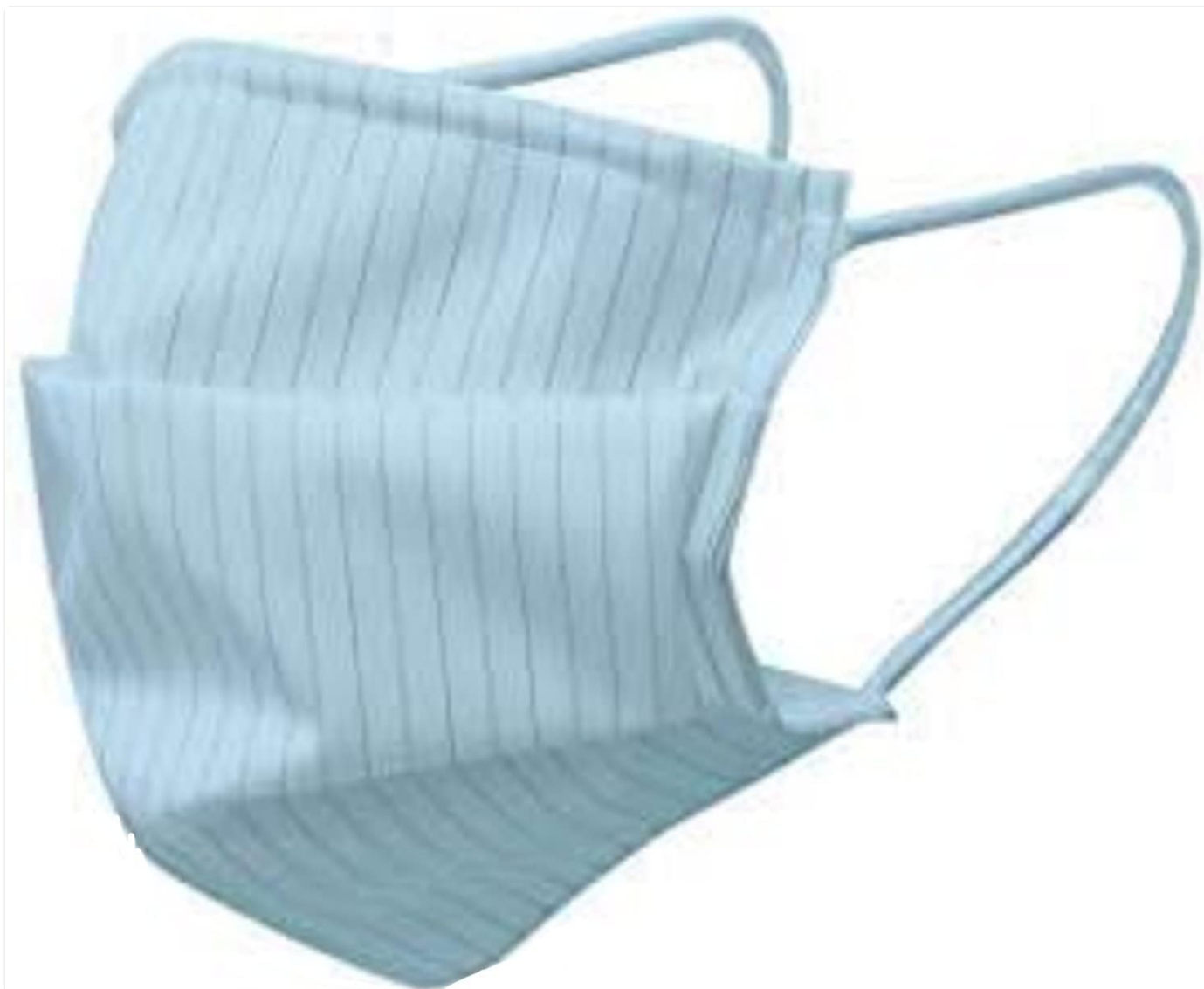
Figure 1: StaticTek MK008 Light Blue Reusable Anti-Static Fabric Protective Cover.