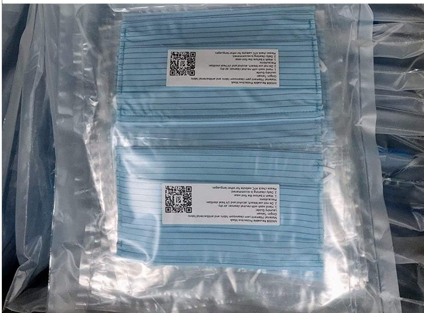
Figure 4: Product packaging with usage and care instructions.