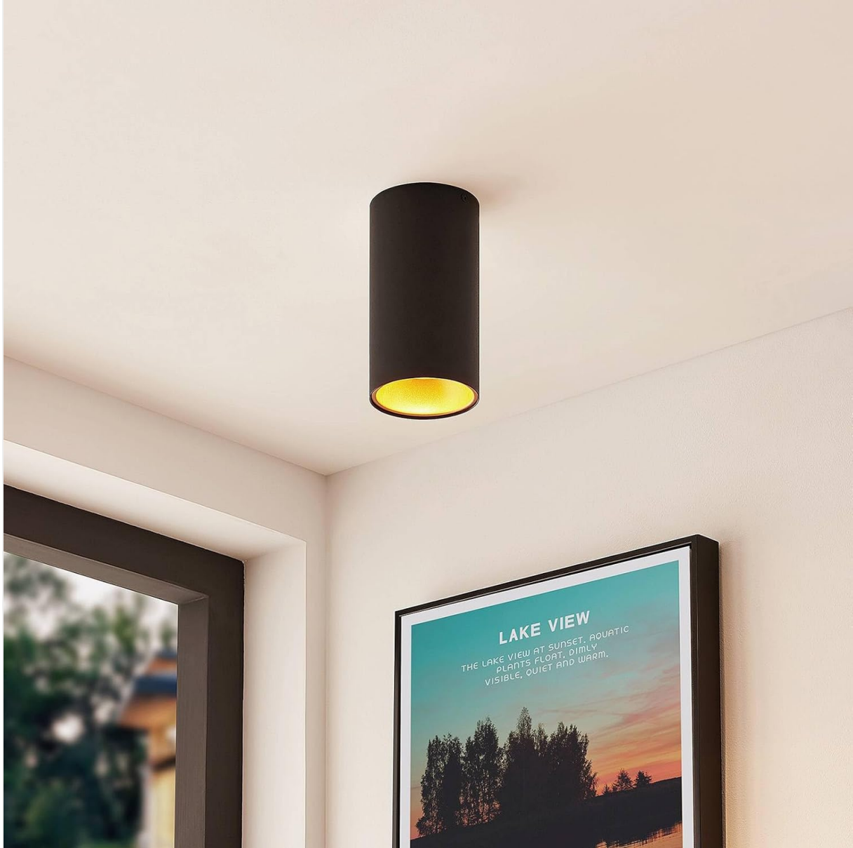
Image 4.2: The Arcchio 'Bucket' Ceiling Light installed on a ceiling, providing downward illumination in a hallway.