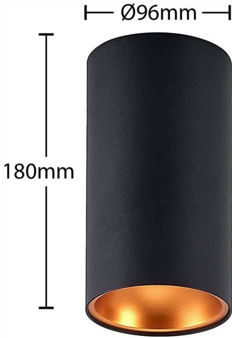
Image 8.1: Dimensional drawing of the Arcchio 'Bucket' Ceiling Light, showing a height of 180mm and a diameter of 96mm.