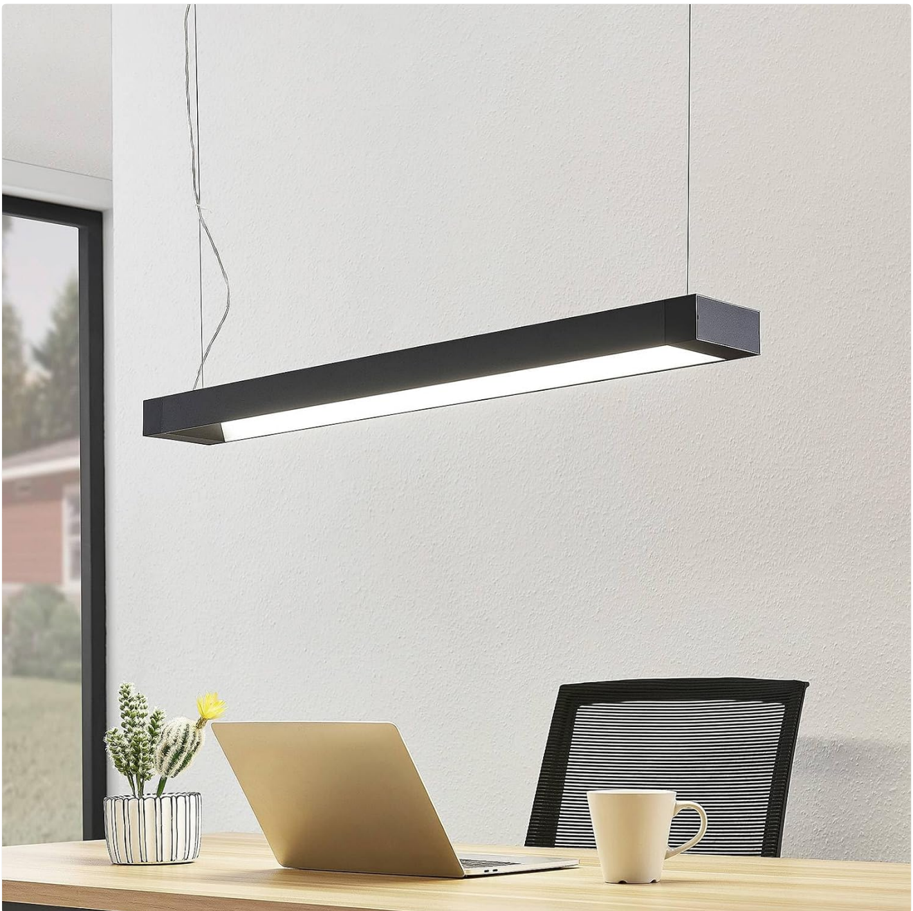
Image 1.1: Arcchio Cuna LED Pendant Light in an office environment.