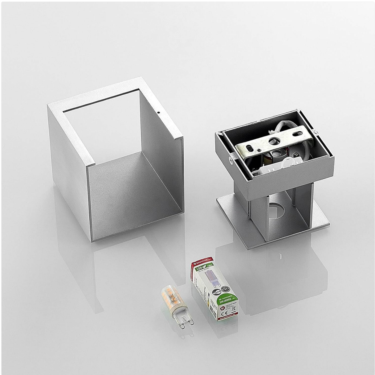
Image: Disassembled view of the Zuzana wall lamp, including the outer casing, the inner electrical unit, the G9 LED bulb, and its packaging. This illustrates the components included in the package.