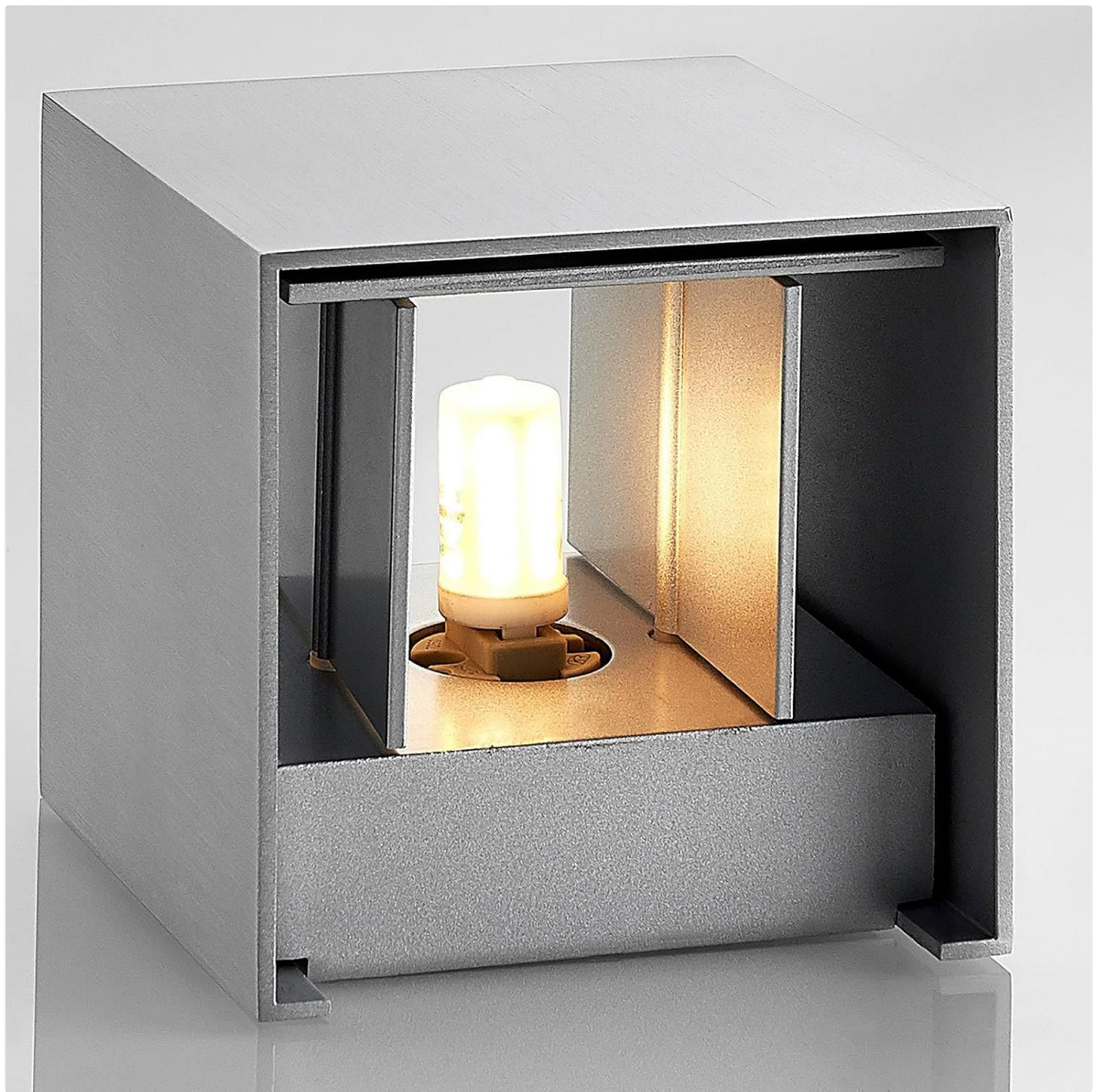
Image: An internal view of the lamp, showing the G9 LED bulb securely placed in its socket. This demonstrates the correct bulb insertion.