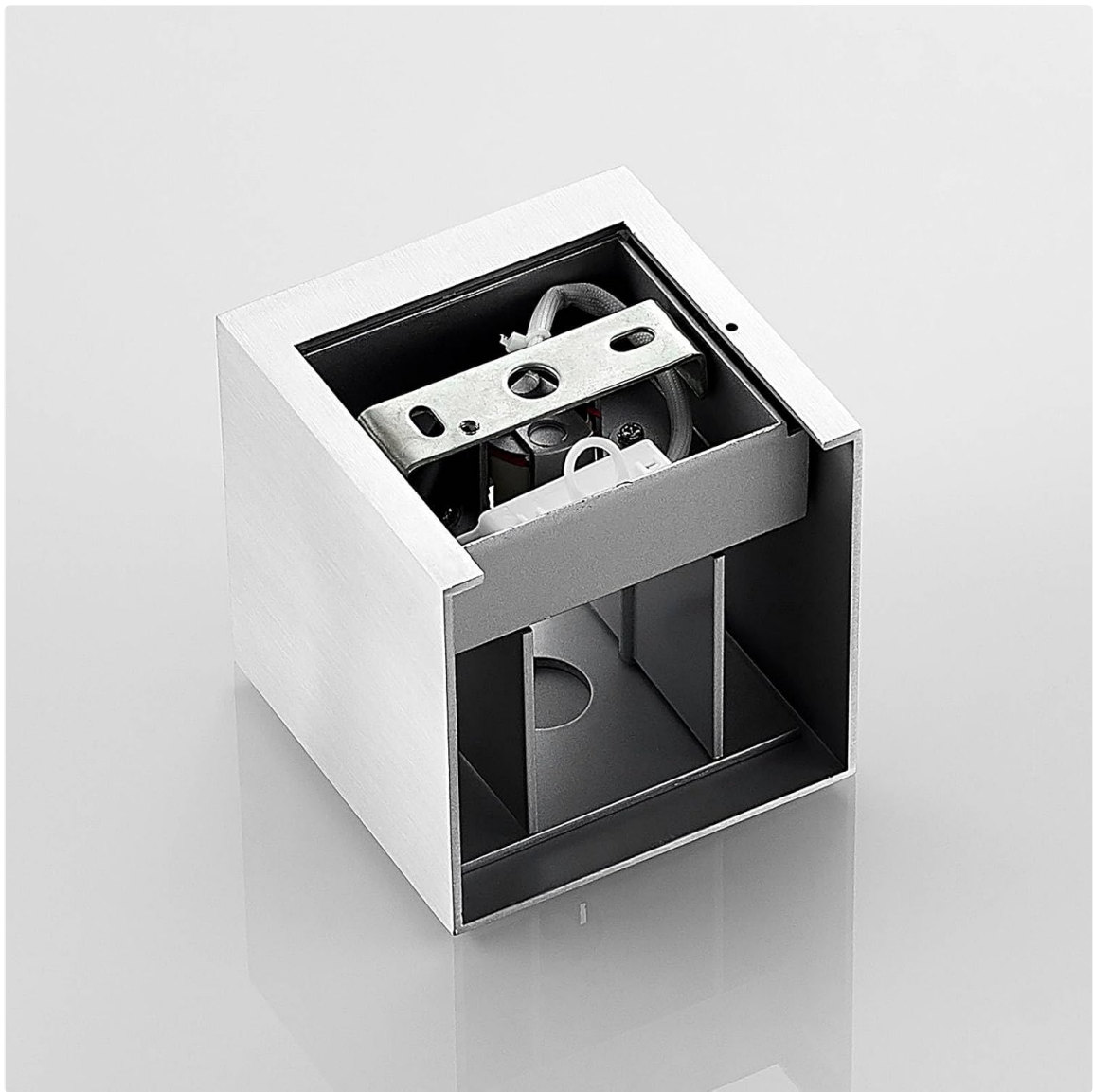
Image: Close-up of the inner electrical unit, showing the mounting plate and internal wiring connections. This unit is secured to the wall first.