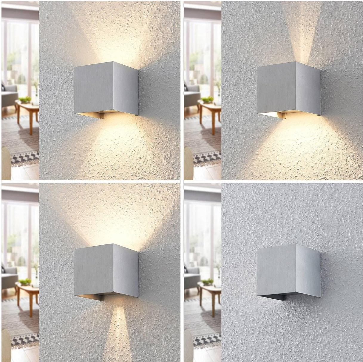
Image: This composite image shows the Zuzana wall lamp casting light in four different patterns, demonstrating the adjustable light emission angle feature.