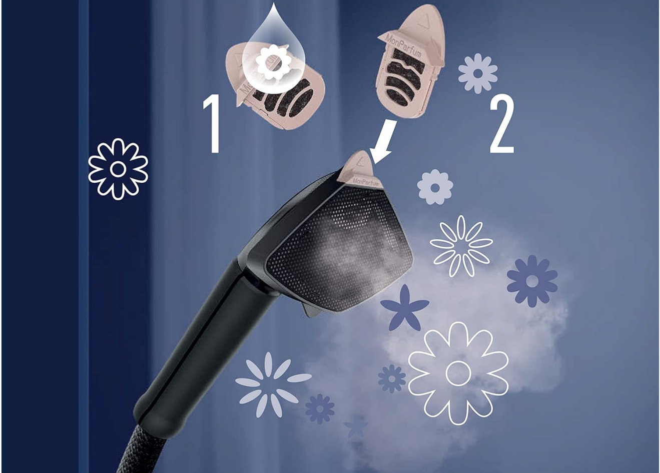
Image 5.2: Illustration of how to use the Mon Parfum attachment to diffuse your favorite fragrance while steaming.