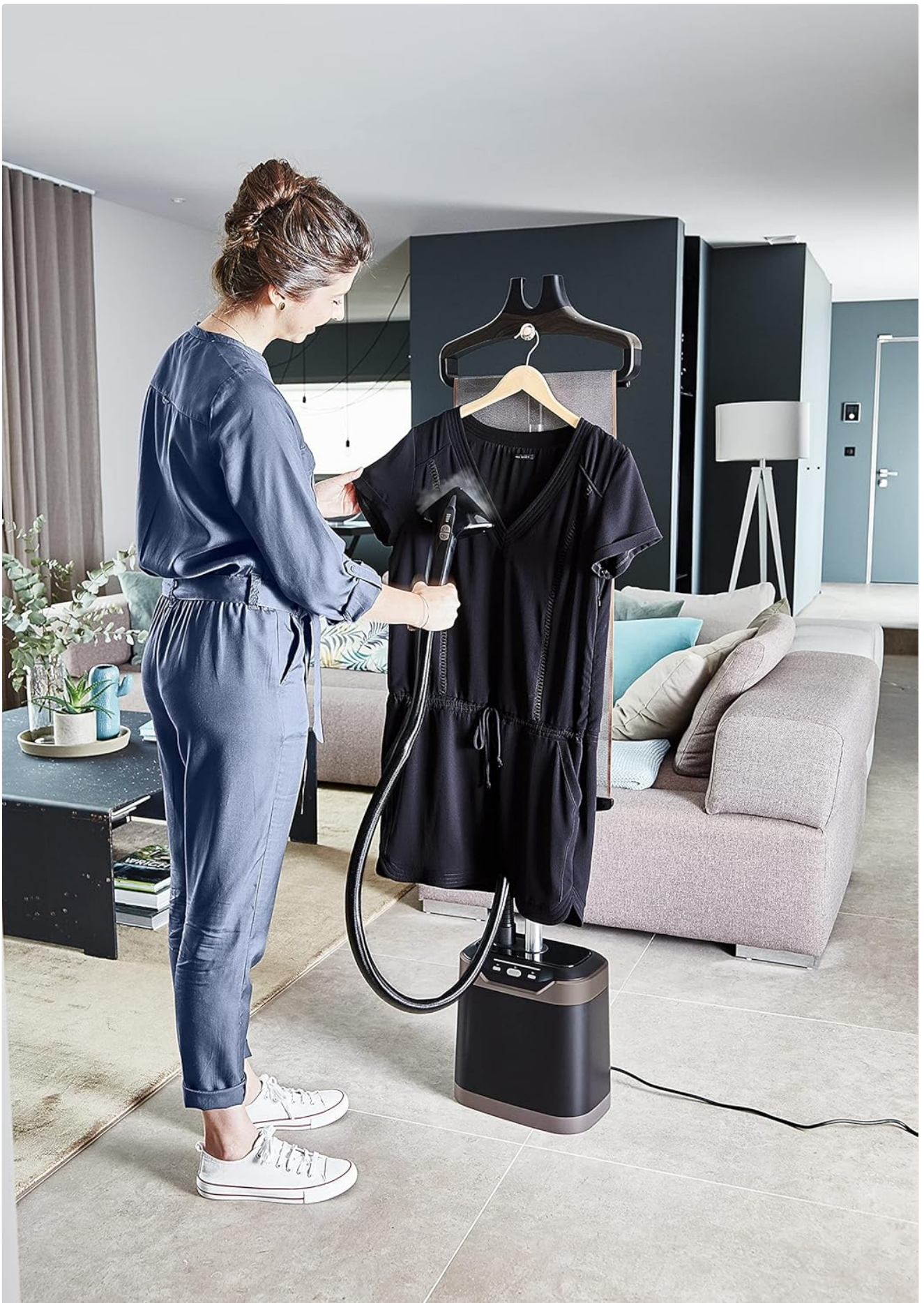
Image 5.1: Demonstrating the steaming process on a shirt, highlighting the 2000W power for effective wrinkle removal.