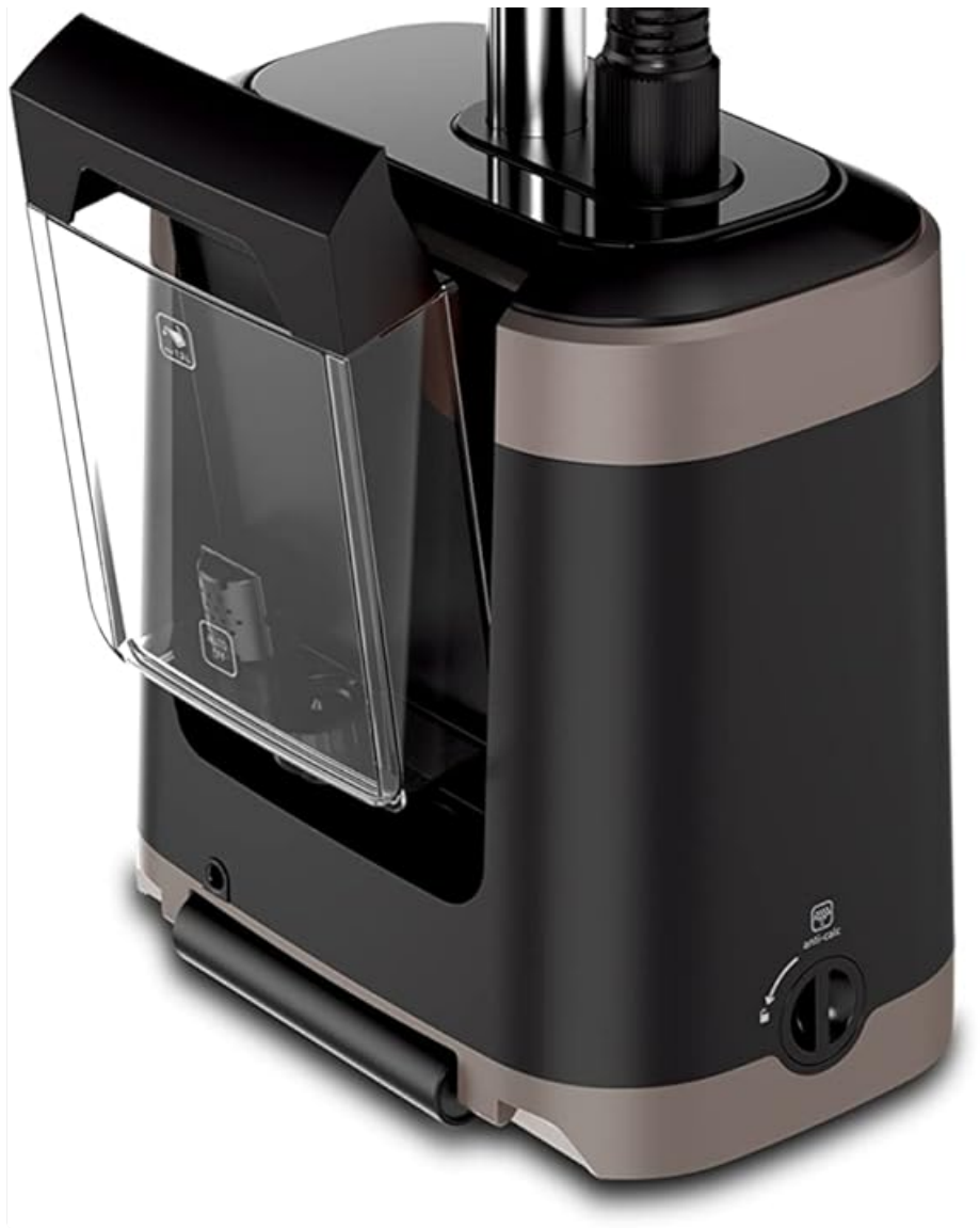
Image 3.1: Overview of the Tefal Pro Style Care Garment Steamer with its main components.