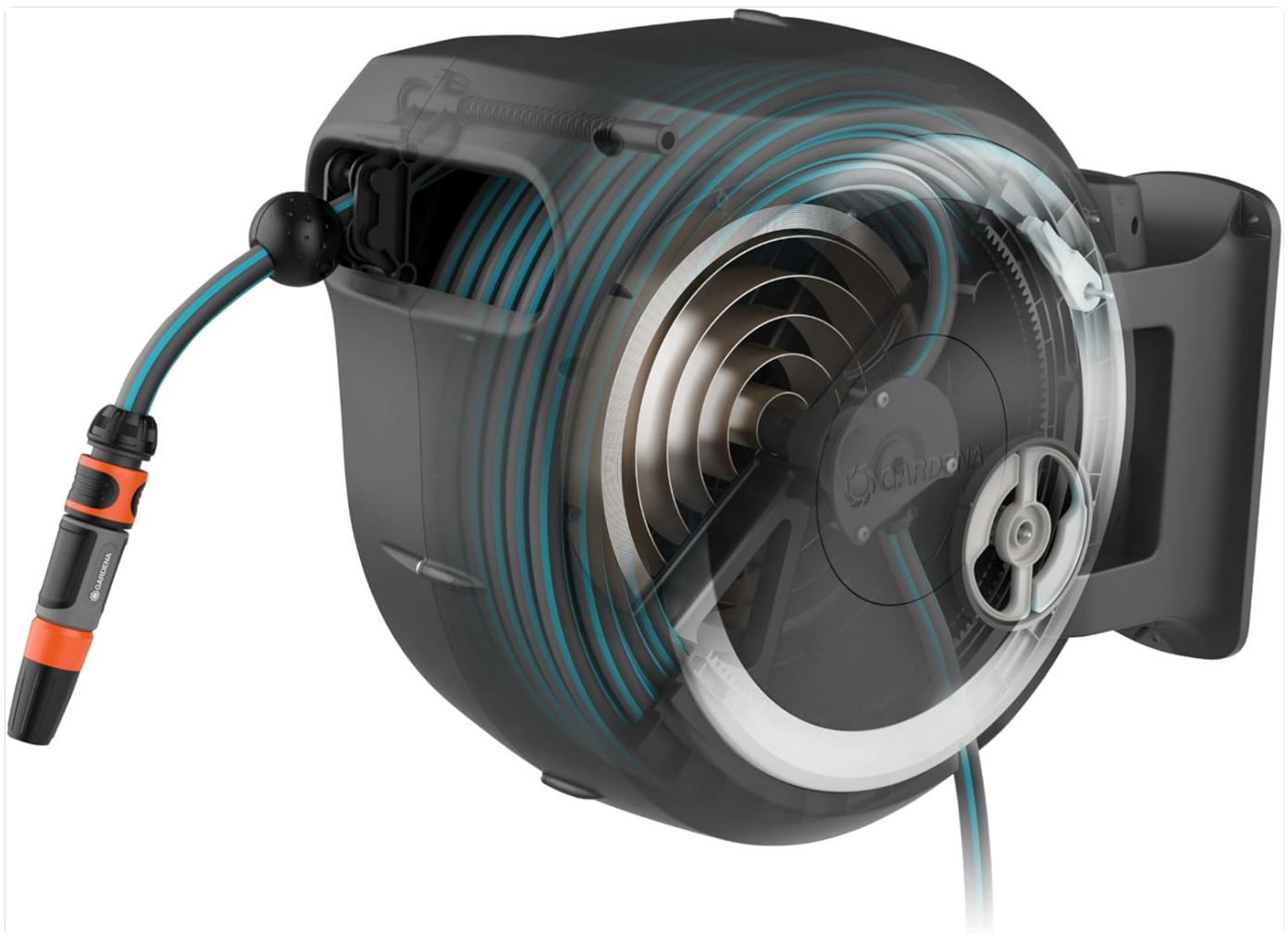
Image 1: Internal view of the hose box, illustrating the coiled hose and the automatic retraction mechanism.