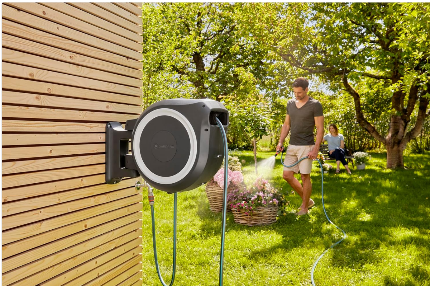
Image 5: A user operating the hose, highlighting the convenience of the wall-mounted system.