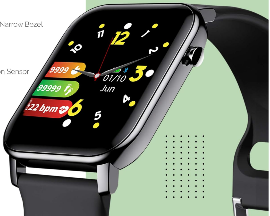
Image: Close-up view of the TAGG Verve Smartwatch display, highlighting its 1.4-inch screen, ultra-narrow bezel, and motion sensor capabilities.