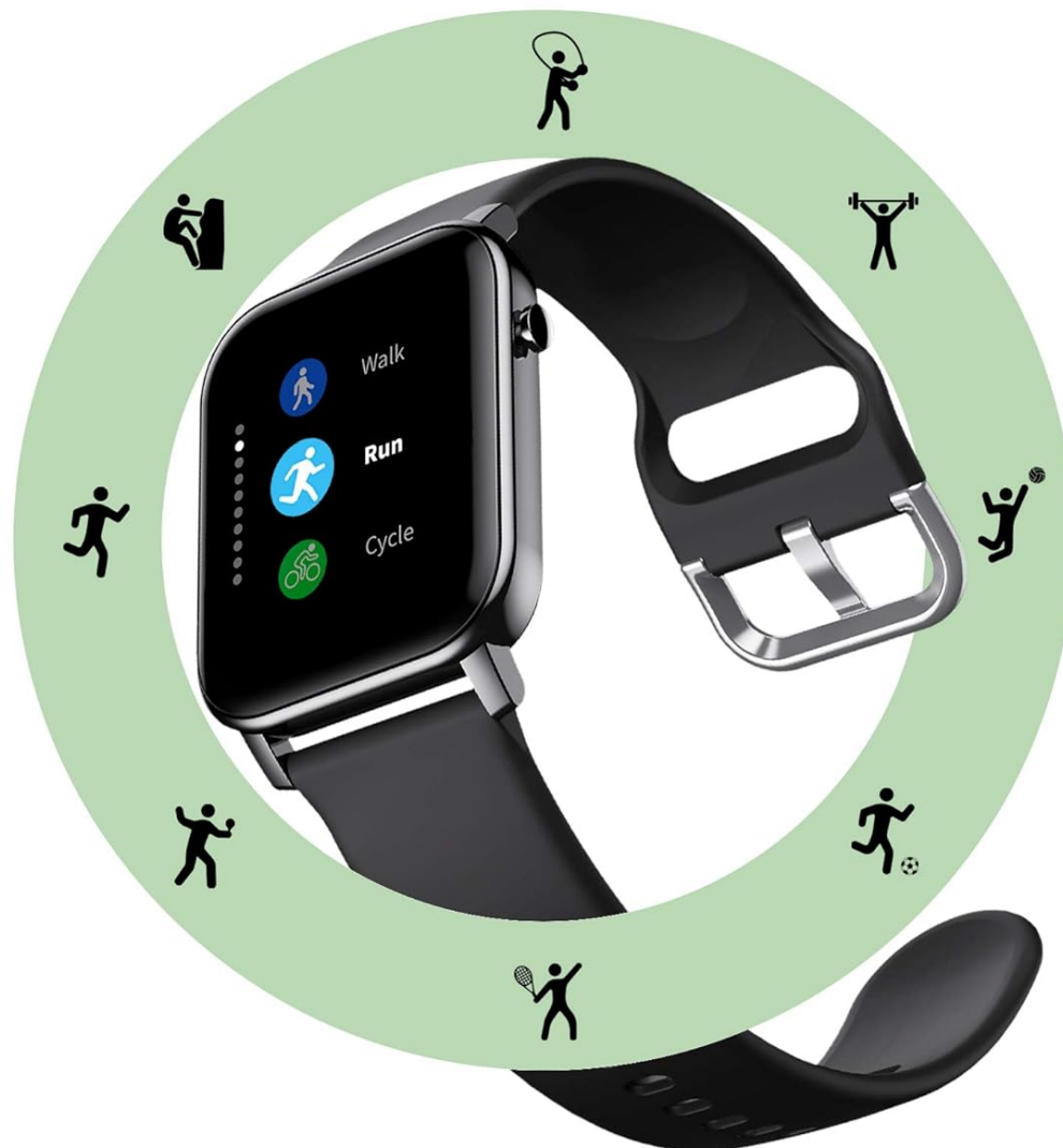
Image: The TAGG Verve Smartwatch screen showing icons for various sport modes, including running, walking, and cycling.