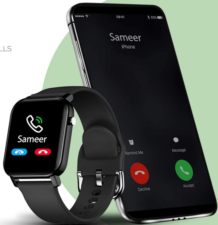
Image: The TAGG Verve Smartwatch displaying an incoming call notification, alongside a smartphone showing various app notification icons.