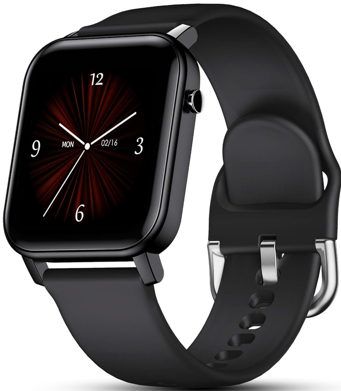
Image: The TAGG Verve Smartwatch in Active Black, showcasing its sleek design and digital display.