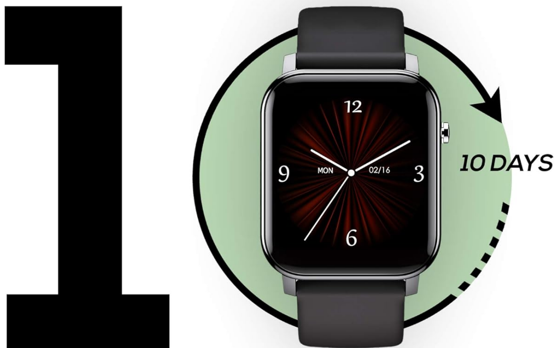
Image: The TAGG Verve Smartwatch screen showing battery life indication, illustrating its long-lasting battery capability.