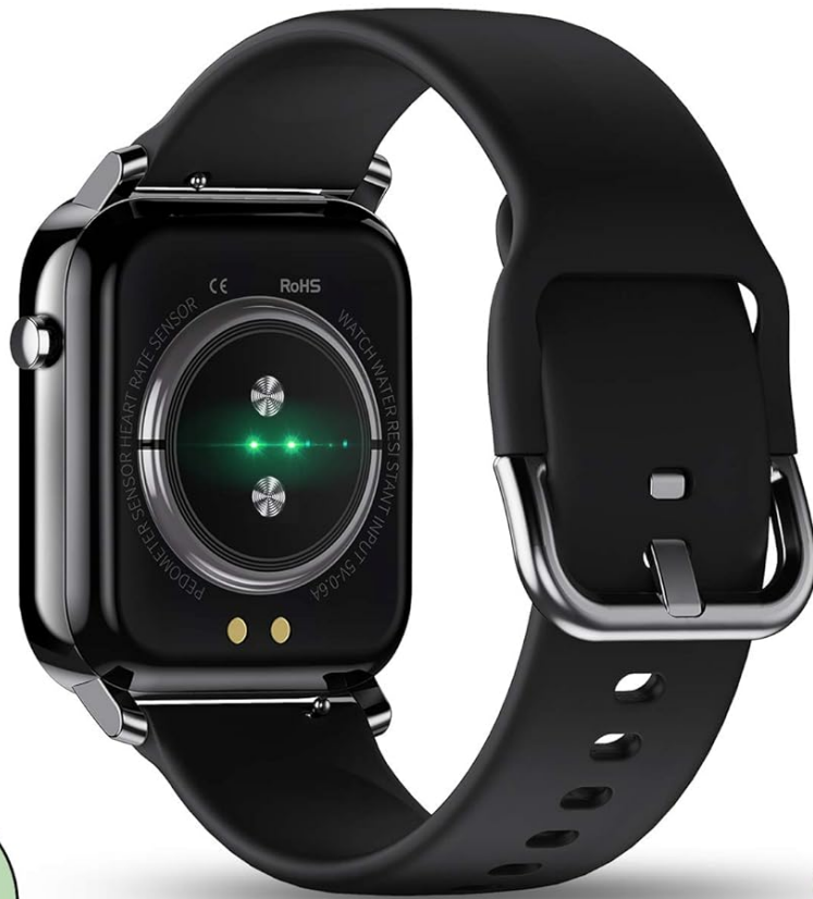
Image: Underside of the TAGG Verve Smartwatch, showing the optical sensors used for heart rate and blood oxygen monitoring.