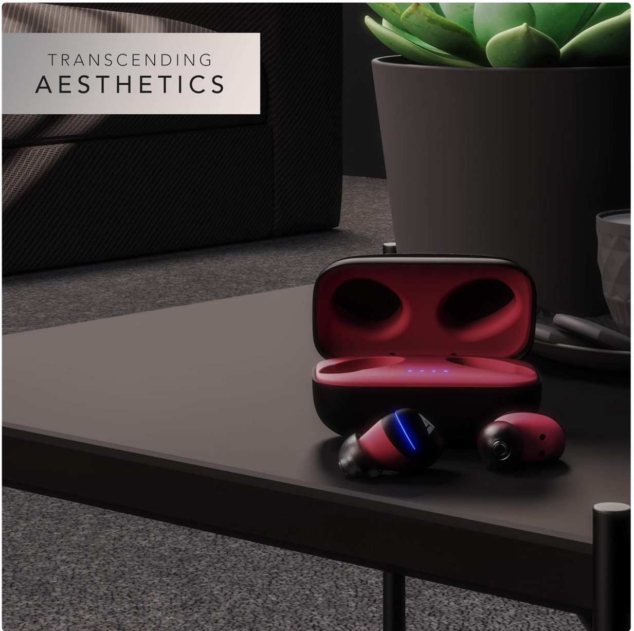
Image: Extra Bass and extended playtime capabilities.