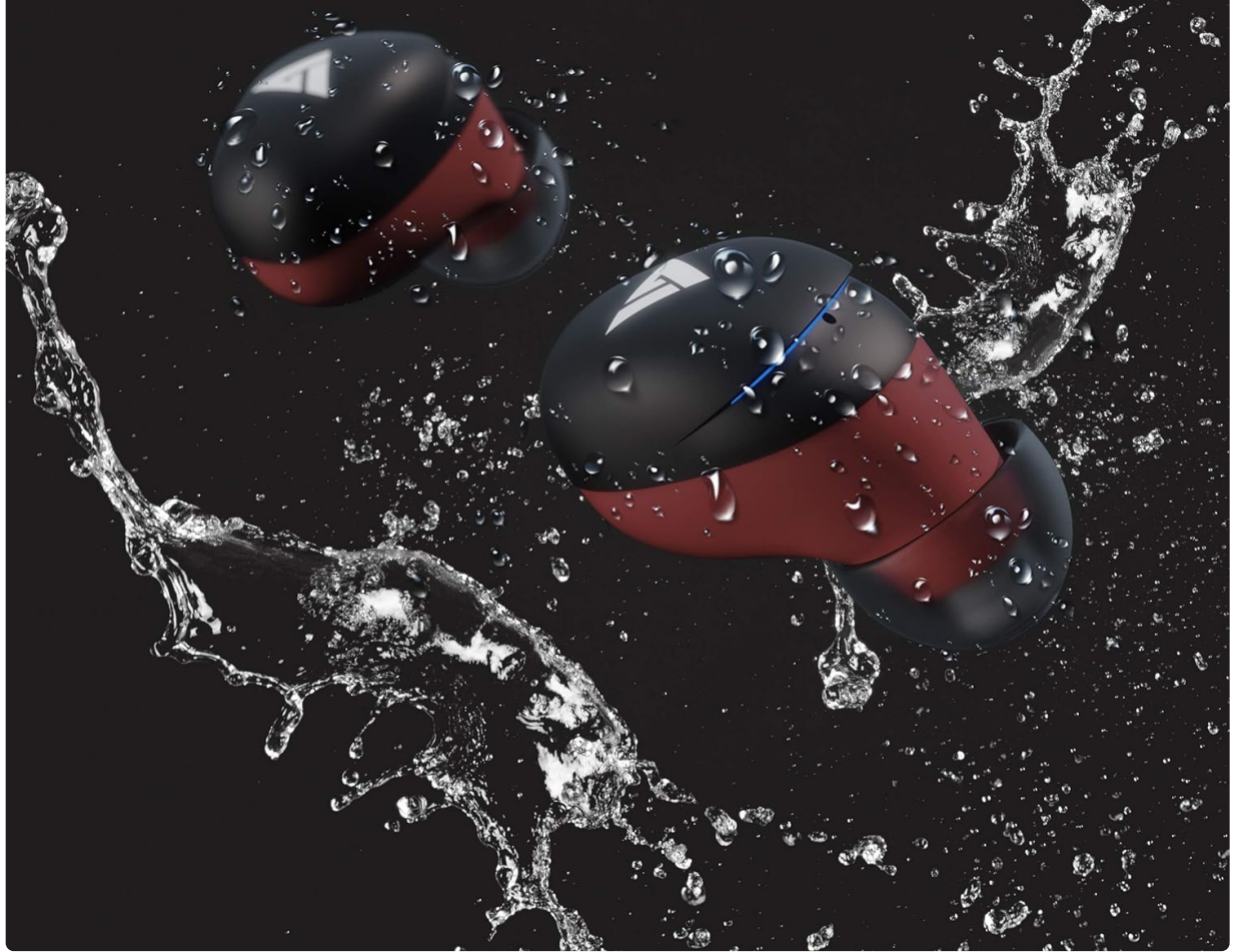
Image: IPX5 Water and Sweat Resistant feature.