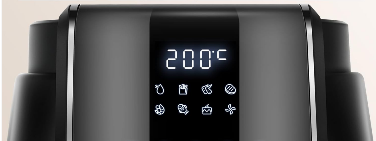
Figure 5.1: The LED touch screen interface showing the 8 pre-programmed cooking options.