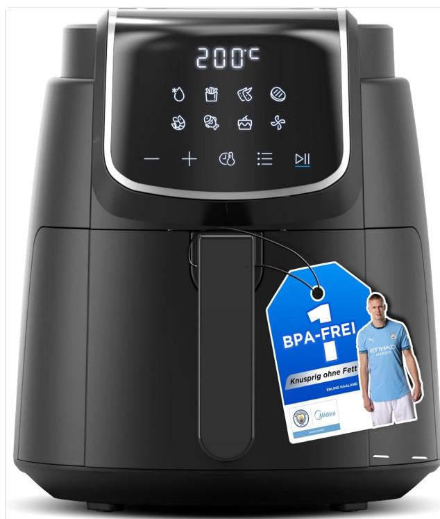
Figure 3.1: Front view of the Midea 4L XL Air Fryer, showcasing its LED display and control panel.

The Midea 4L XL Air Fryer features a sleek design with an intuitive LED touch screen for easy operation. It utilizes Dual-Cyclone Rapid Air Technology for efficient and even cooking.