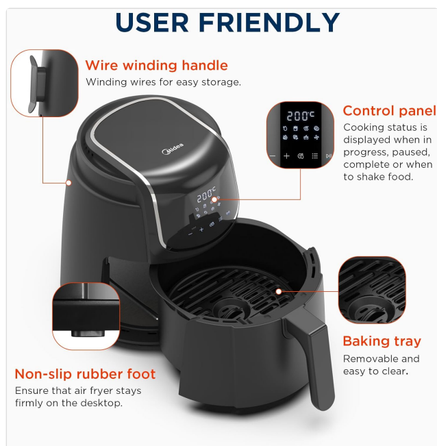
Figure 3.2: Detailed view of the air fryer's components, including the wire winding handle, control panel, non-slip rubber foot, and removable baking tray.