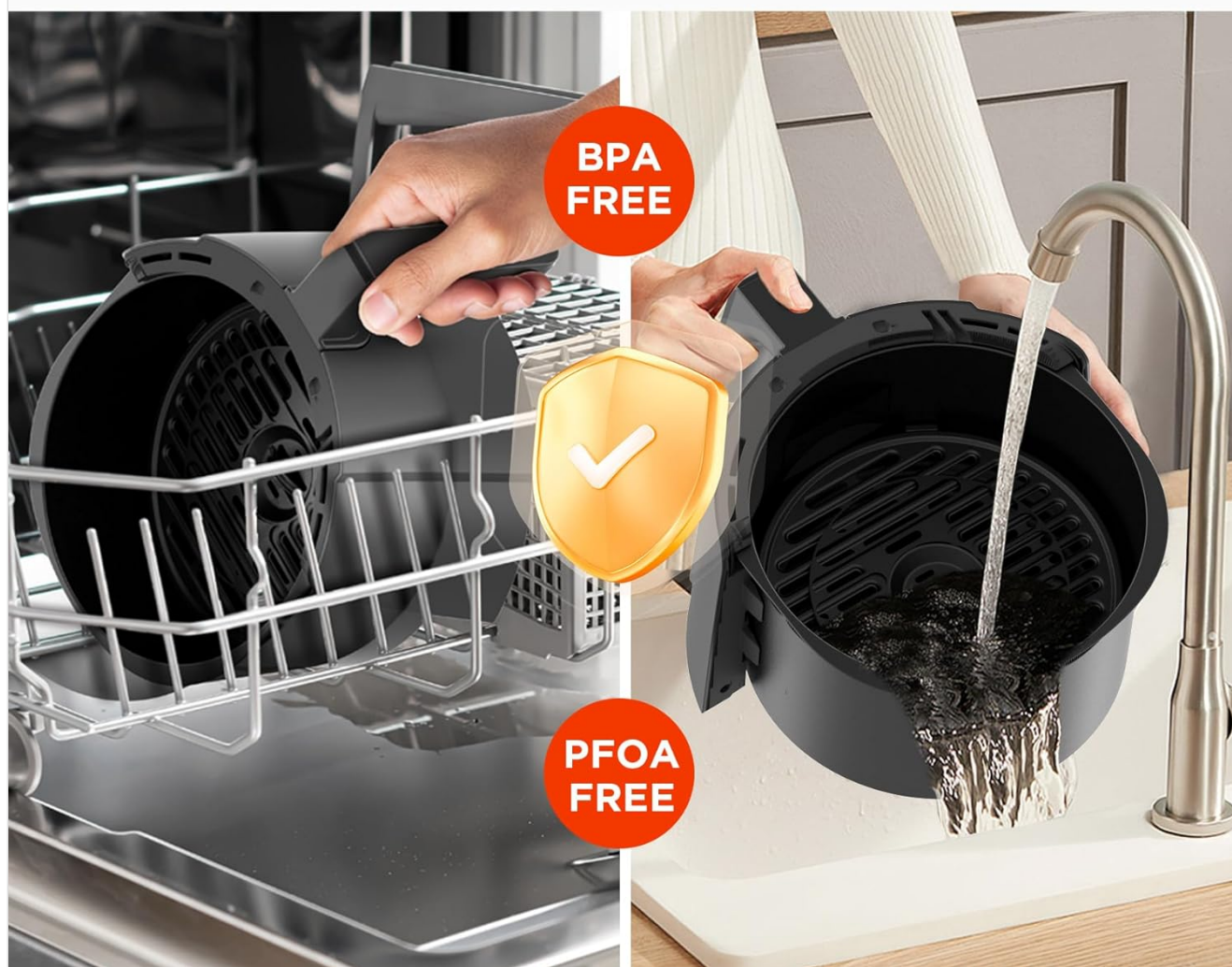
Figure 6.1: The detachable non-stick basket is dishwasher-safe and easy to clean by hand.

Detachable non-stick basket & Dishwasher safe