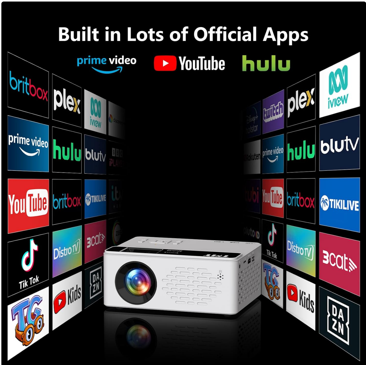
Image: The TMY Mini Movie Projector projecting a screen filled with various app icons, including Prime Video, YouTube, Hulu, Britbox, Plex, and others, onto a wall.

Connect the projector to a WiFi 6 network. Navigate to the 'Apps' section on the home screen to access pre-installed applications like Prime Video and YouTube. Ensure a stable internet connection for smooth streaming.