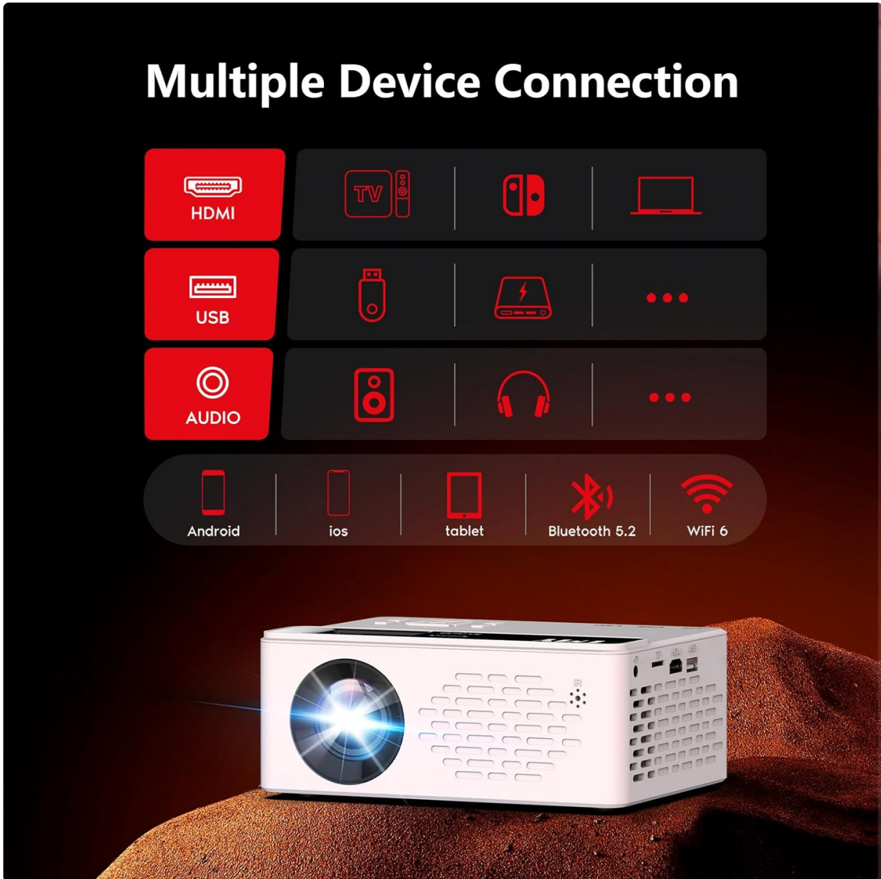
Image: An illustration detailing the multiple device connection options available on the TMY projector, including HDMI, USB, audio jack, and wireless connections like Android, iOS, tablet, Bluetooth 5.2, and WiFi 6.