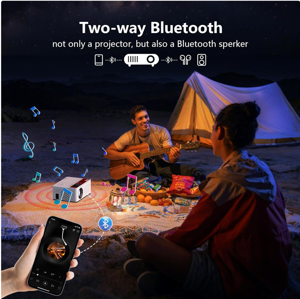
Image: A nighttime outdoor scene with two people sitting on a blanket, one playing a guitar, and the TMY projector acting as a two-way Bluetooth speaker, connected to a smartphone.

The projector has a built-in speaker. For enhanced audio, connect external Bluetooth speakers via the Bluetooth 5.2 feature. Alternatively, the projector can function as a standalone Bluetooth speaker for your phone.