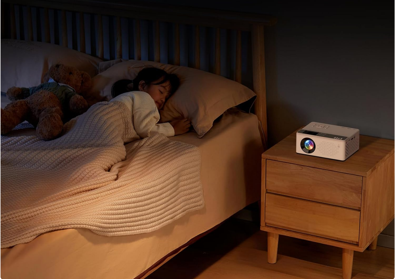
Image: A child sleeping peacefully in bed, with the TMY projector on a nearby nightstand, projecting an image onto the wall, demonstrating the Auto Sleep Function with timer options (1H, 8H, 20H, 24H).