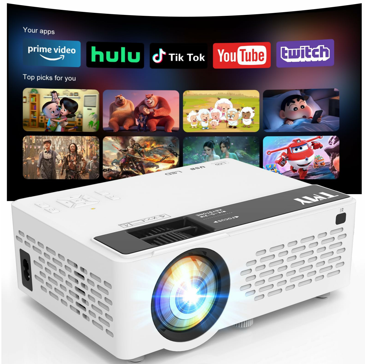
Image: The TMY Mini Movie Projector, its remote control, and power cable laid out on a wooden surface.