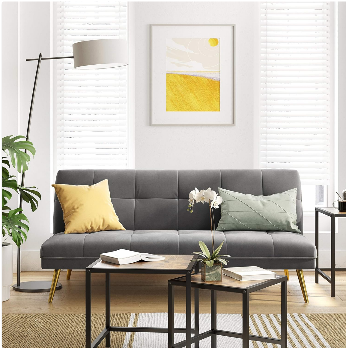
Image: The VASAGLE ULCS602G01 Futon Sofa Bed in its sofa configuration within a modern living space.