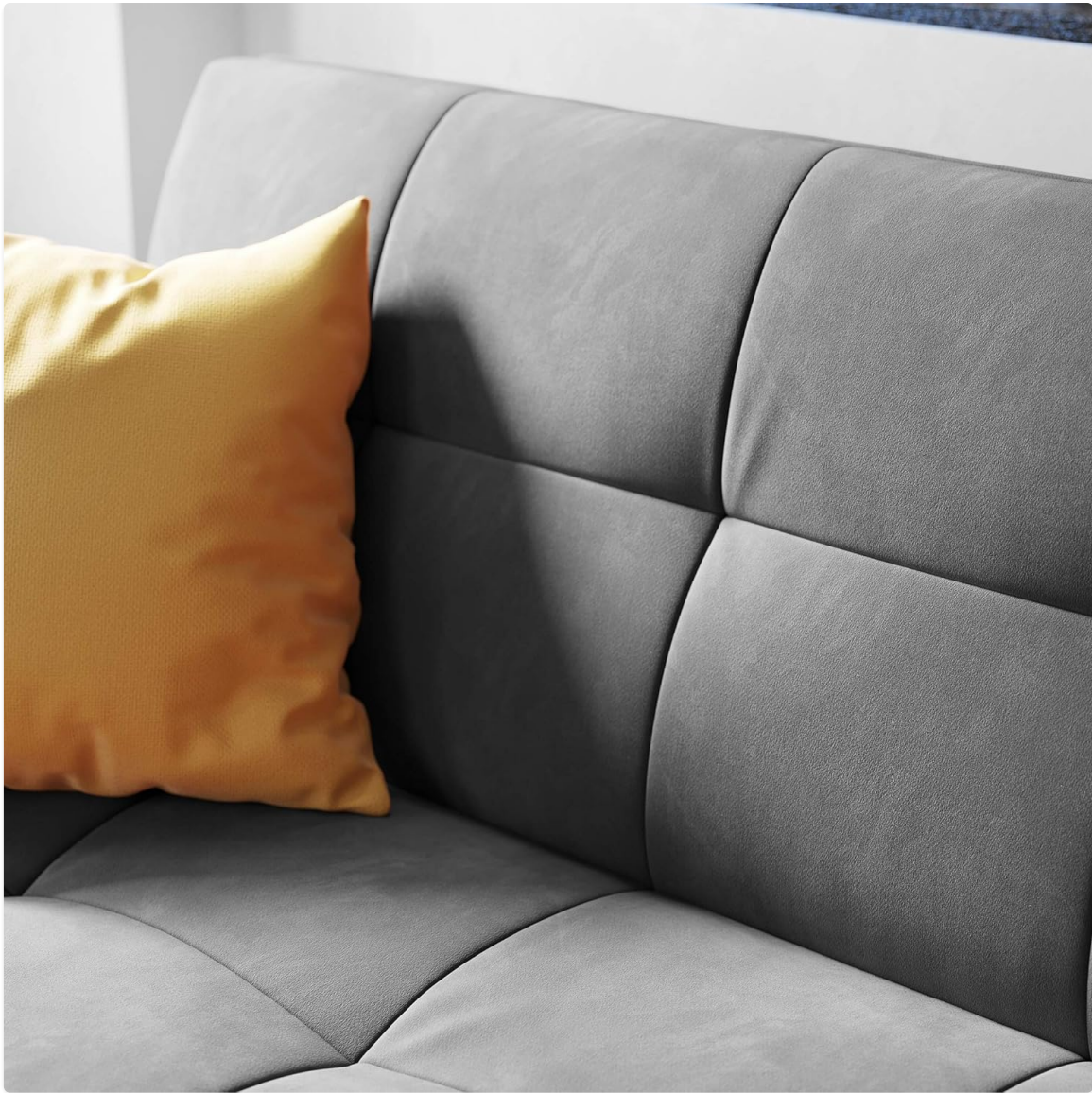
Image: Close-up view of the gray velvet upholstery, highlighting the tufted design and fabric texture.