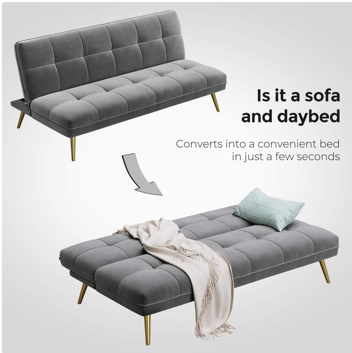
Image: Visual representation of the sofa converting into a flat bed configuration.