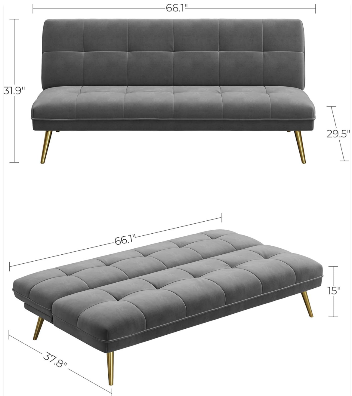
Image: Detailed dimension diagrams for the sofa bed in both upright and flat positions.