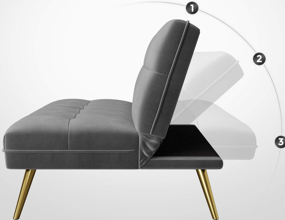
Image: Side view diagram showing the three adjustable angles of the sofa backrest.

The sofa back has three gear positions , which can meet different daily needs