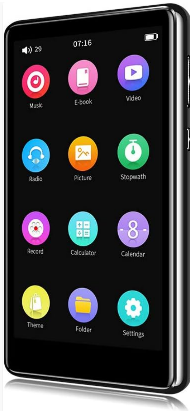
Image: A clear view of the Tengsen M1P MP3 Player's 4.0-inch touch screen, displaying its main menu with icons for Music, E-book, Video, Radio, Picture, Stopwatch, Record, Calculator, Calendar, Theme, Folder, and Settings.