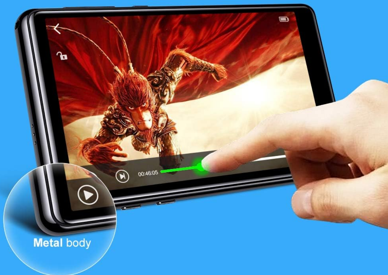
Image: A hand demonstrating interaction with the 4.0-inch full touch screen of the Tengsen M1P MP3 Player, showing a video playing, emphasizing its smartphone-like ease of operation and durable metal body.

Easily operate like using your smartphone. (Metal frame-reliable durable, elegant appearance)