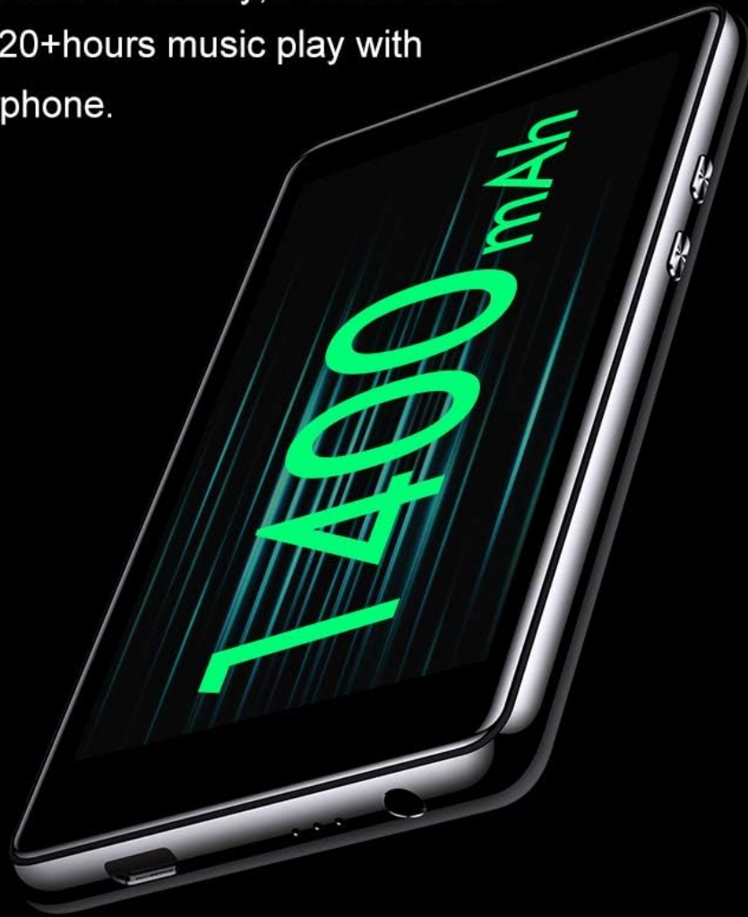
Image: The Tengsen M1P MP3 Player with a visual representation of its 1400mAh battery, indicating extended usage times of 8+ hours for video playback and 20+ hours for music playback with wired earphones.

Built-in 1400mAh battery, 8+hours video play and 20+hours music play with wired earphone.