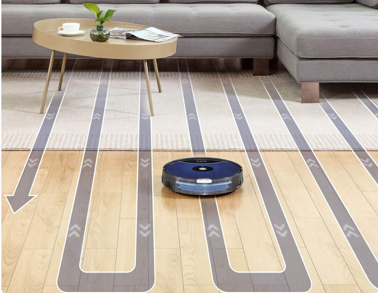
Image: The ILIFE A80 Max robot vacuum cleaning a hard floor in a systematic S-shaped pattern, illustrating its intelligent path mode.