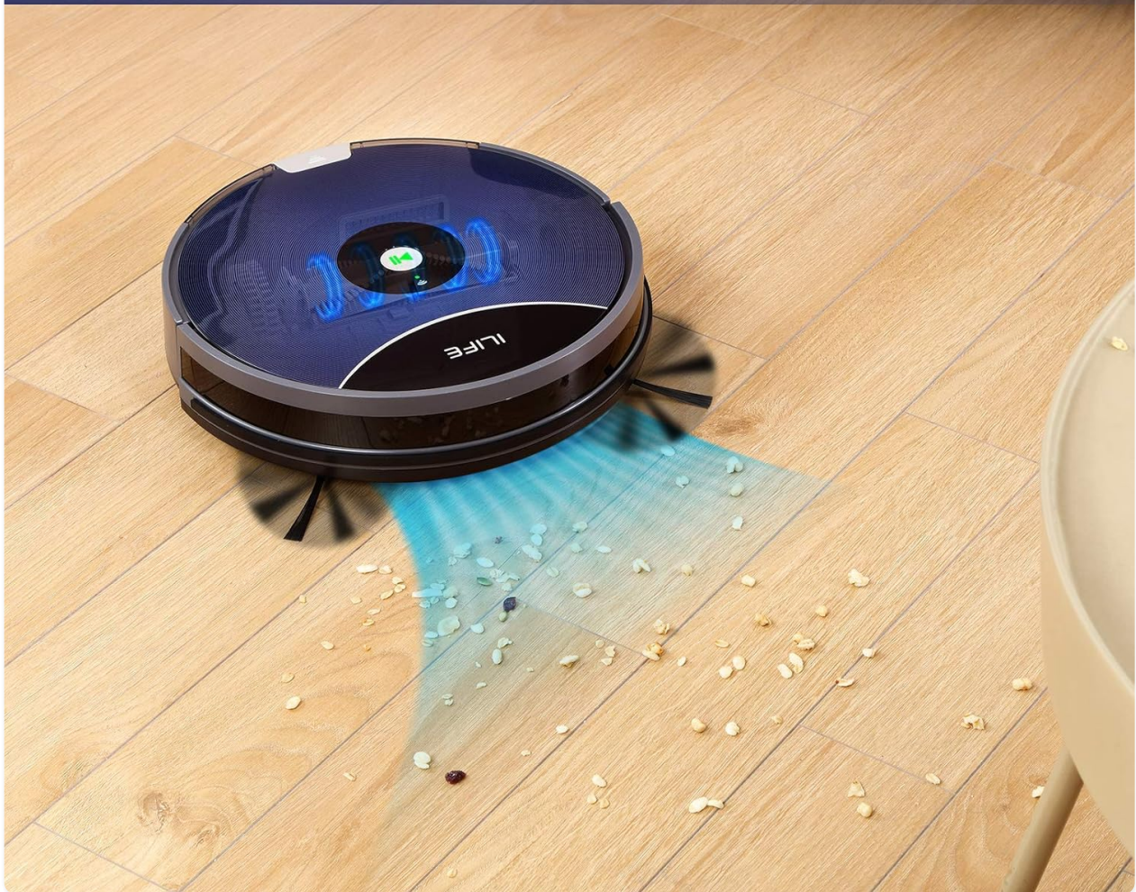
Image: The ILIFE A80 Max robot vacuum actively cleaning a hard floor, showcasing its powerful 2000Pa suction as it collects scattered debris.

Efficiently pick up various trash in sizes of particles.