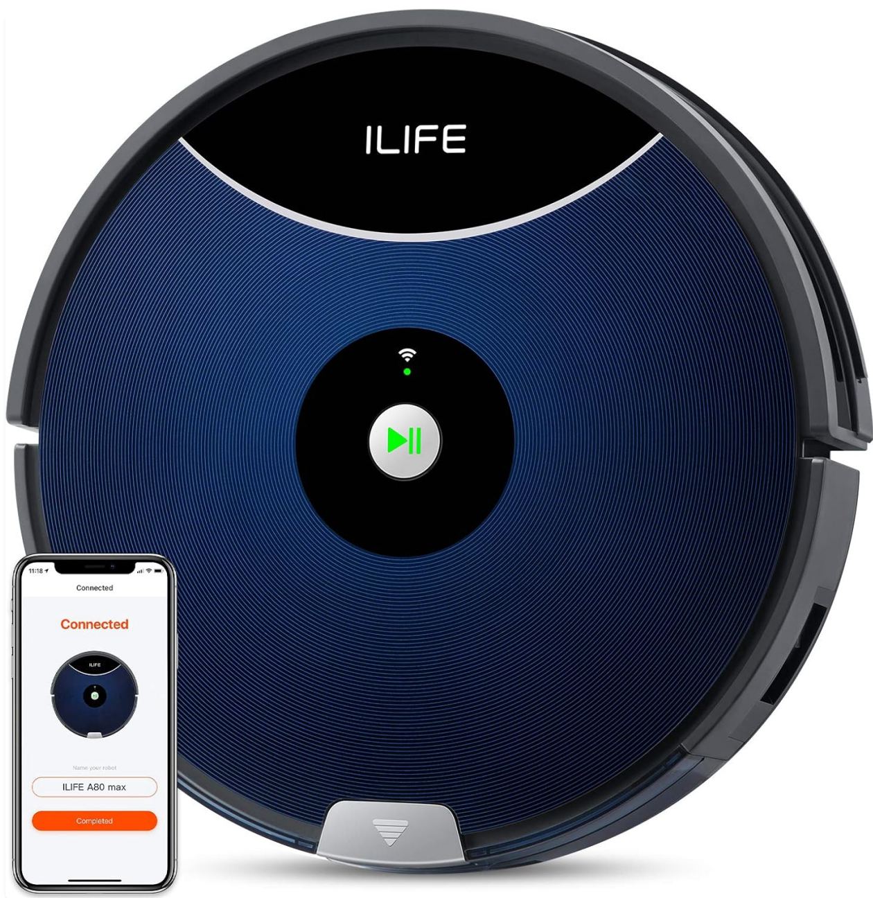
Image: Top view of the ILIFE A80 Max, highlighting the central control button with power and Wi-Fi indicators.