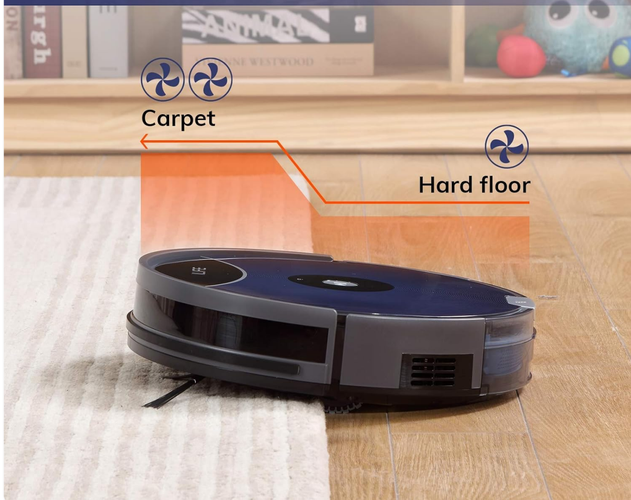
Image: The ILIFE A80 Max robot vacuum moving from a hard floor onto a carpet, with an illustration indicating the automatic increase in suction power.

loose and remove embeded dust with enhanced suction