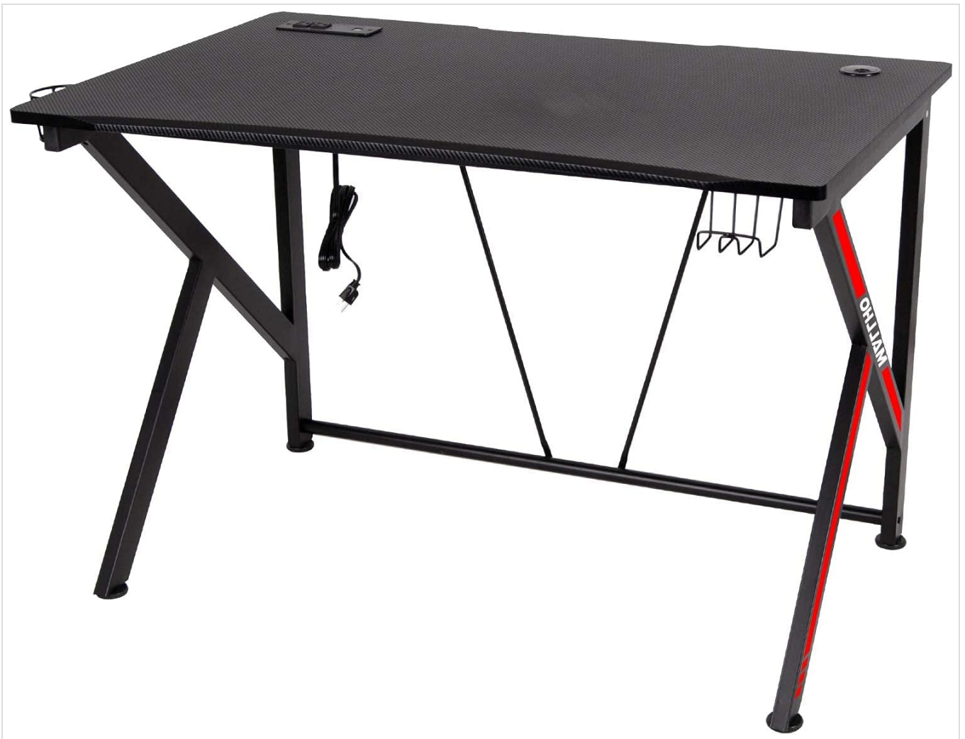
Image: The fully assembled desk frame with the desktop panel secured, ready for accessory installation.