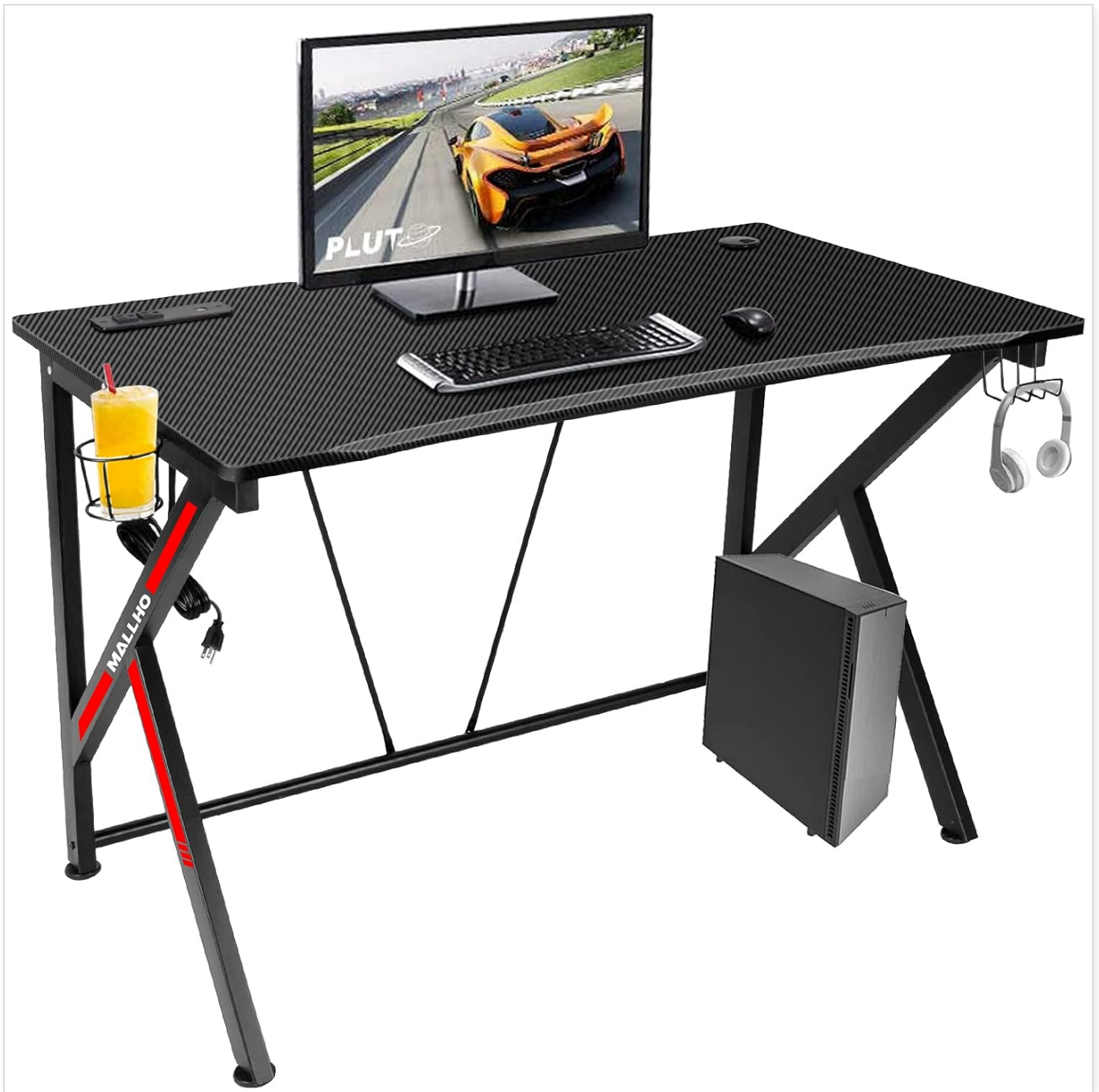
Image: The complete Polar Aurora K-Shaped Gaming Desk setup, featuring a monitor, keyboard, mouse, cup holder, and headphone hook, demonstrating its integrated accessories.