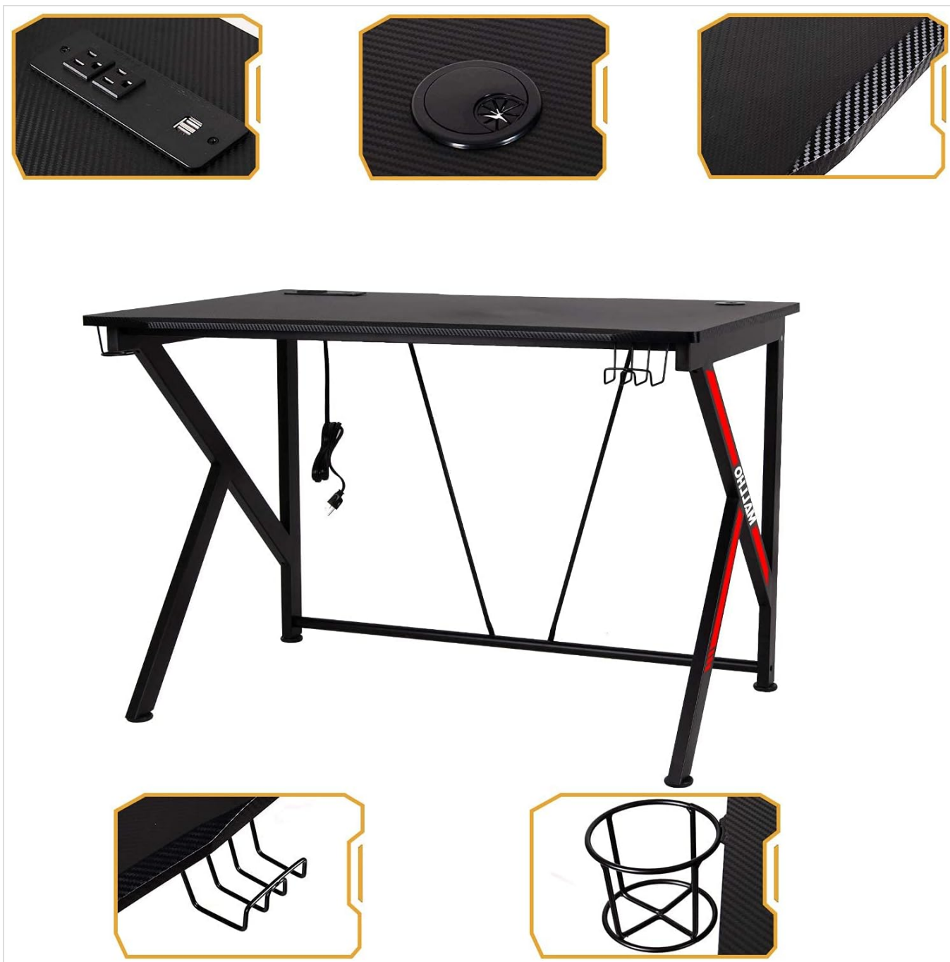
Image: A detailed view of the built-in multi-function socket and cable management hole on the desk surface.