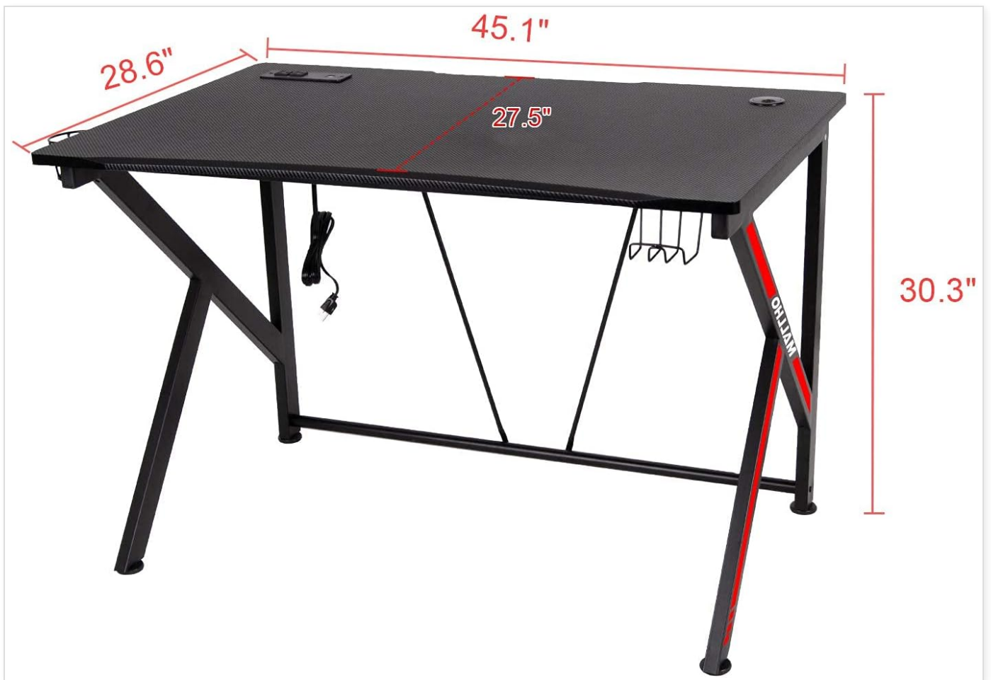
Image: Visual representation of the desk's dimensions: 45.1 inches width, 28.6 inches depth, and 30.3 inches height.