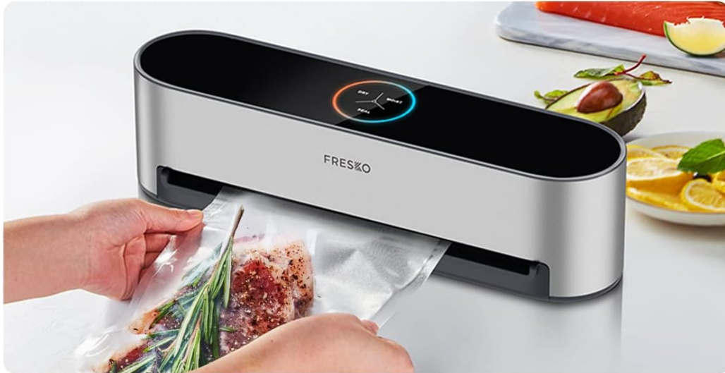
Insert the bag