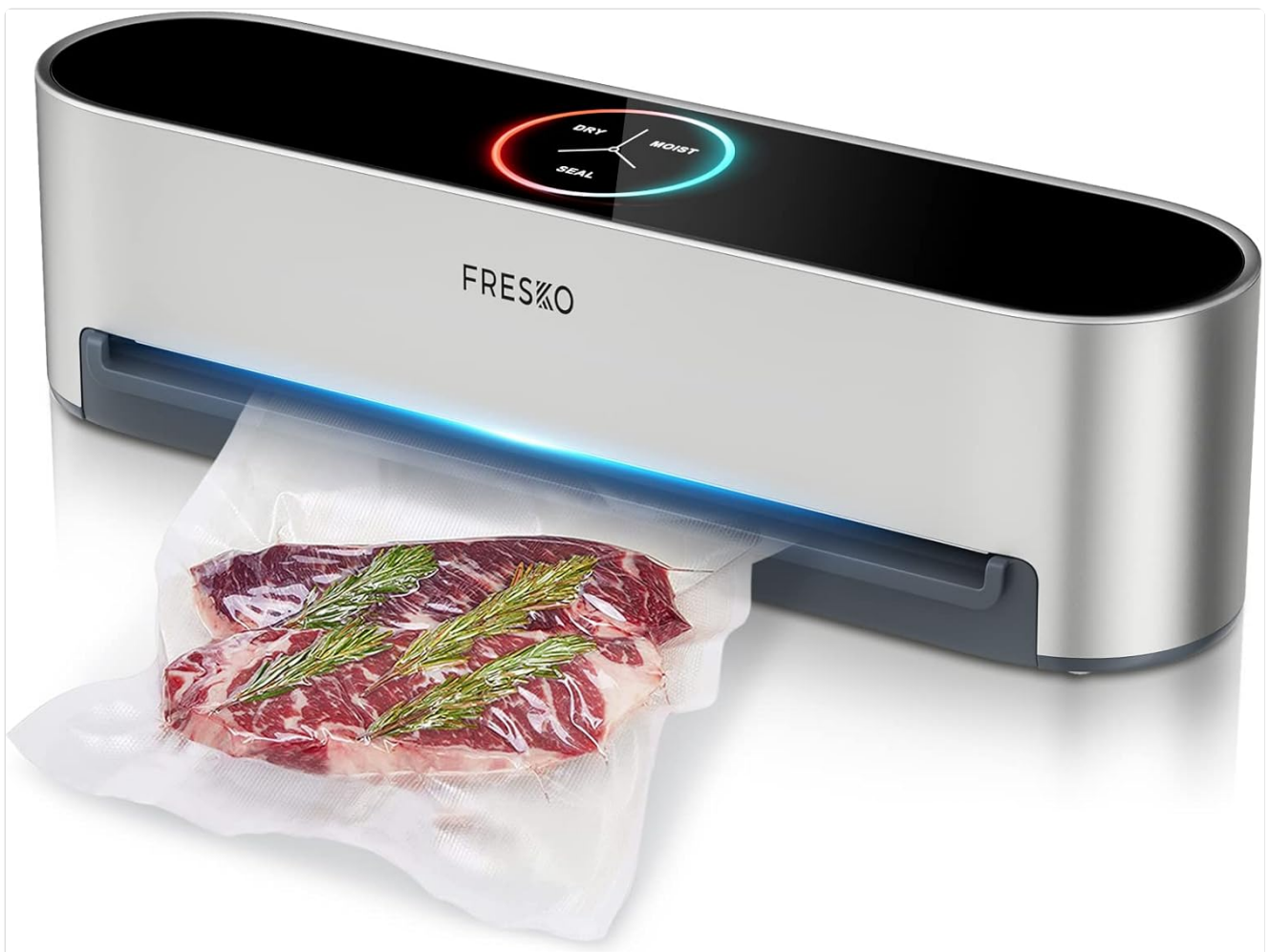
Figure 1: FRESKO V8 Automatic Vacuum Sealer with two cuts of meat sealed in a bag.

The FRESKO V8 Hands-Free Full Automatic Vacuum Sealer Machine is designed to preserve food freshness up to 8 times longer than conventional storage methods. This appliance utilizes a secure, airtight heat seal to prevent spoilage and freezer burn, making it ideal for meal preparation, storing leftovers, and preserving produce. Its intuitive LED touch screen and multi-mode functionality ensure ease of use for various food types.