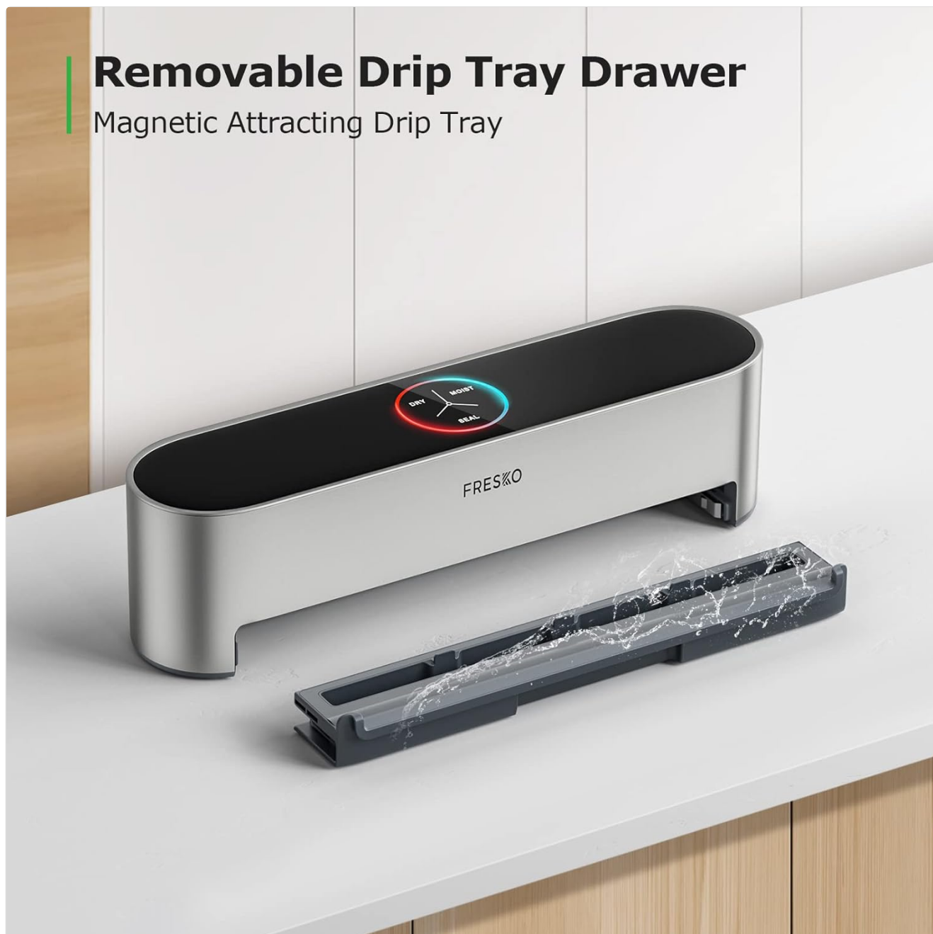
Figure 6: The removable drip tray of the FRESKO V8, shown detached from the main unit for easy cleaning.