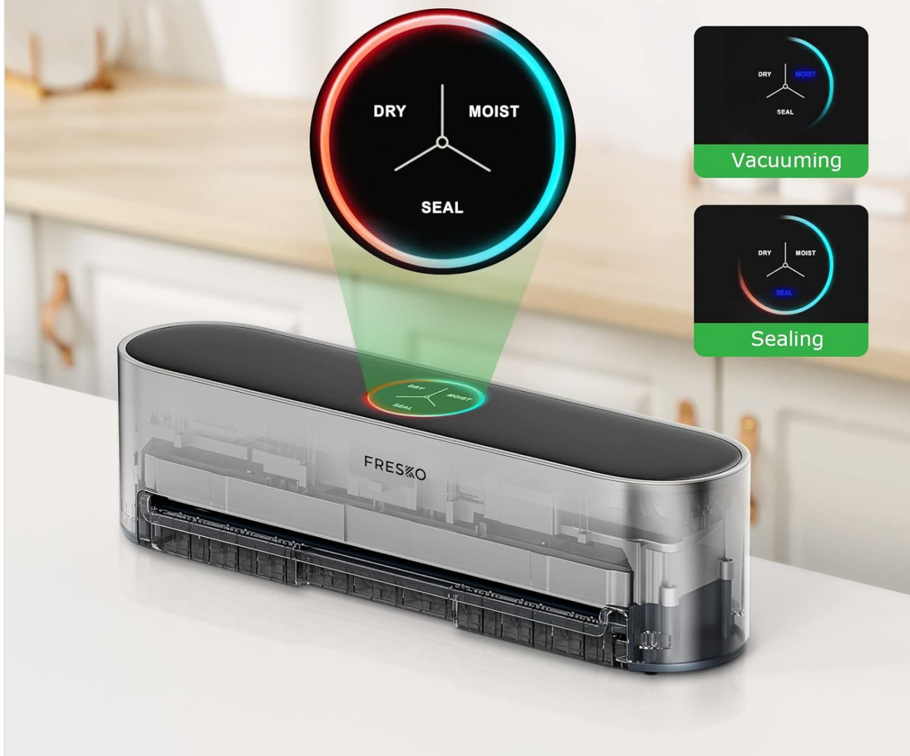
Figure 4: Close-up of the FRESKO V8's LED touch control panel, highlighting the Dry, Moist, and Seal modes with a visual progress bar.