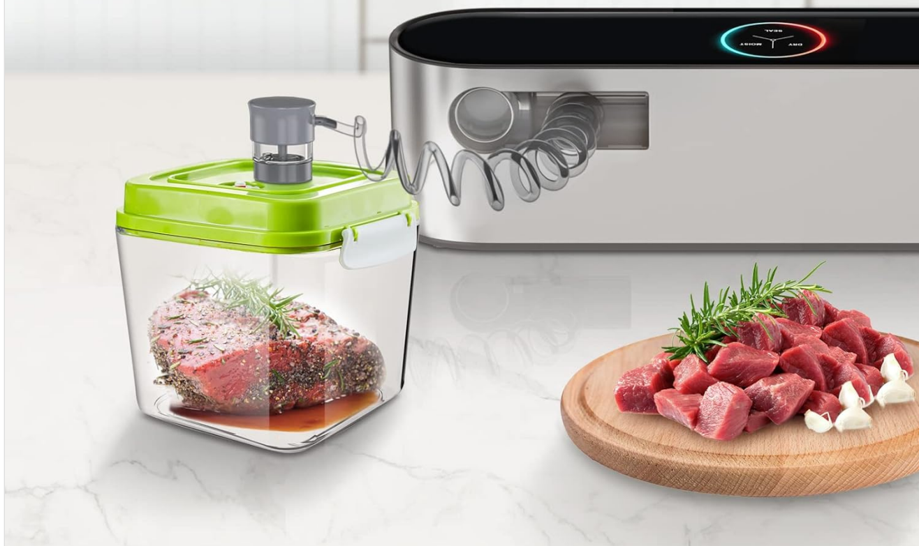
Figure 5: The FRESKO V8 demonstrating its retractable handheld sealer, connected to a container for quick marinating.