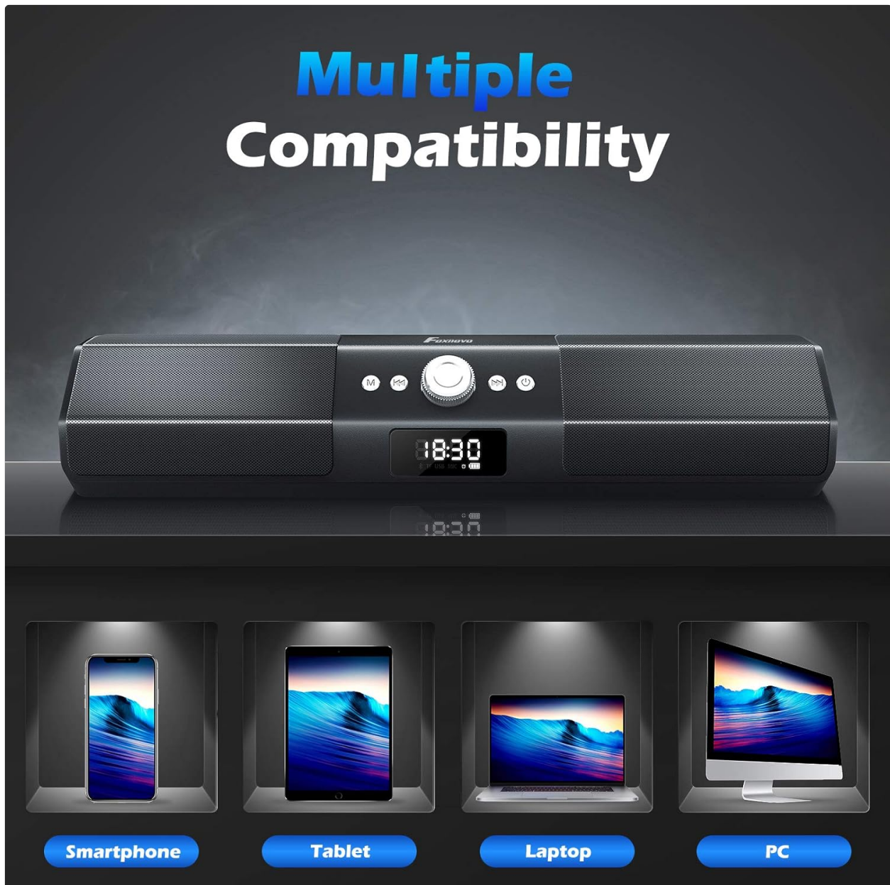
Diagram illustrating the Foxnovo MX-1 speaker's compatibility with various devices, including smartphones, tablets, laptops, and PCs, via wired or wireless connections.