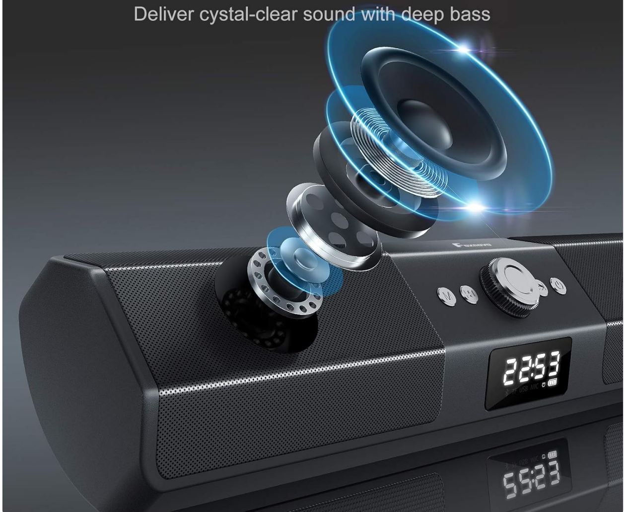
Internal view of the Foxnovo MX-1 speaker, illustrating the dual full-range drivers responsible for audio output.

Deliver crystal-clear sound with deep bass