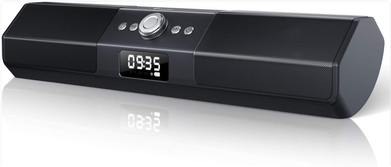
Front view of the Foxnovo MX-1 speaker, displaying the central control knob, function buttons, and digital display.