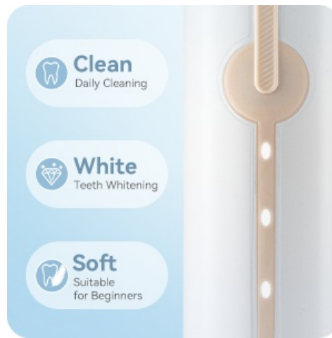
Image: Cleaning Modes. This graphic illustrates the three distinct cleaning modes available on the usmile P1 toothbrush: 'Clean' for daily use, 'White' for teeth whitening, and 'Soft' suitable for beginners or sensitive gums.