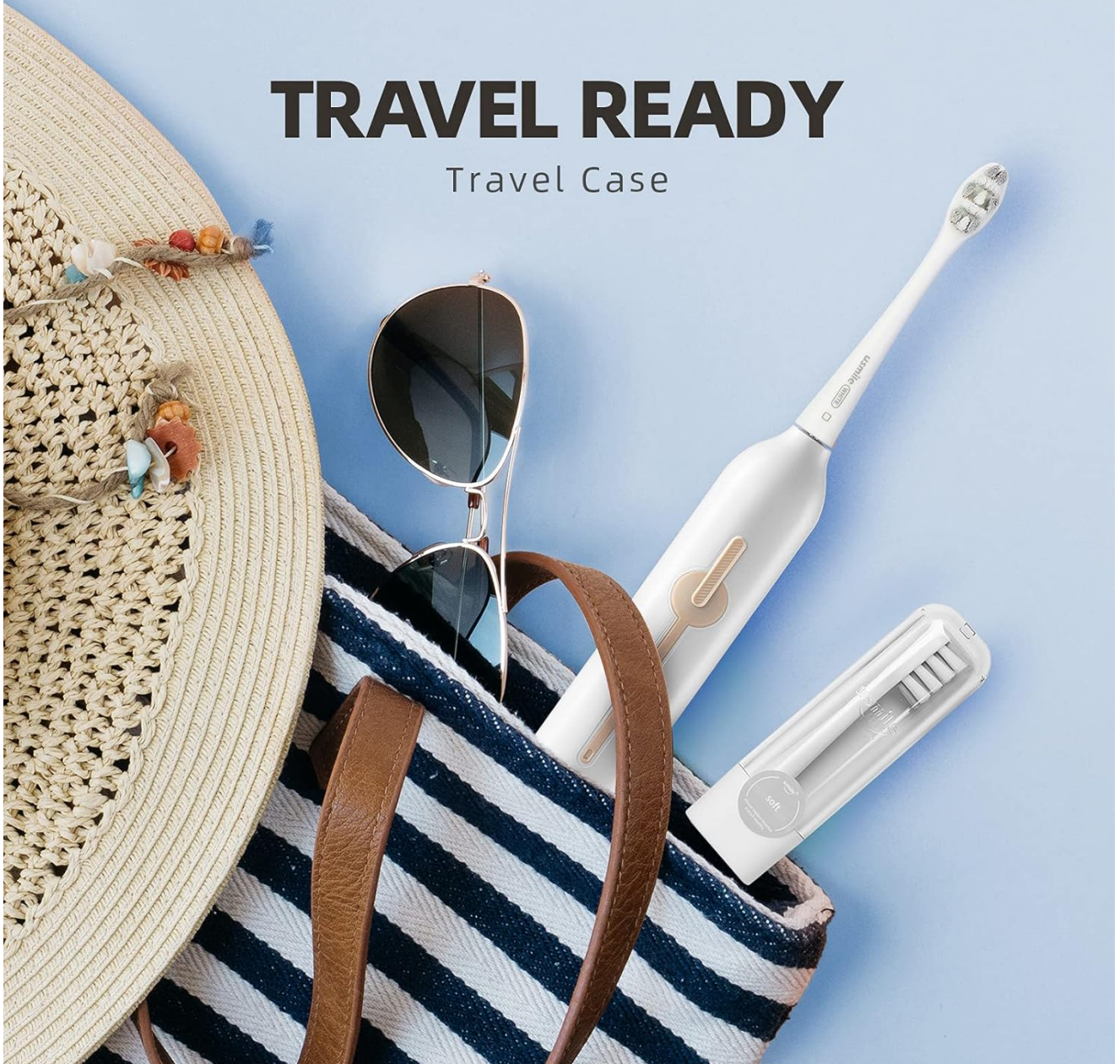
Image: Travel Ready Design. This image features the usmile P1 electric toothbrush and its travel case alongside travel accessories like a hat and sunglasses, emphasizing its portability and convenience for travel.