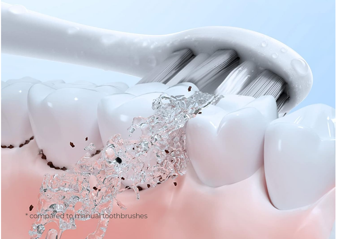
Image: Sonic Whitening Cleaning. This close-up image demonstrates the sonic cleaning action of the usmile P1 toothbrush, with water particles indicating high-frequency vibrations effectively cleaning a tooth surface.