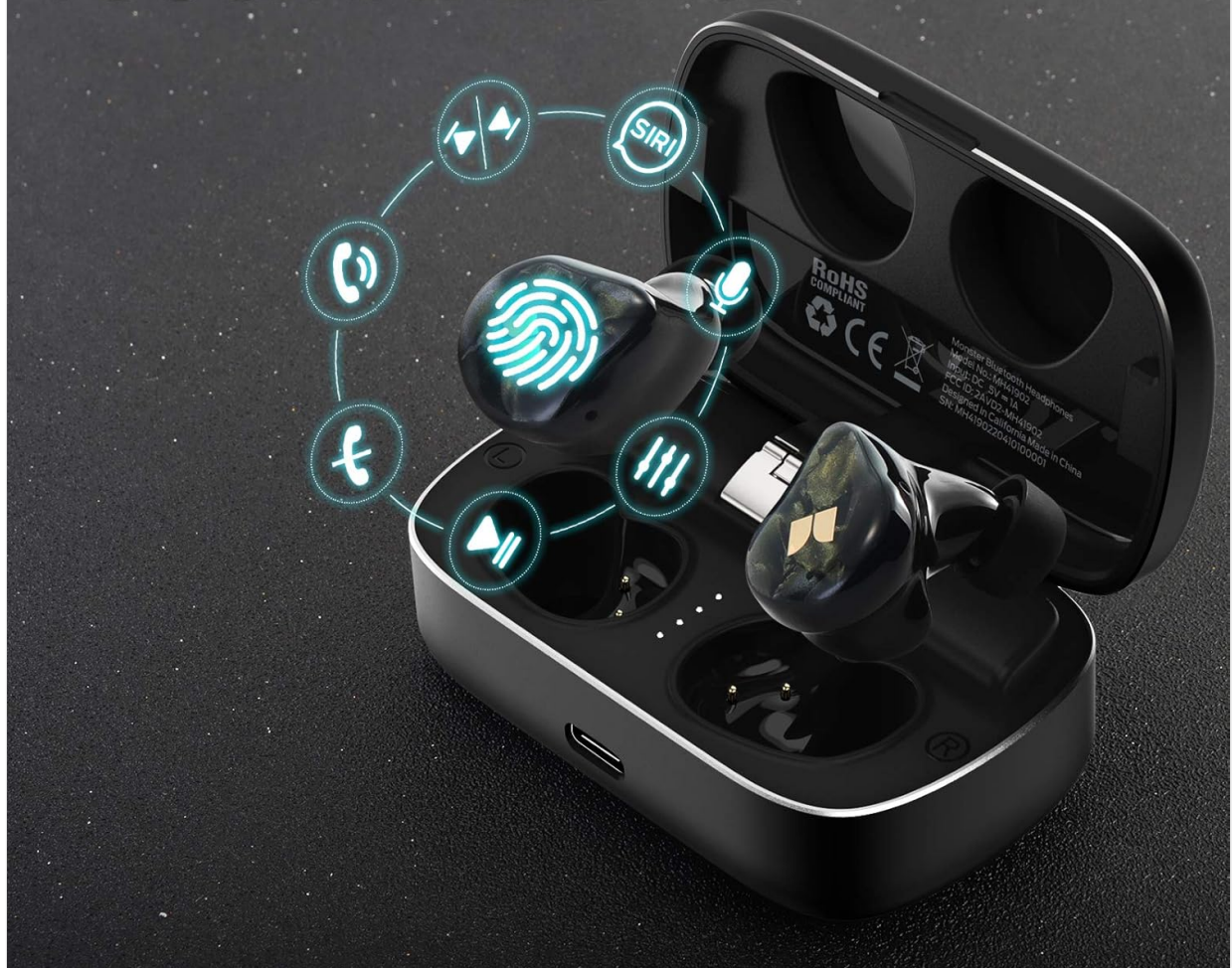
Image: A visual representation of the multi-function touch interface on the Monster Clarity 700dB AirLinks Wireless Earbuds, detailing the various touch gestures for controlling music playback, calls, and activating voice assistants.