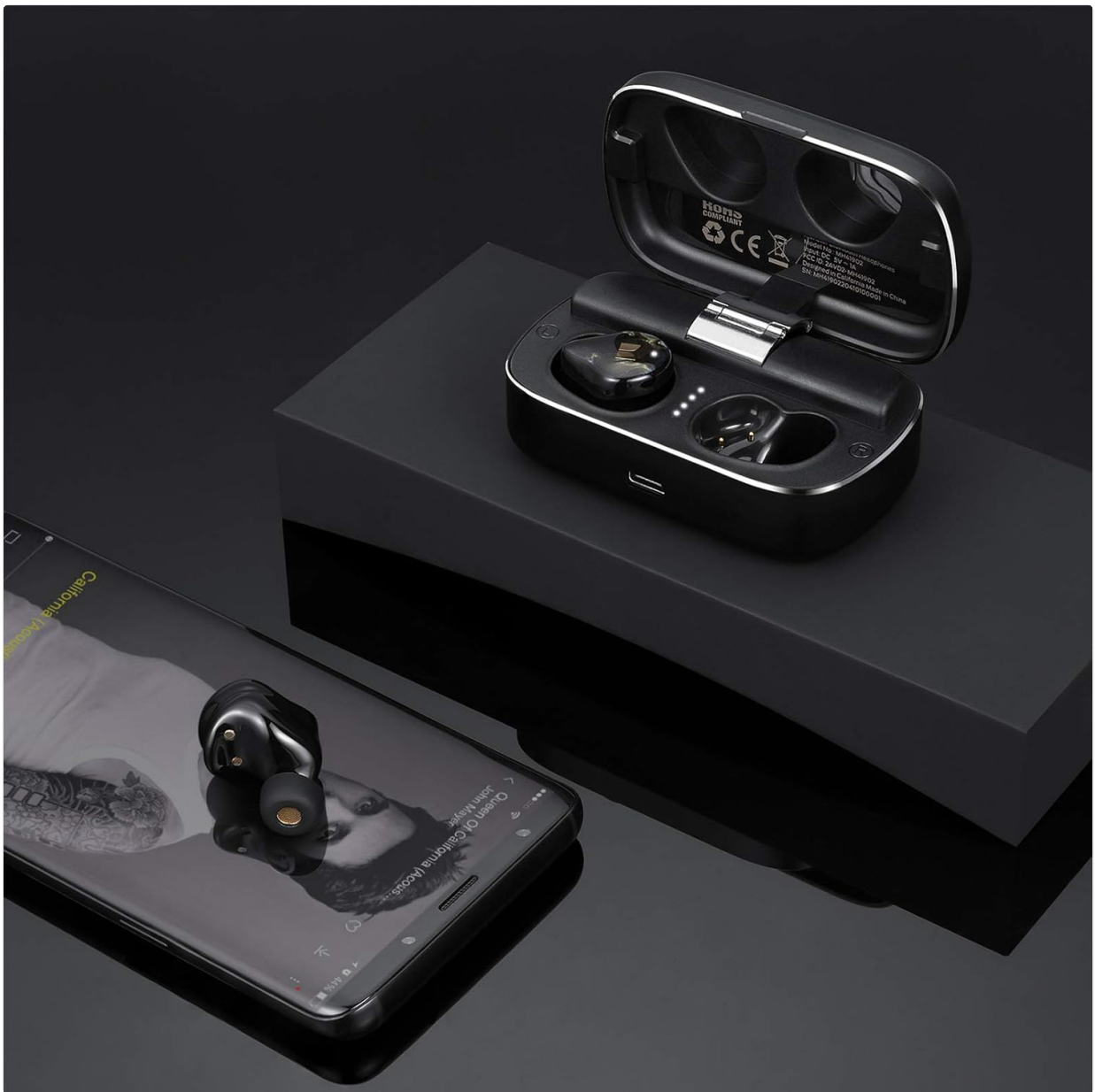
Image: Monster Clarity 700dB AirLinks Wireless Earbuds shown with their charging case and a smartphone, demonstrating the earbuds' readiness for use after pairing with a device for audio playback.