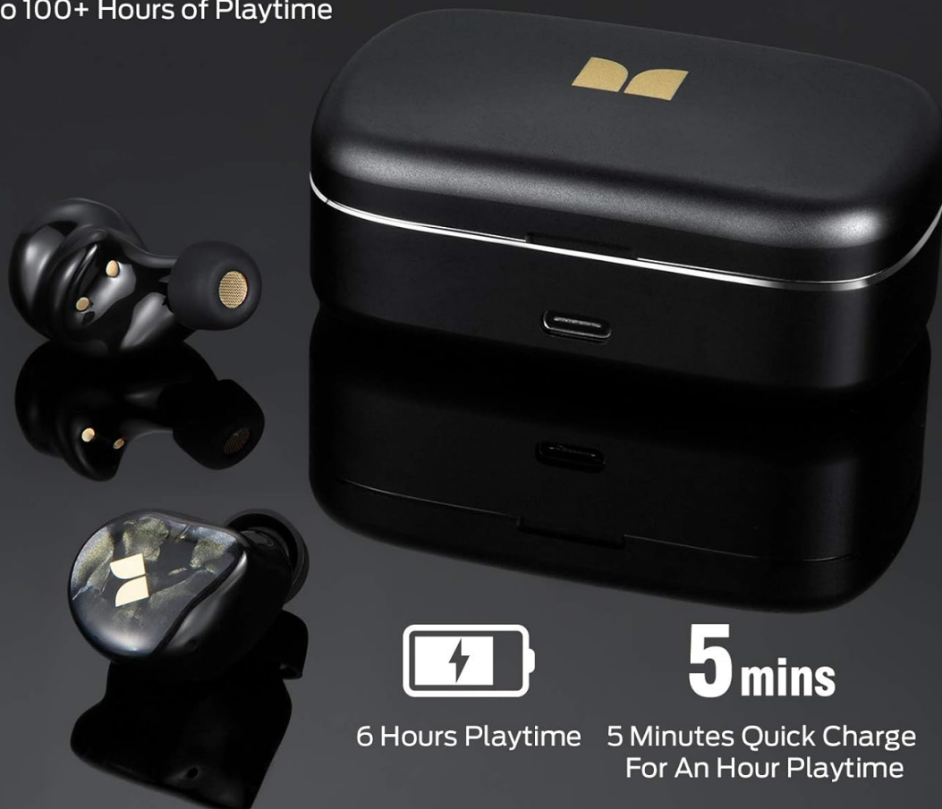
Image: High-capacity charging case for Monster Clarity 700dB AirLinks Wireless Earbuds, illustrating its ability to fully charge the earphones multiple times and extend playtime to over 100 hours. It also highlights a 5-minute quick charge feature for an hour of playtime.

Fully Charge The Earphones 20 Times, Extend To 100+ Hours of Playtime