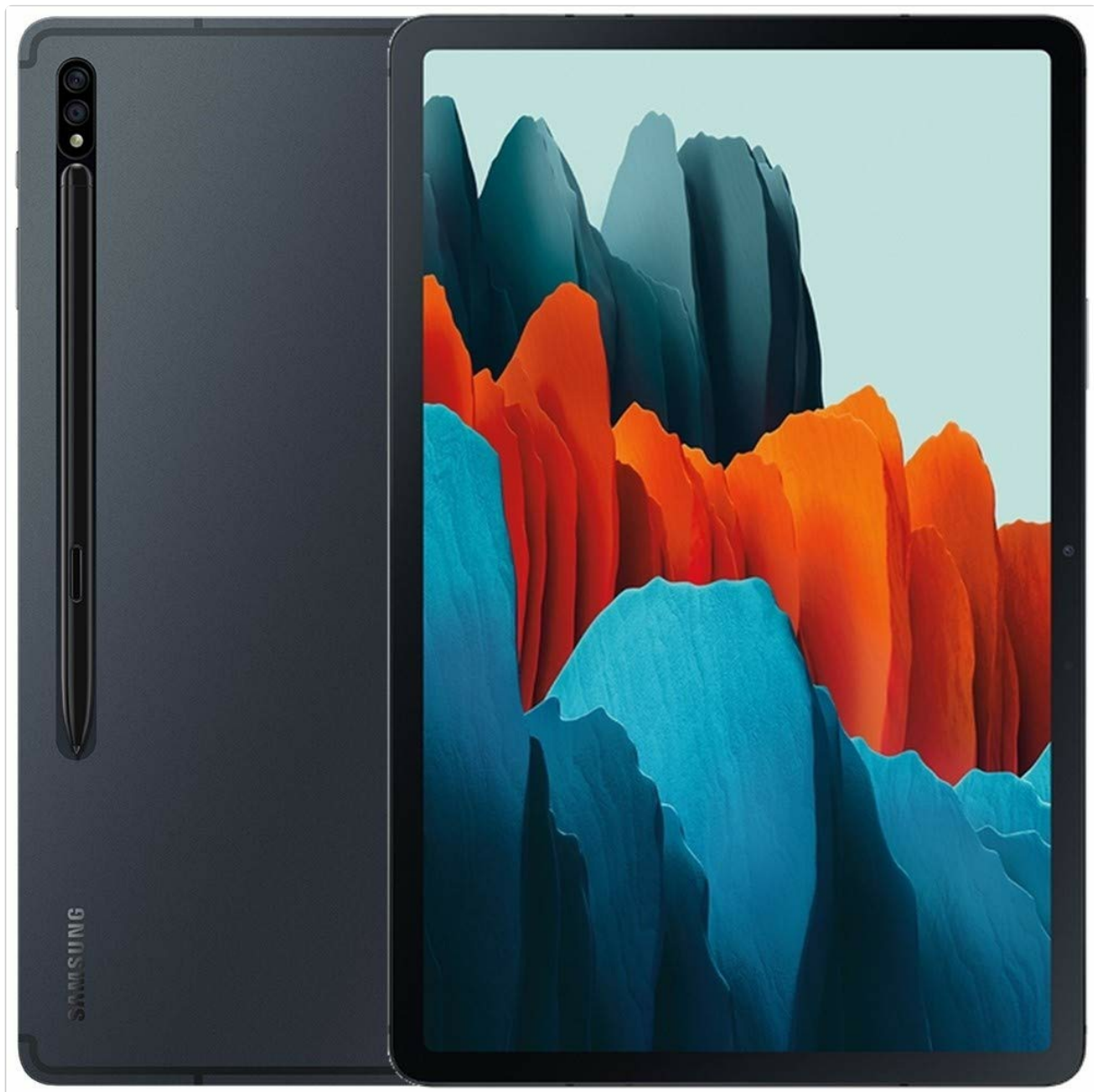
Figure 2: Back view of the Galaxy Tab S7+ showing S Pen magnetic attachment.

The S Pen magnetically attaches to the back of the tablet, near the camera module, for storage and charging. Ensure it is securely attached to maintain charge and functionality.