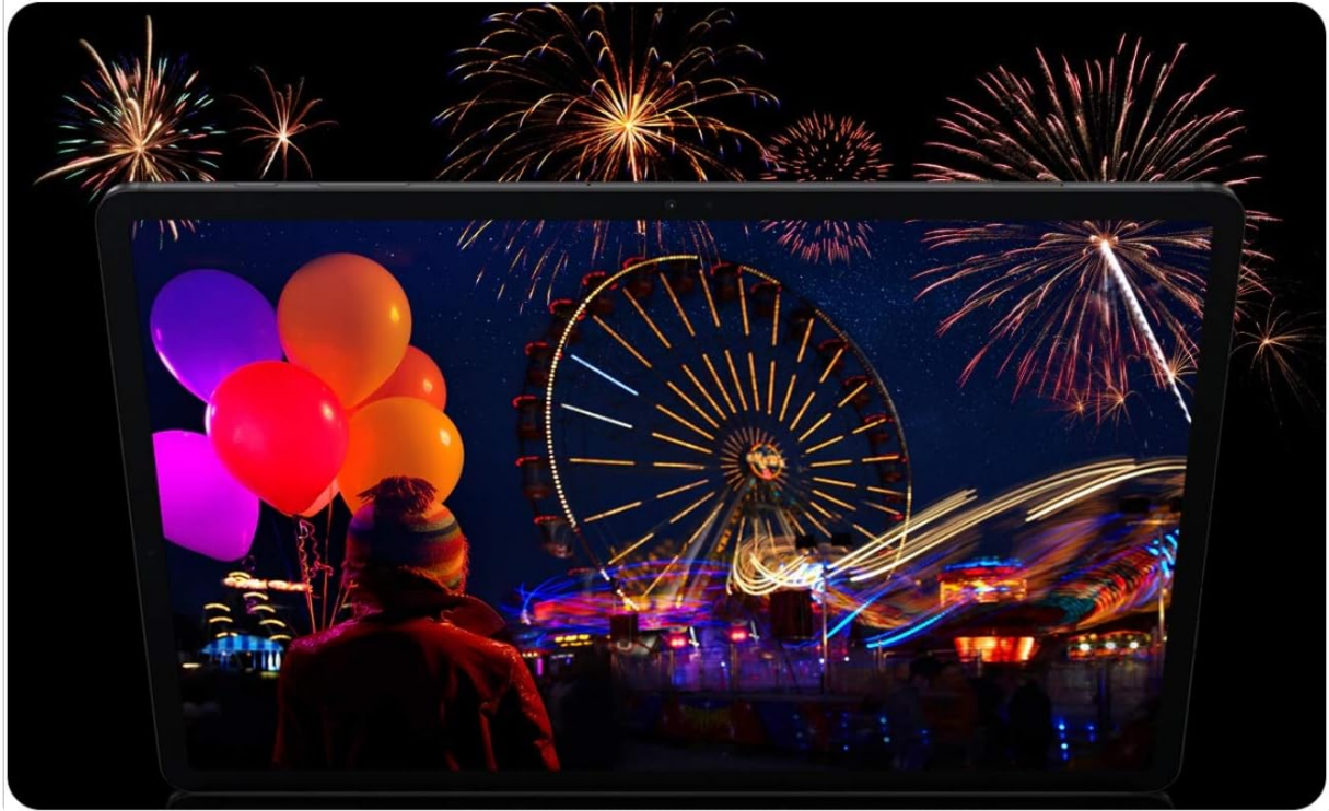
Figure 3: The tablet's Super AMOLED display showcasing vibrant colors.

Experience cinematic viewing in your hands with the 12.4" Tab S7+. With an edge-to-edge display and sAMOLED™ screen, colors are more vibrant and graphics are more immersive—perfect for enjoying movies, playing games and making video calls. Quad speakers tuned by AKG® supply Dolby Atmos surround sound and elevate audio to new heights.