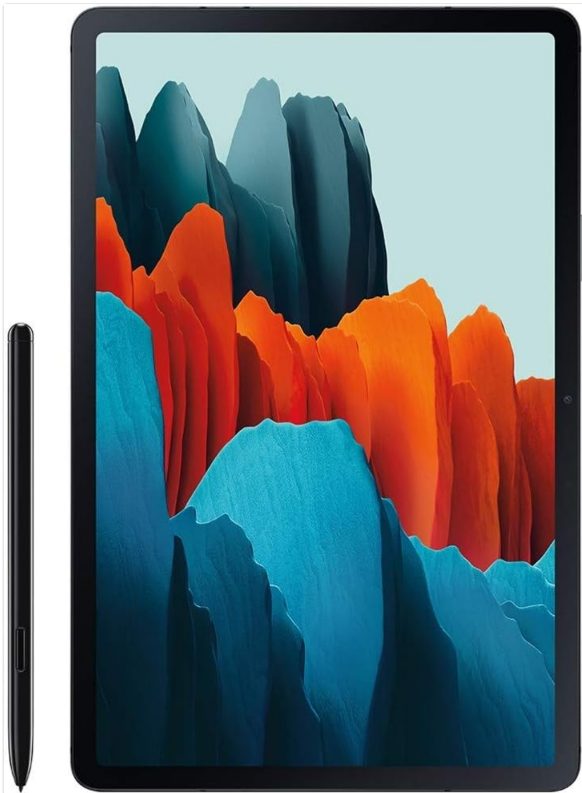
Figure 1: Front view of the Galaxy Tab S7+ with S Pen attached.