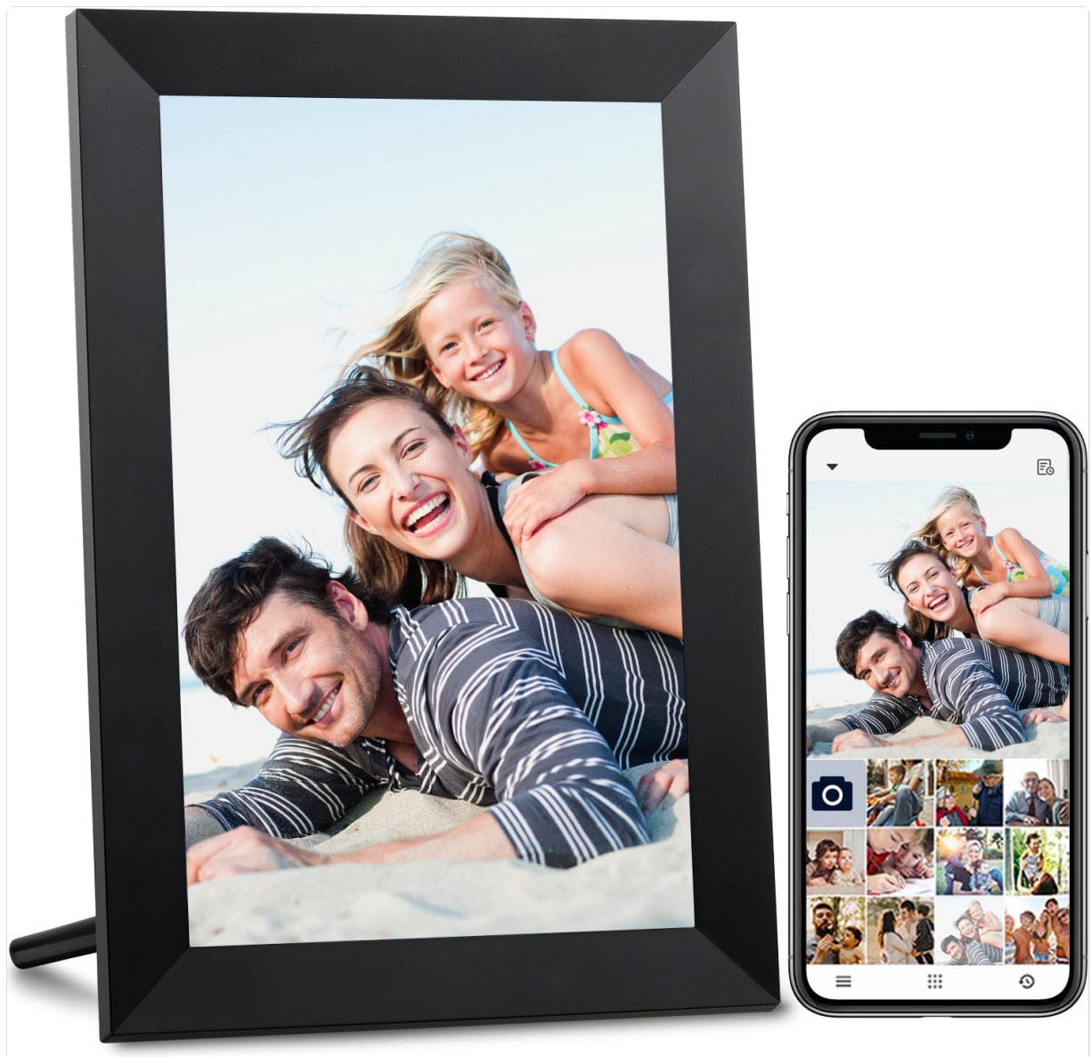
Figure 3.1: Front view of the AEEZO Digital Picture Frame alongside a smartphone displaying the AiMOR app interface.