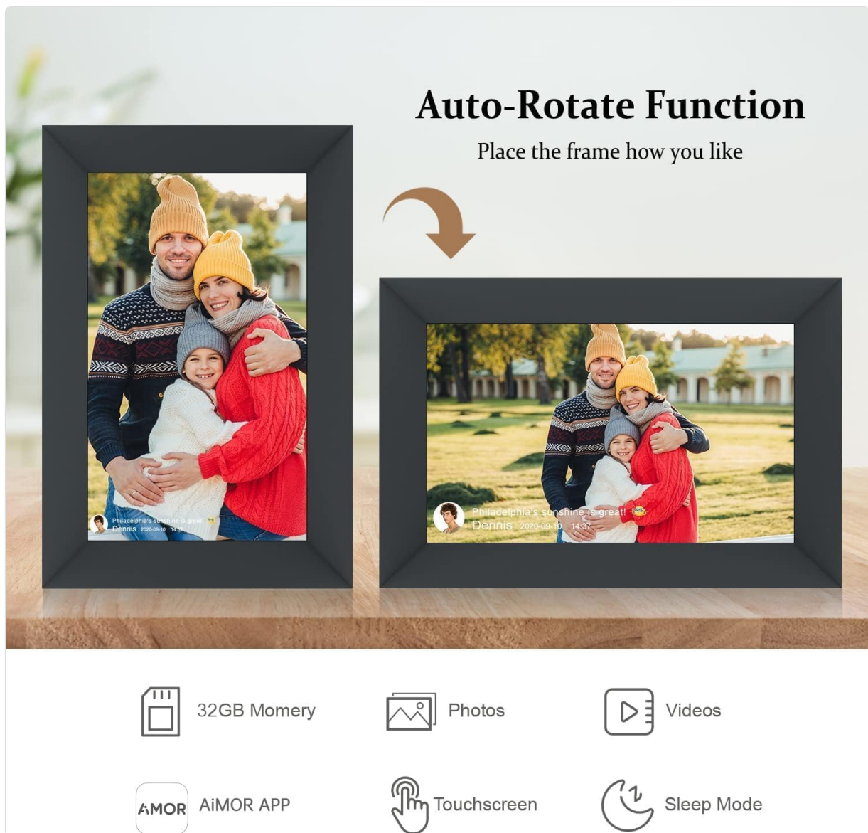
Figure 3.2: Rear view of the AEEZO Digital Picture Frame, illustrating its auto-rotate capability and key features.