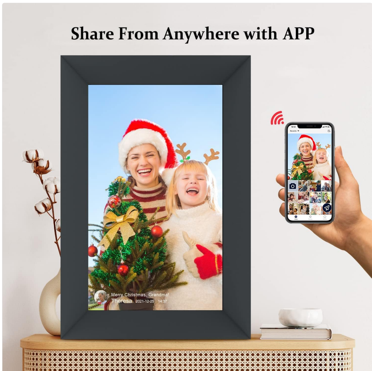
Figure 5.1: Wireless sharing of photos and videos to the digital picture frame using the AiMOR app.