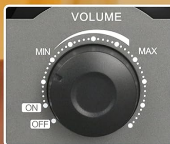
Big volume knob