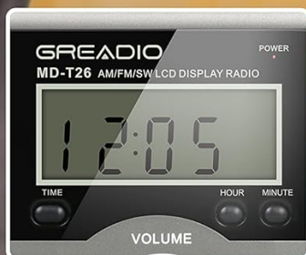
Clear LCD Screen: time & frequency display