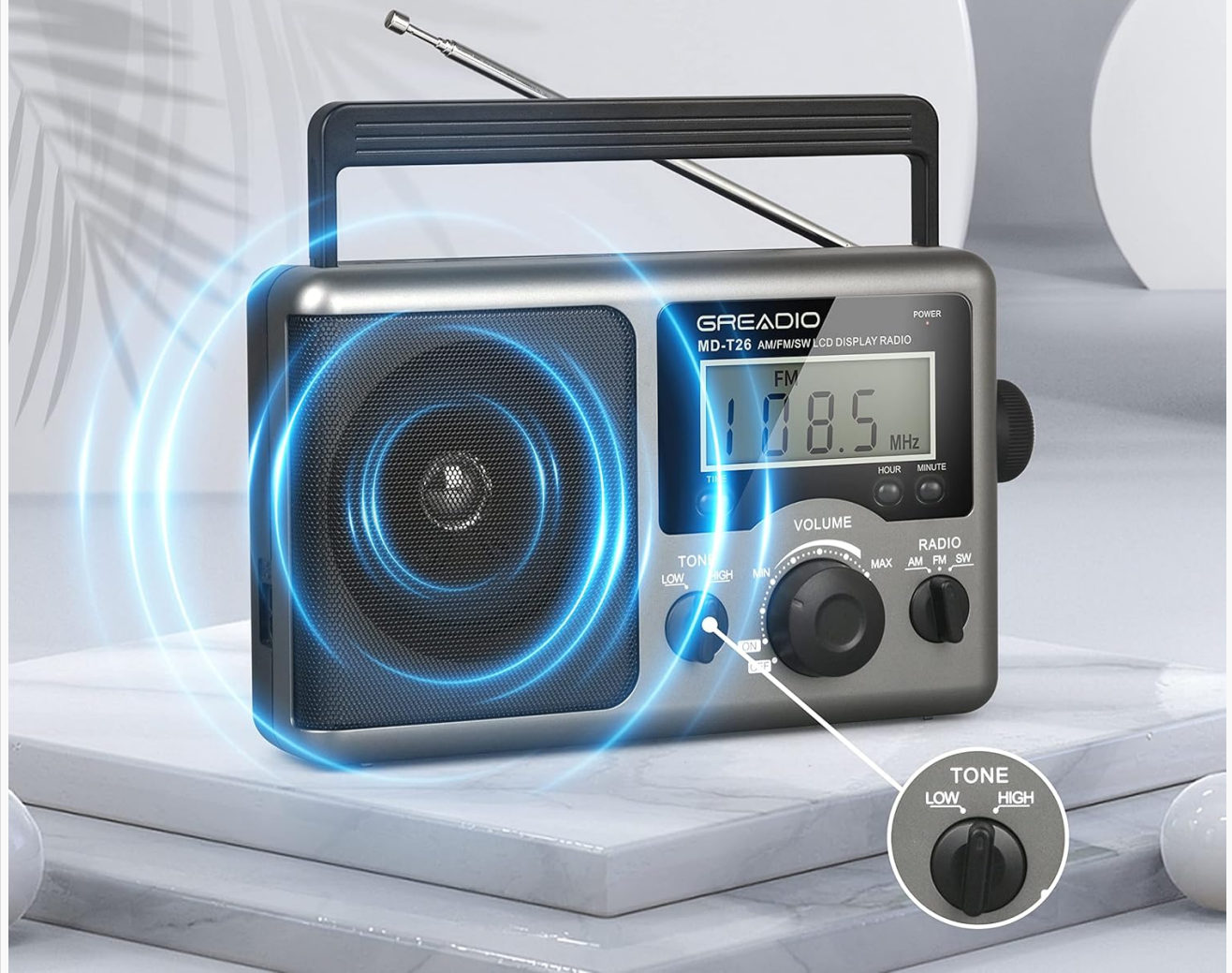
Figure 5: The tone control switch allows adjustment between low and high audio frequencies.

Choose high/low tone modes as you like while listening