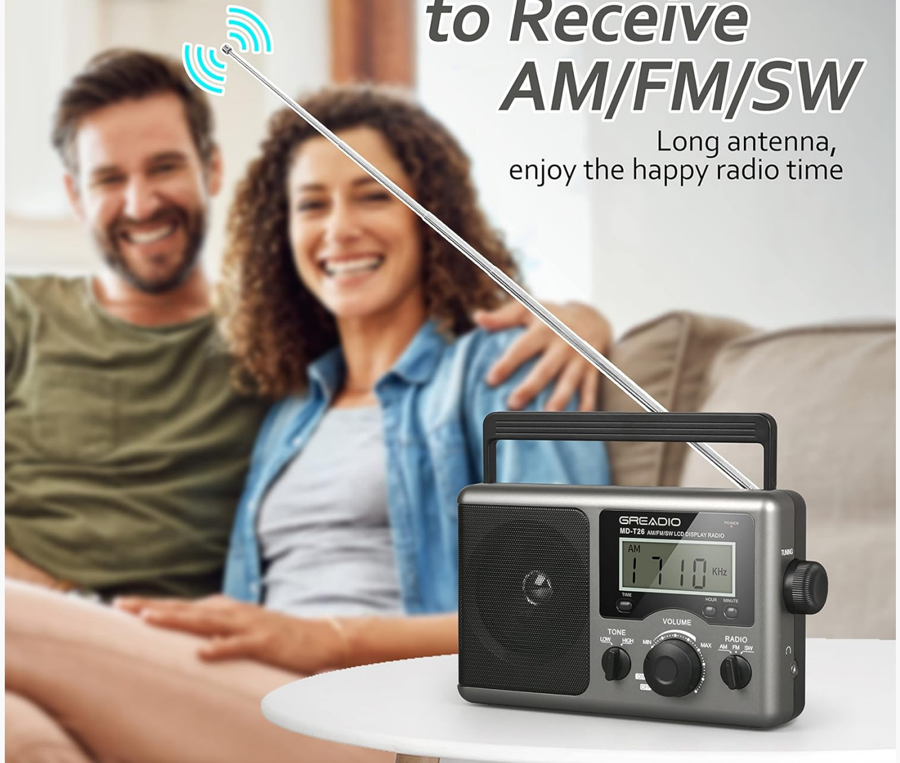
Figure 4: The radio's extendable antenna, crucial for strong AM/FM/SW reception.

Long antenna, enjoy the happy radio time