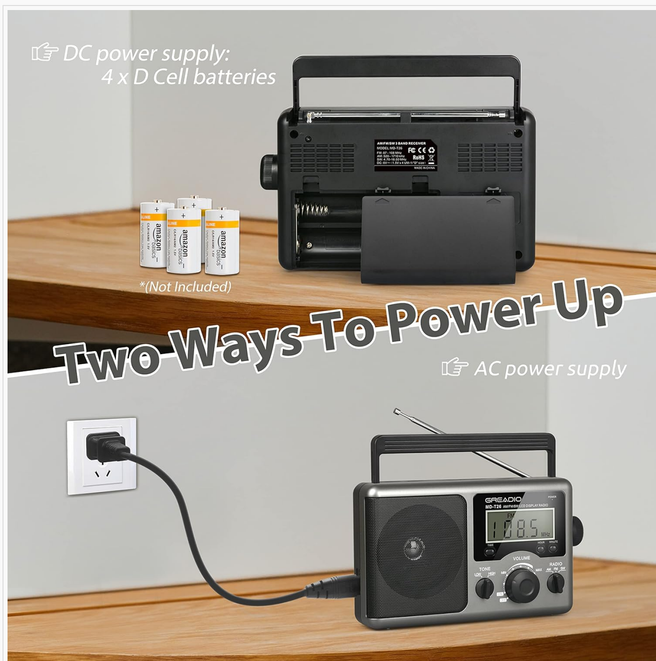
Figure 2: Illustration of the two power supply methods: AC power and D Cell batteries.

Important: When using AC power, it is recommended to remove the D Cell batteries to prevent potential short-circuiting and damage to the radio.