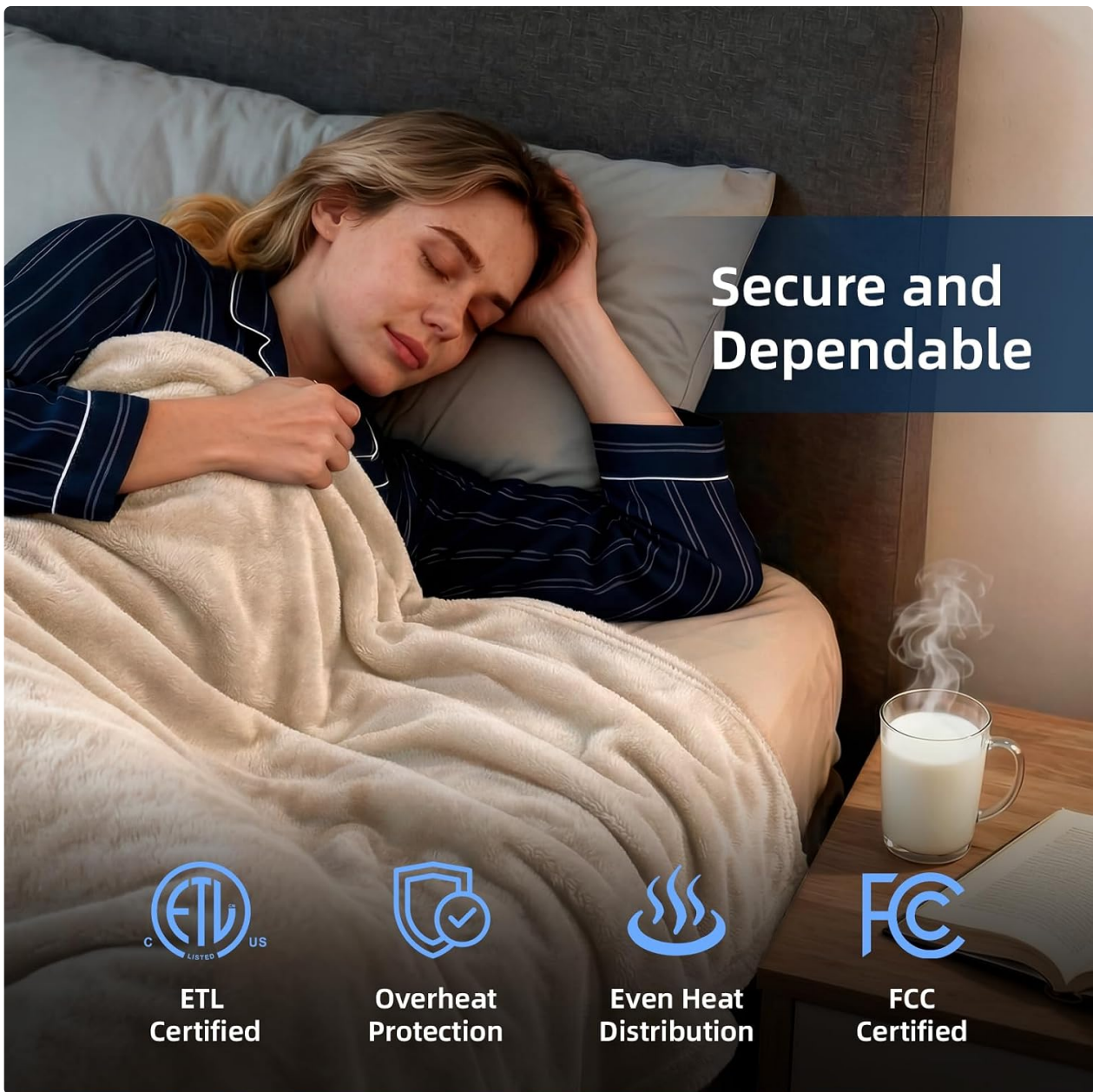
Figure 2.2: Safety and Feature Icons