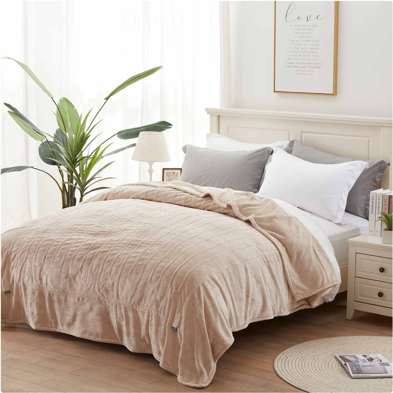
Figure 2.1: Westinghouse Heated Electric Twin Blanket (Beige)