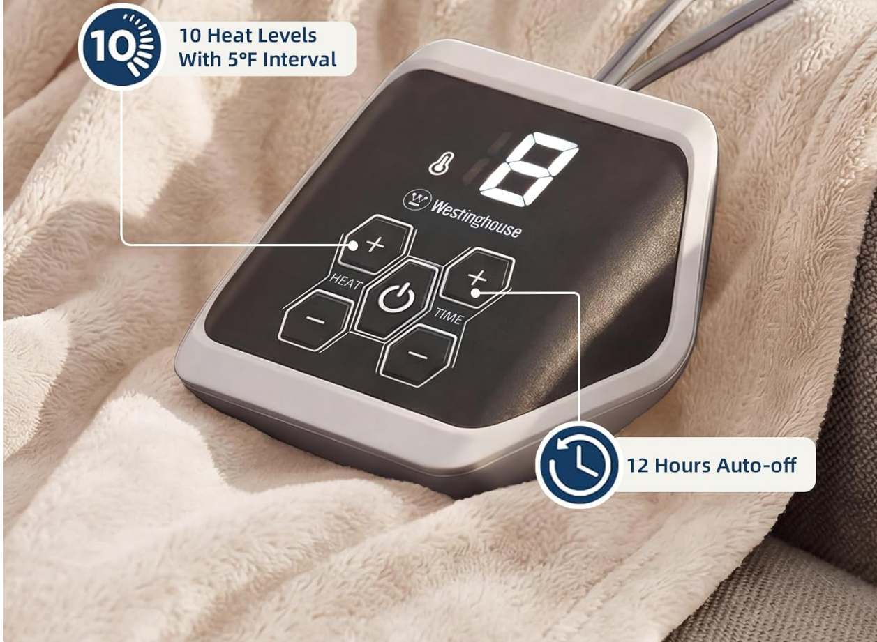
Figure 4.1: Controller Interface with Heat and Timer Settings

Video 4.1: Demonstrating the use of the controller to adjust heat settings and timer on the Westinghouse Electric Blanket. The video shows pressing buttons to change temperature and duration.