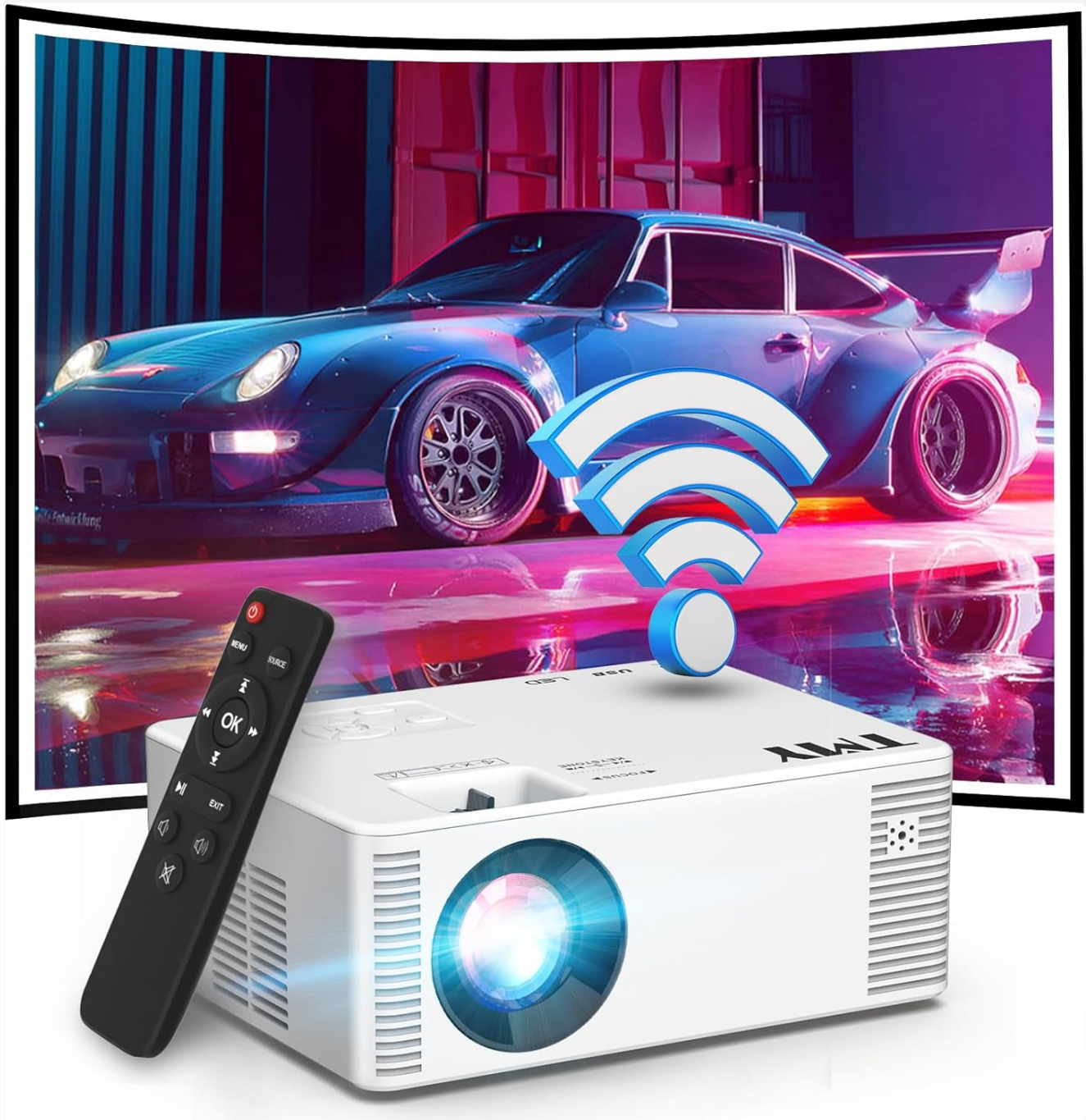
Image: TMY Mini WiFi Projector V28 with its remote control, projecting an image onto a screen.

This corrects distorted images when the projector is not perfectly aligned with the screen. Refer to the on-screen menu for specific adjustment options.