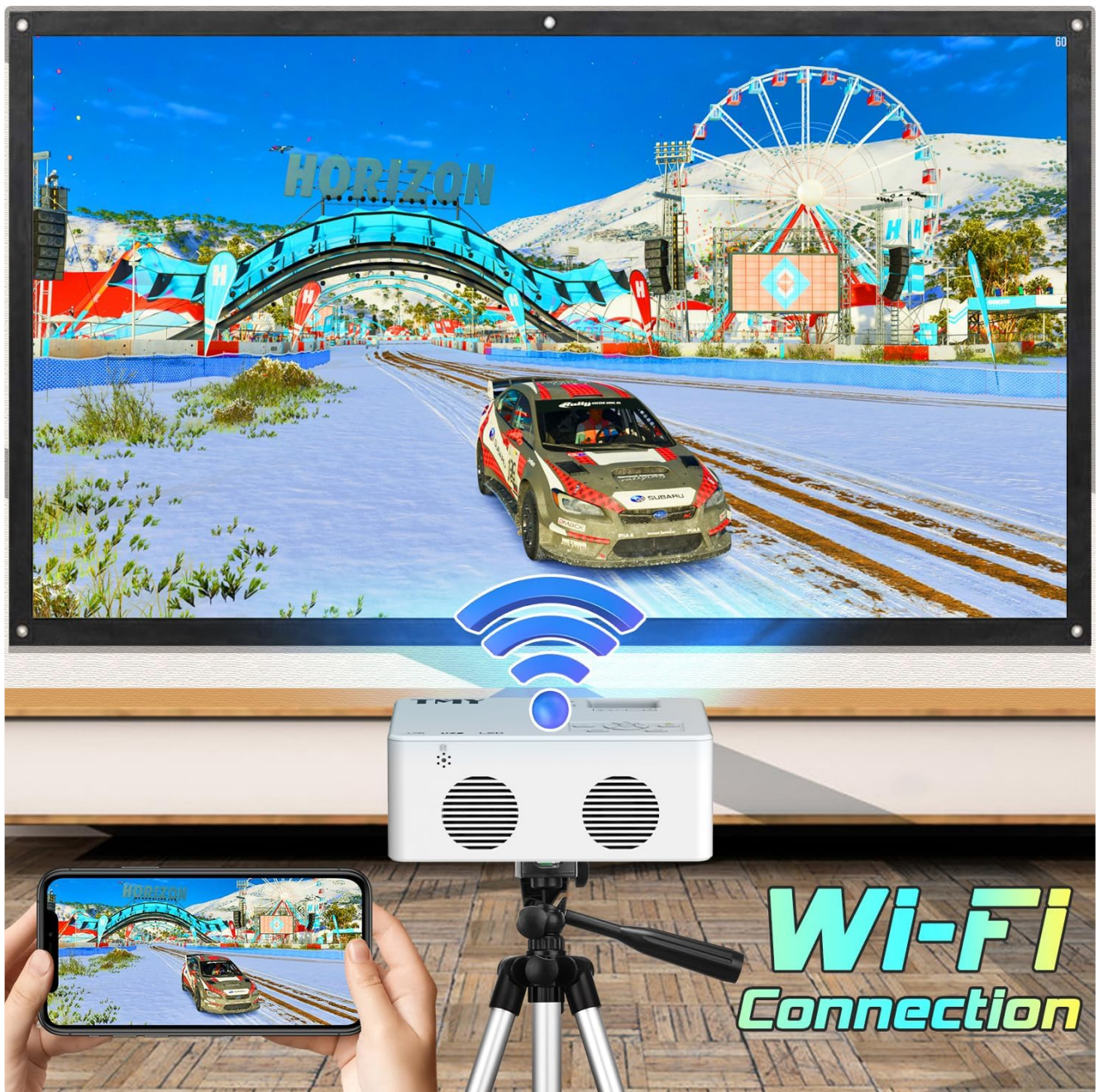
Image: The TMY projector wirelessly connected to a smartphone, mirroring a racing game onto a large screen, highlighting its WiFi connection capability.