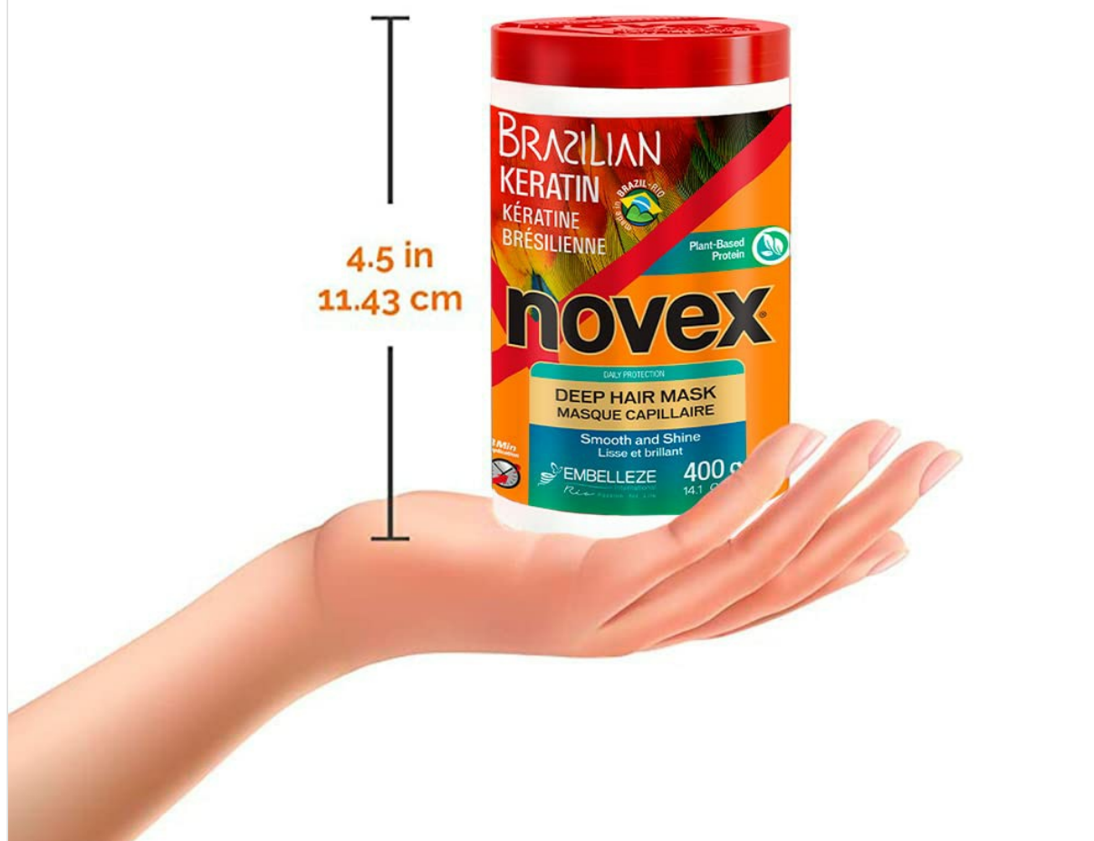
Image 7.2: Dimensions of the Novex Brazilian Keratin Deep Hair Mask container, approximately 4.5 inches (11.43 cm) in height.