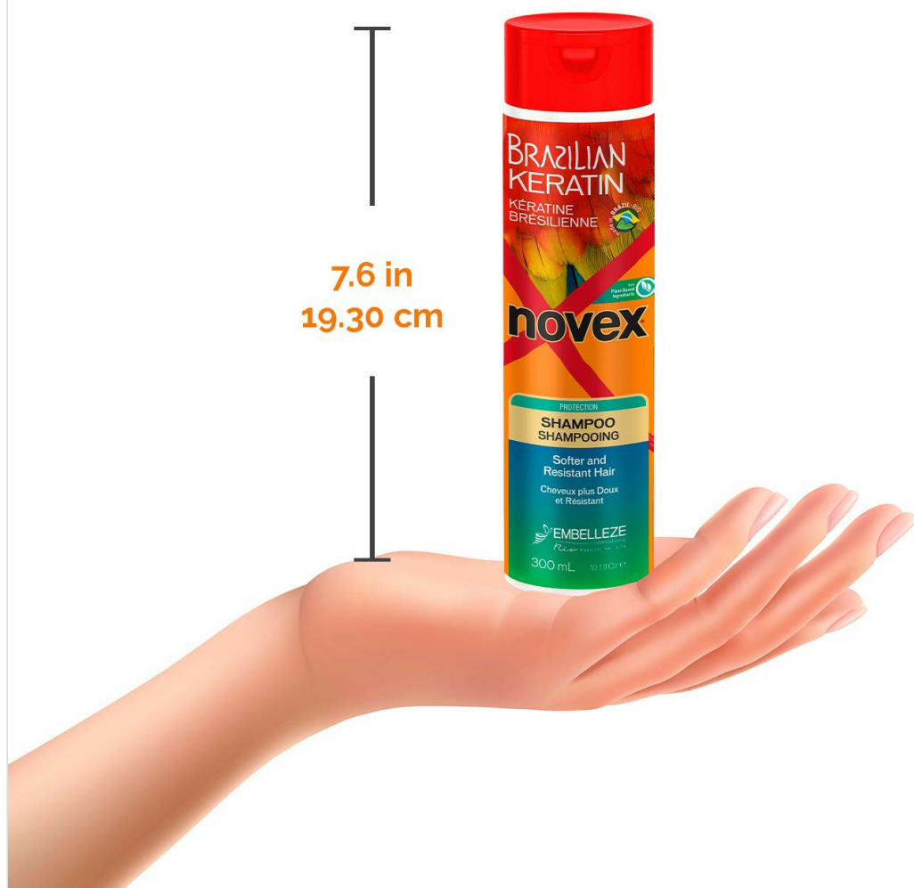
Image 7.1: Dimensions of the Novex Brazilian Keratin Shampoo bottle, approximately 7.6 inches (19.30 cm) in height.