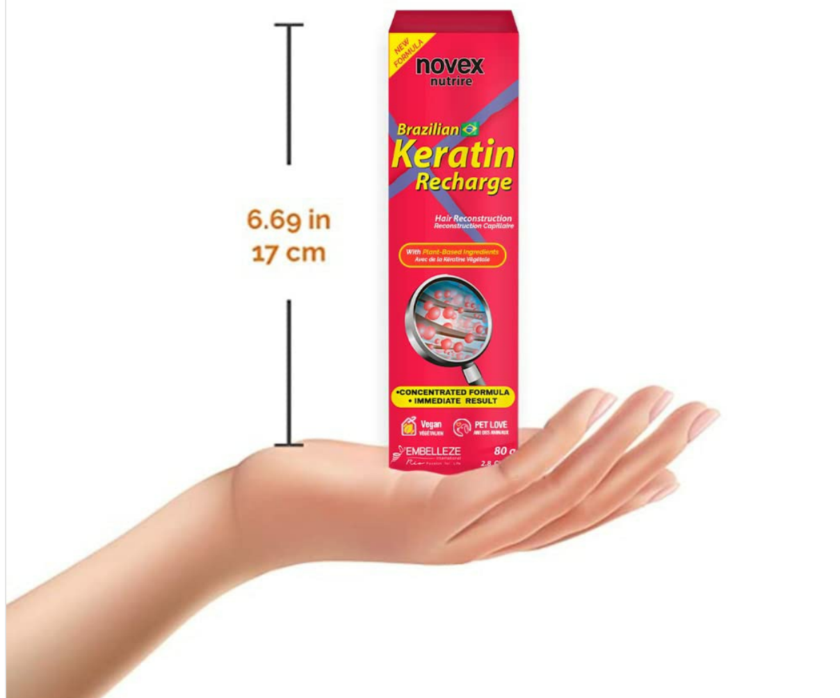
Image 7.3: Dimensions of the Novex Brazilian Keratin Recharge tube, approximately 6.69 inches (17 cm) in height.