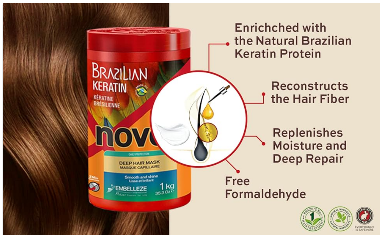
Image 2.1: Visual representation of Brazilian Keratin benefits, including reconstruction of hair fiber, replenishment of moisture, deep repair, and being formaldehyde-free.