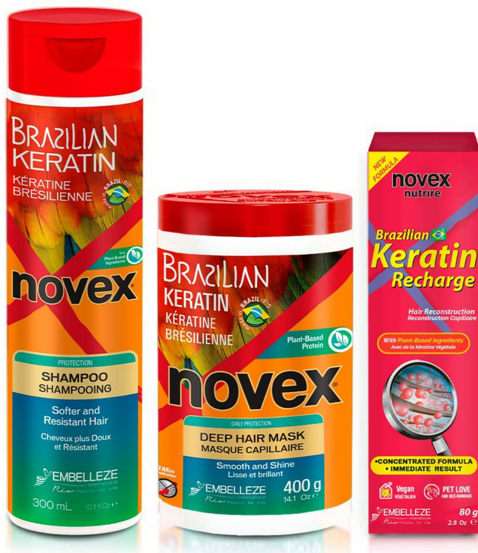
Image 1.1: The complete Novex Brazilian Keratin Hair Treatment Recharge Bundle, featuring the shampoo, deep hair mask, and keratin recharge.