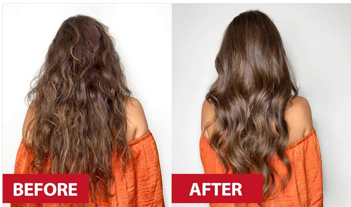
Image 2.2: Before and after comparison showing the smoothing and frizz-reducing effects of the treatment on hair.