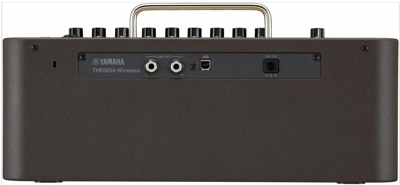
Figure 3: Rear Panel Connections. This image shows the back of the amplifier with labels for the Line Out, USB, and 15V DC In ports.