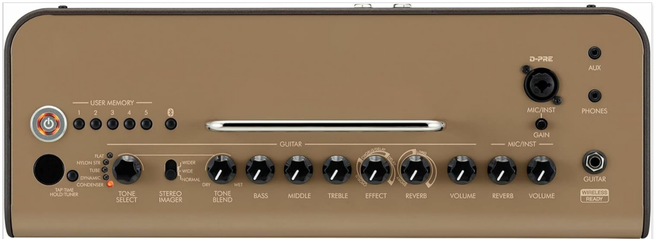
Figure 2: Top Panel Controls. This image displays the top control panel of the amplifier, showing the various knobs and input jacks for guitar and microphone.

For acoustic-electric guitars, connect a standard 1/4" instrument cable to the GUITAR input jack on the top panel. For microphones, use an XLR cable to connect to the MIC/INST input. This input also supports instruments with a 1/4" jack.