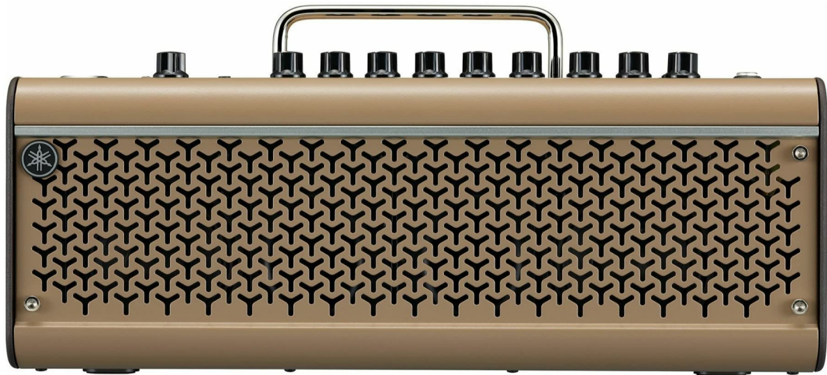
Figure 1: Yamaha THR30IIA Wireless Acoustic Desktop Amplifier. This image shows the amplifier from an angled front view, highlighting its compact design and speaker grille.