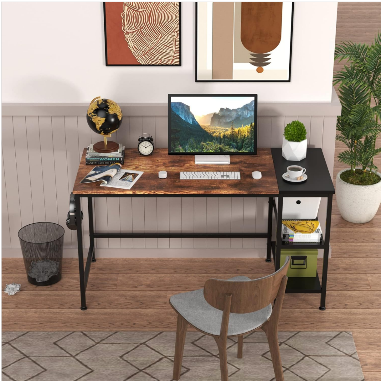
Image: Desk in Use with Single Monitor and Storage. This image presents the HOMIDEC Office Desk within a home office environment, featuring a single computer monitor, keyboard, and mouse. The integrated 3-tier storage shelves are utilized for organizing books and displaying decorative items, highlighting the desk's functional design.