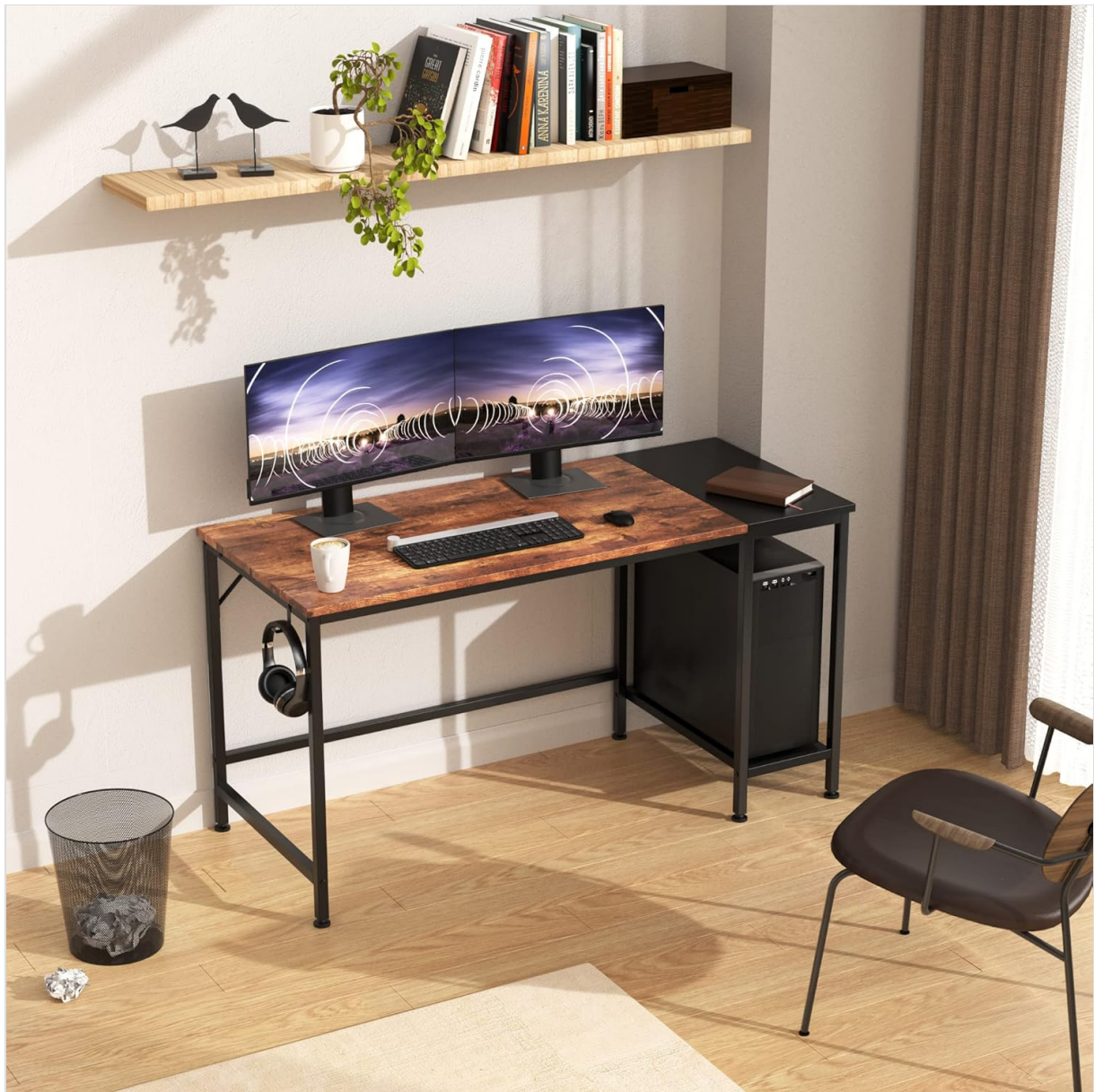
Image: Desk in Use with Dual Monitors. This image shows the HOMIDEC Office Desk set up in a room, accommodating two computer monitors, a keyboard, and a mouse on its main surface. A PC tower is neatly stored on the lower shelf of the integrated bookshelf, demonstrating practical use of the desk's features.