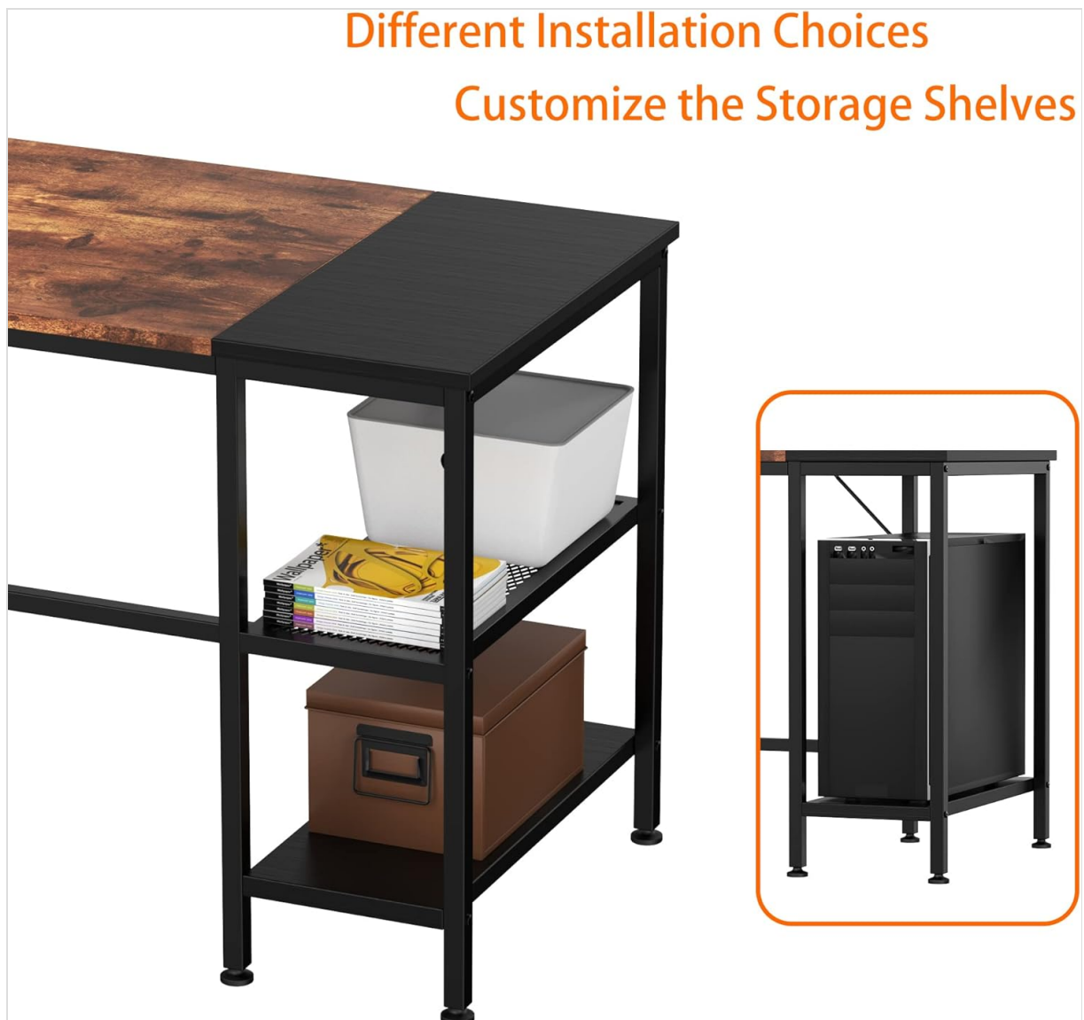
Image: Different Installation Choices for Storage Shelves. This diagram illustrates how the storage shelves can be configured on the right side of the desk, offering options for open shelving or space to accommodate a PC tower.