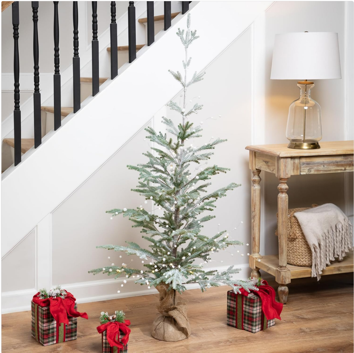
Image: The LED Pom Pom Garland creatively draped around a small, flocked Christmas tree, illustrating a possible decorative placement.