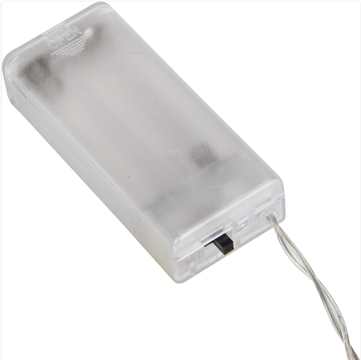
Image: The clear battery pack with the on/off switch visible on the side. This is where the AA batteries are inserted.