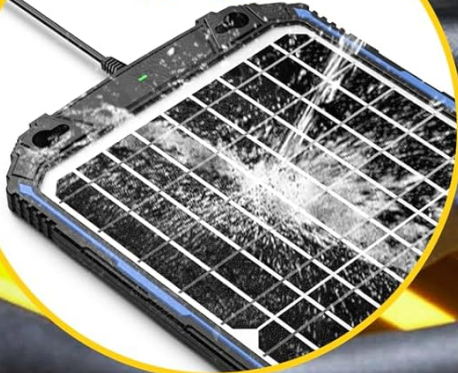
Image: The solar panel mounted on a car windshield using suction cups.