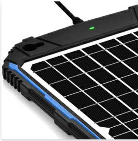
Image: Close-up of the LED indicator on the solar panel.