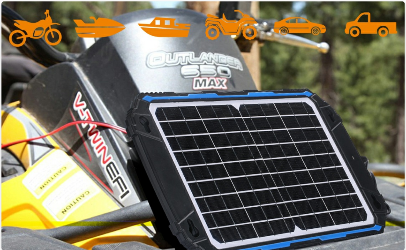
Image: The SUNER POWER Solar Battery Charger Pro highlighting its MPPT technology and robust design.