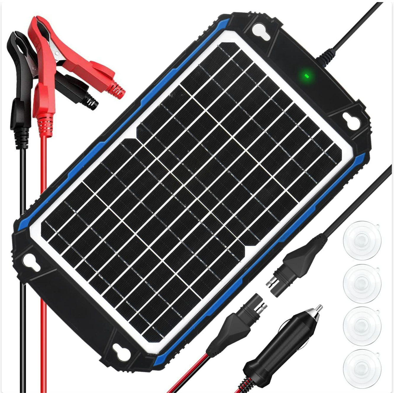
Image: The SUNER POWER BC-12W Pro solar battery charger and maintainer.