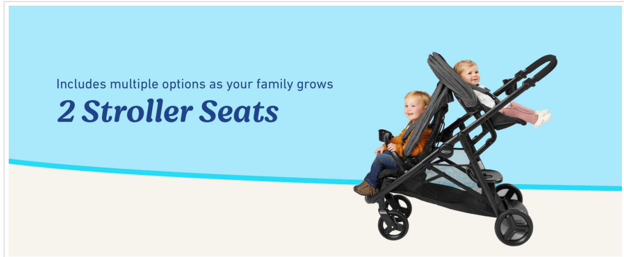
Image: The Graco Ready2Grow 2.0 Double Stroller in use with two children, and a separate image showing the stroller folded compactly for storage in a car trunk.

This stroller features a one-step, self-standing fold mechanism, allowing for compact storage and easy transport. To fold, ensure both children are removed from the stroller, then follow the instructions in your detailed manual. To unfold, release the locking mechanism and extend the frame until it clicks into place.