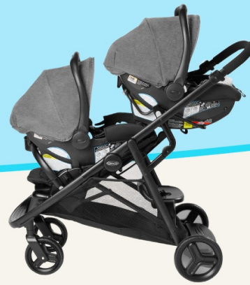
Image: The Graco Ready2Grow 2.0 Double Stroller with two Graco infant car seats securely attached.