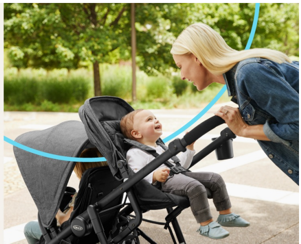
Image: A parent leaning over to interact with a baby comfortably seated in the close-to-you rear seat of the stroller.

Close-to-you rear seat to keep baby close