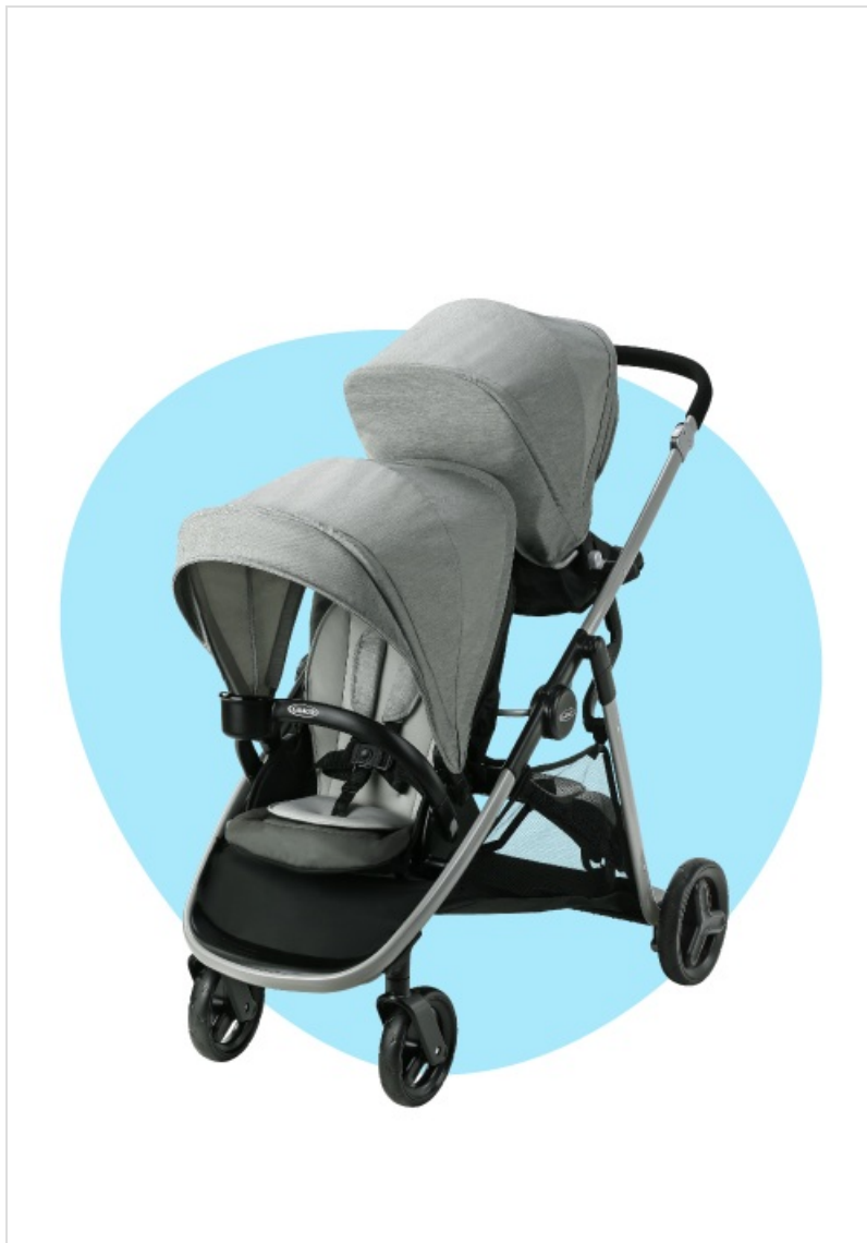
Image: A diagram highlighting key features of the Graco Ready2Grow 2.0 Double Stroller, including removable rear seat, full-size canopies, removable parent cup holder, removable child arm bar with cup holder, one-step self-standing fold, and easy-access storage basket.