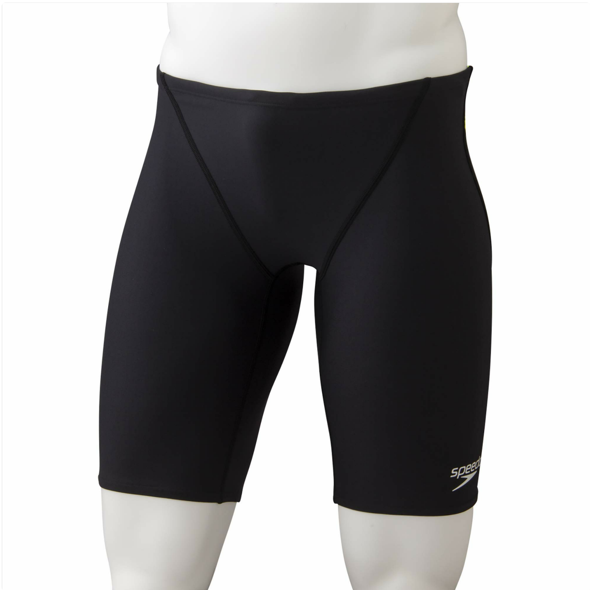
Image 1: Front view of the Speedo ST62050 Men's Jammer Swimsuit, highlighting the flash yellow accents and Speedo branding.