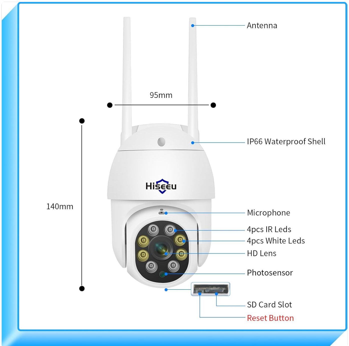
Figure 2: Camera Components

The camera features dual antennas for stable wireless connection, an IP66 waterproof shell for outdoor durability, and a lens array including IR and white LEDs for enhanced night vision. It also includes a built-in microphone and speaker for two-way audio, an SD card slot for local storage, and a reset button for system configuration.