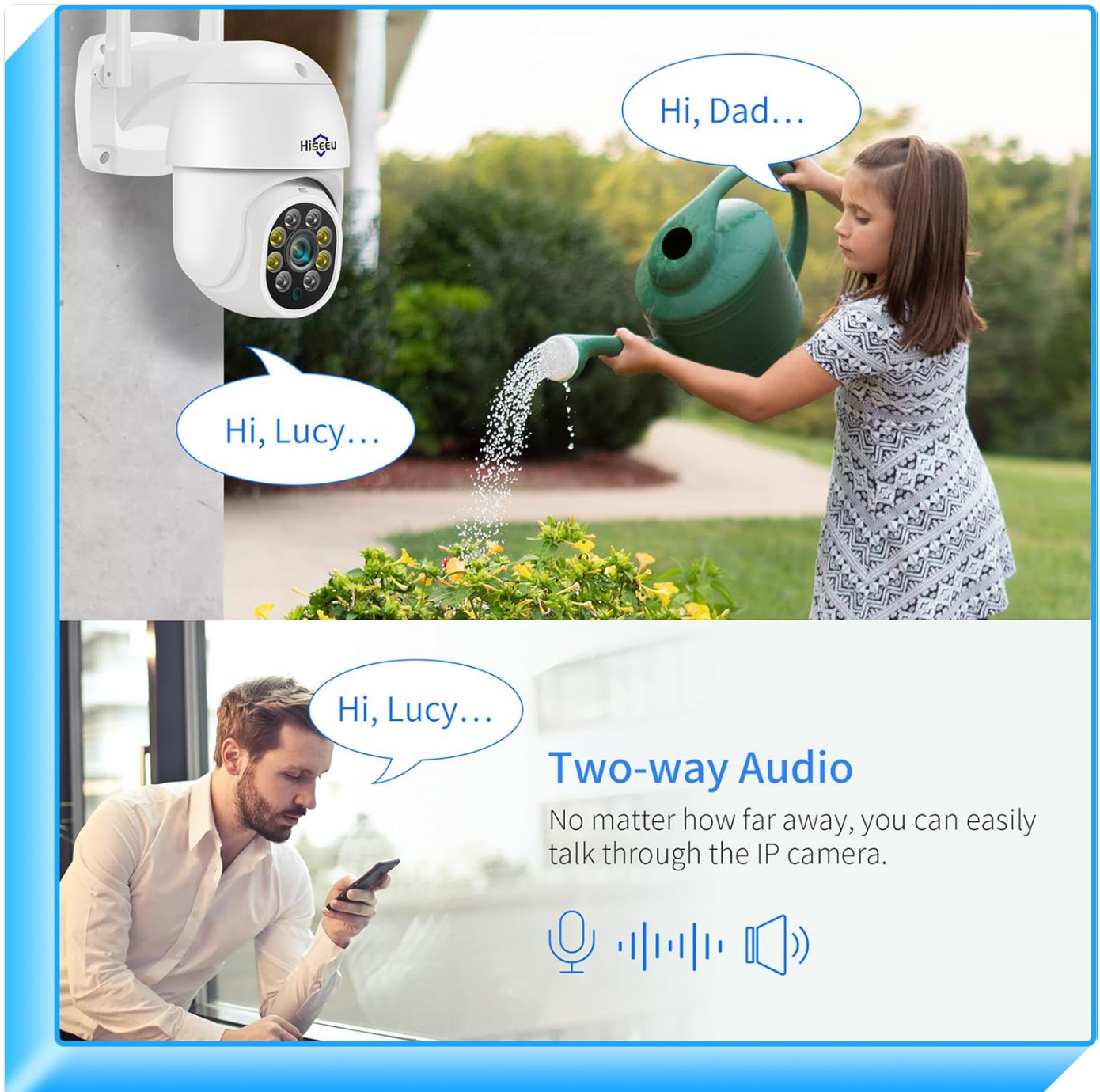
Figure 6: Two-Way Audio Functionality