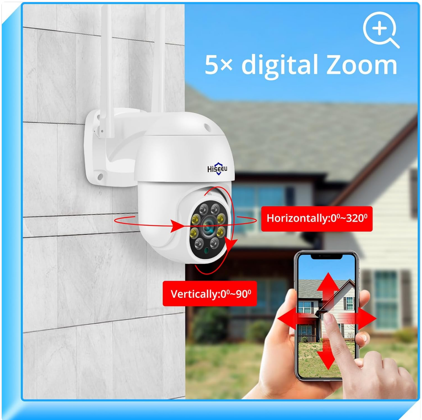
Figure 5: Pan and Tilt Movement

90° vertical tilt, along with 5x digital zoom, allowing you to monitor a wide area with precision.