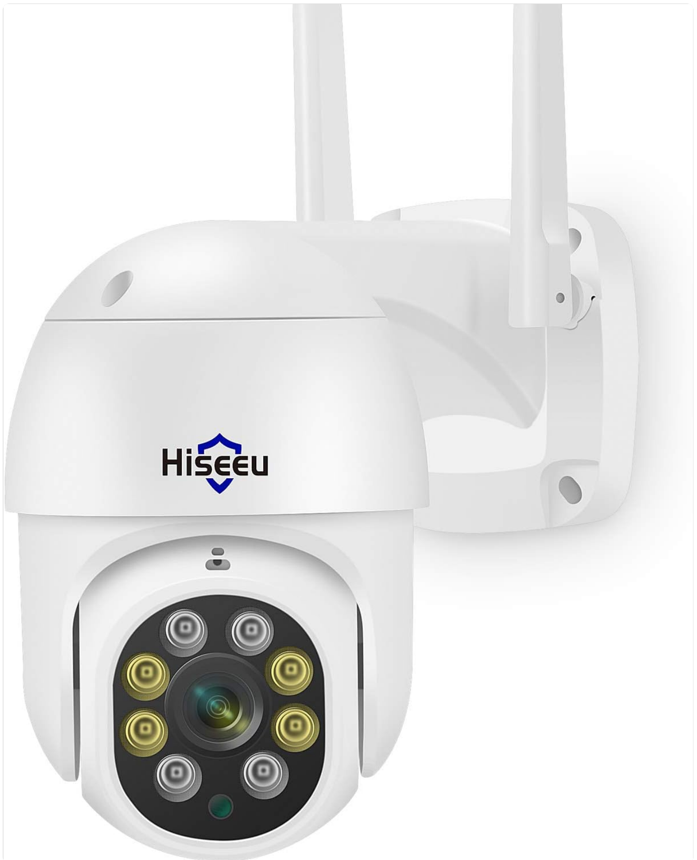
Figure 3: Camera Mounted Outdoors