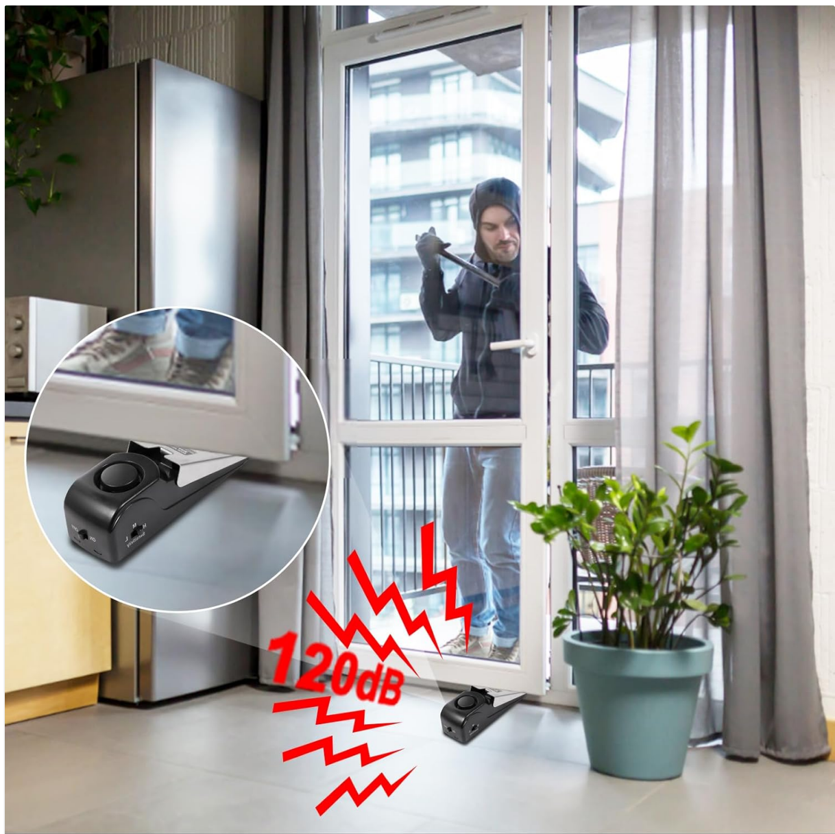
Figure 3: The door stop alarm actively deterring an intruder.