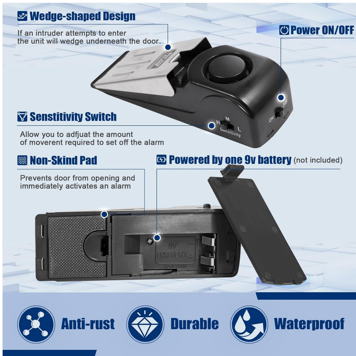
Figure 1: Key features of the TOWODE Door Stop Alarm.