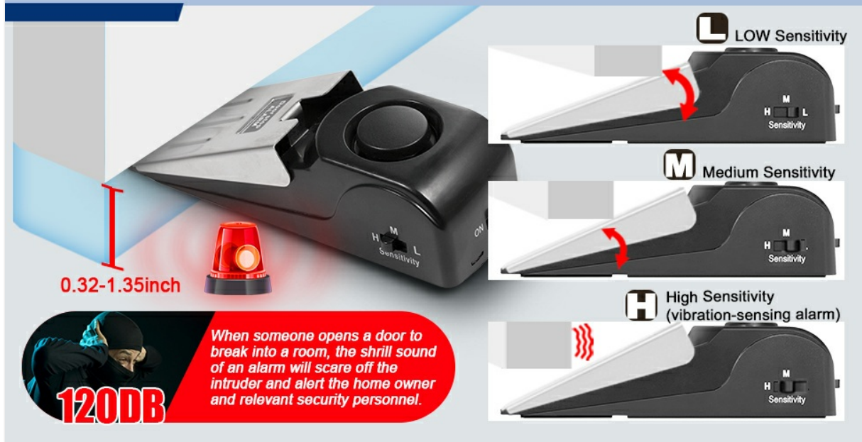
Figure 2: Step-by-step guide for installing and positioning the door stop alarm.