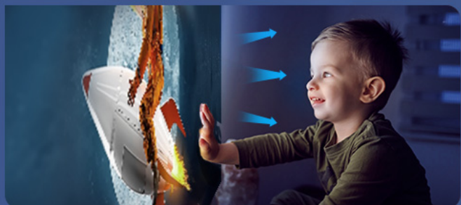
Soft Light Eye Protection