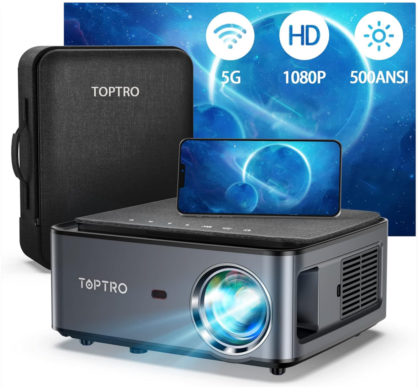
Figure 3.1: TOPTRO X1 Projector and its carrying case.