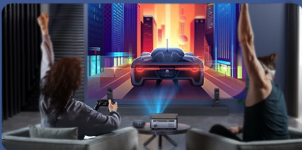
Smooth Gaming Experience