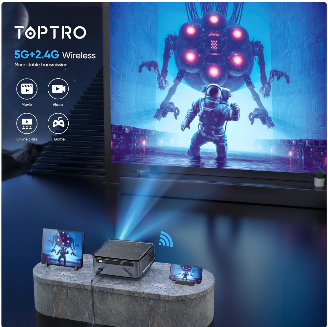
Figure 6.1: Seamless 5G+2.4G Wireless Connectivity.

Your browser does not support the video tag.