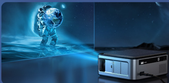
Free Projection Direction