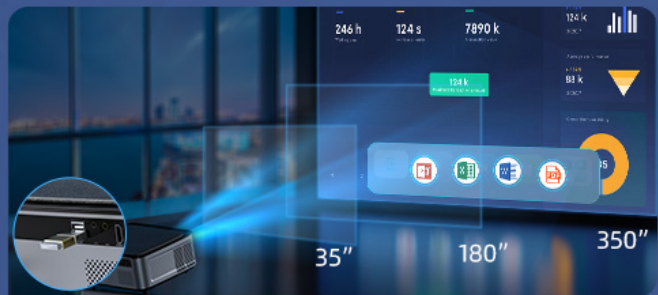
Good Partner for Small Meetings