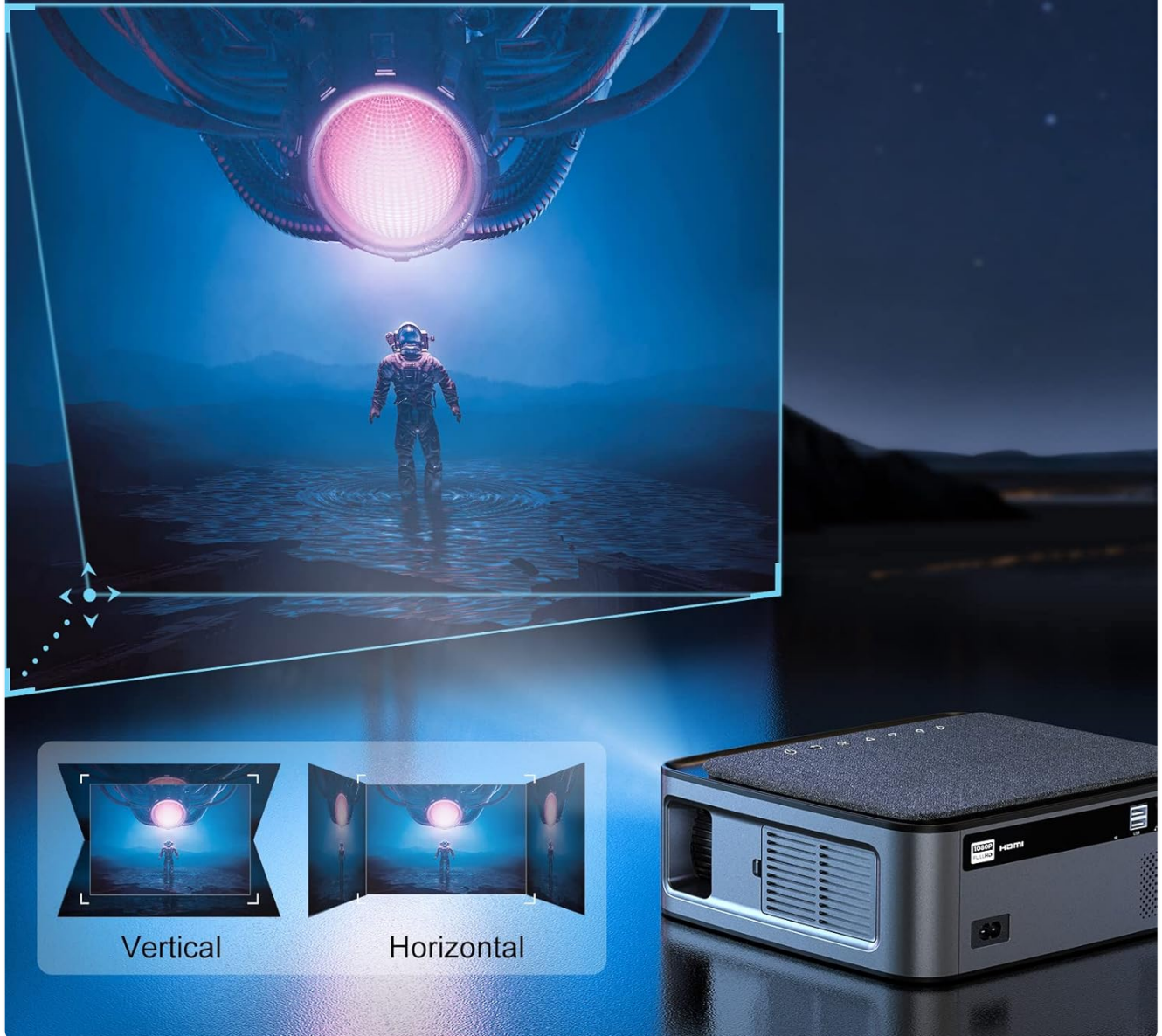
Figure 5.1: 4P & 4D Keystone Correction for perfect rectangular images.