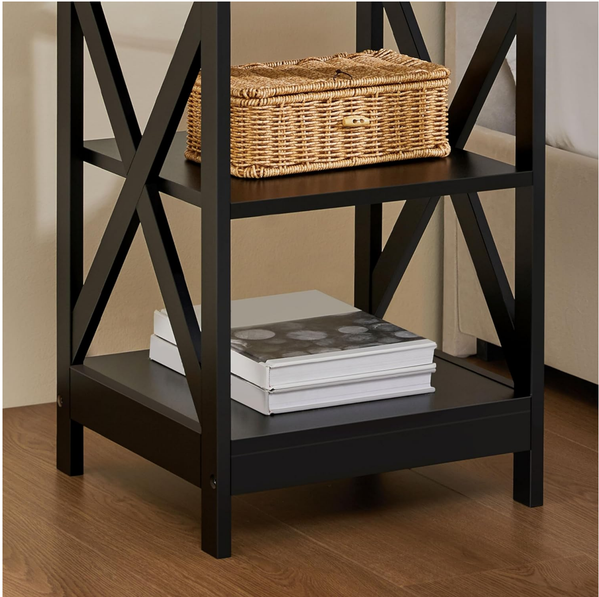
A close-up showing the engineered wood (MDF) construction, indicating the material's quality and thickness for long-term durability.