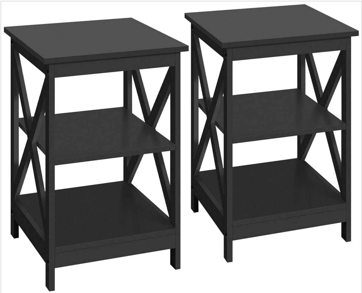
This image displays the two Yaheetech Black End Tables as they appear when fully assembled, showcasing their design and finish.