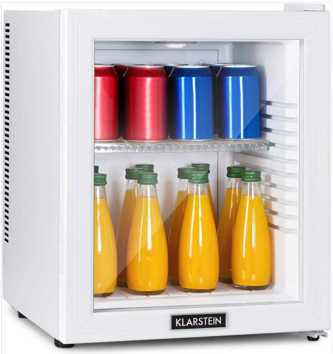
Image: The Klarstein Brooklyn Mini-Bar in white, showcasing its compact design and interior capacity filled with various beverages. The transparent glass door allows for easy viewing of contents.